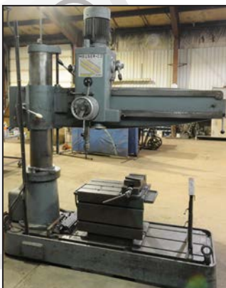
MEUSER 4' radial arm drill

ALSO: Lrg qty of rigging & lifting supplies, chains, hooks, shackles and wire rope; selection of quality hand tools, power and pneumatic tools; large quantity of raw materials consisting of ferrous and non ferrous sheet, tube, bar, flat, round stock and off-cuts; perishable tooling, drills, taps, reamers, sleeves; work benches with vises; office furniture & MUCH MORE!