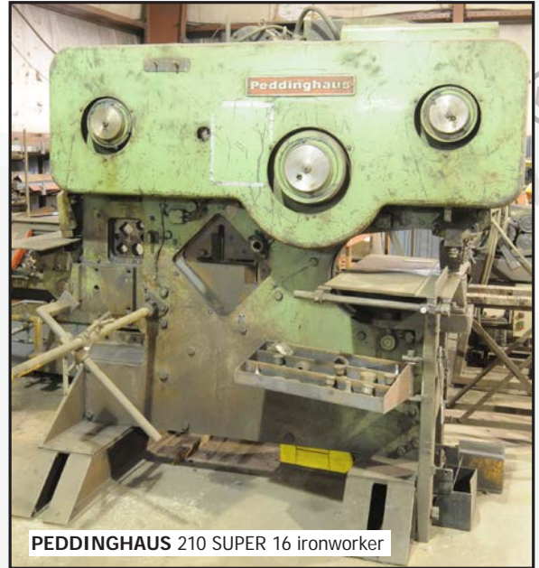
PEDDINGHAUS 210 SUPER 16 ironworker