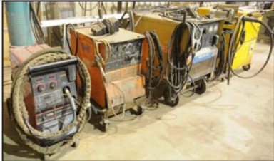
Partial view of welders and plasma cutters available