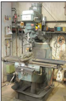
RACER milling machine