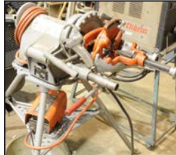
RIDGID 300 power threader