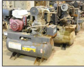
View of gas powered air compressors available