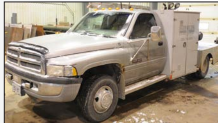
DODGE RAM3500 DIESEL service truck