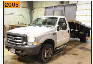
FORD F550 DIESEL flat bed truck