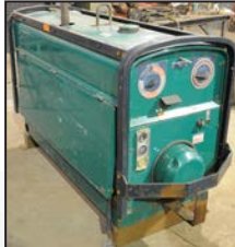
LINCOLN 600 AMP DIESEL welder