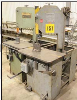
Roll in vertical band saws