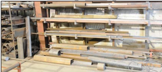
Partial view of raw materials available