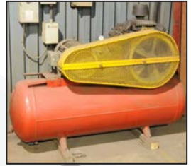
10 hp air compressor