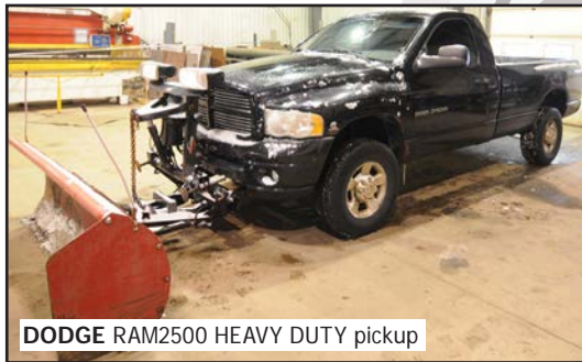
DODGE RAM2500 HEAVY DUTY pickup