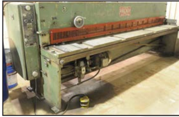
CHICAGO 10' x 10 GA hydraulic shear