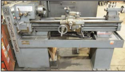
STANDARD MODERN lathe