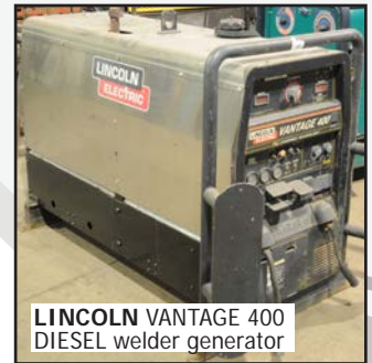
LINCOLN VANTAGE 400 DIESEL welder generator