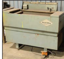
KWICK WAY head & block re-surfacing machine