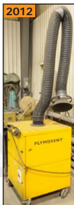
PLYMOVENT fume extractor