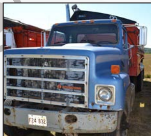
INTERNATIONAL live bottom potato truck