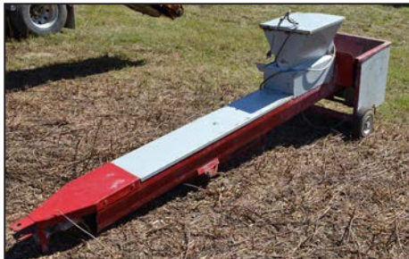
GOW seed duster