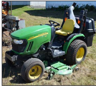
JOHN DEERE 2320 lawn tractor with bagger