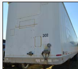
GREAT DANE 53' tri-axle trailer