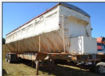
FRUEHAUF chassis trailer with live bottom potato box