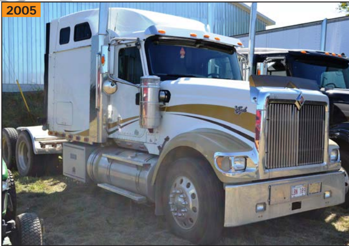
INTERNATIONAL EAGLE tandem highway tractor