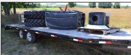
Tandem axle 24' flatbed trailer