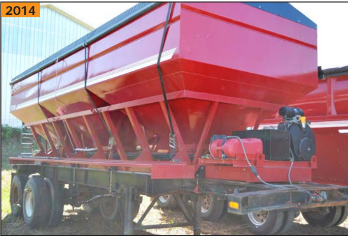
GOW FT24 24' tandem fertilizer trailer