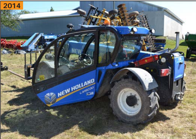
NEW HOLLAND LM5030 telehandler