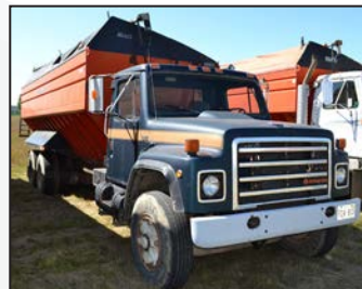
INTERNATIONAL potato truck