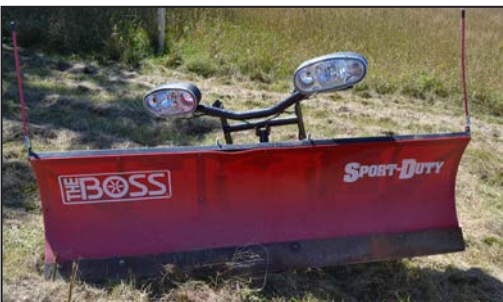
BOSS 7.5' truck mount snow plow