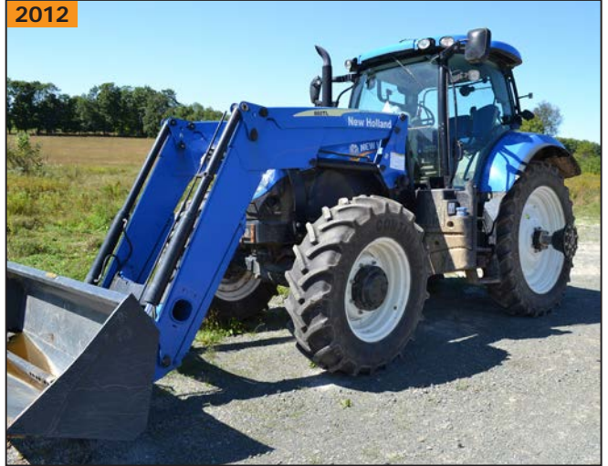
NEW HOLLAND T7 200 front end loader tractor with 860 TL loader