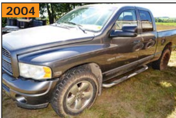
DODGE RAM 4X4 pickup truck