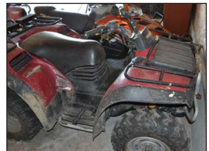
BOMBARDIER TRAXTER ATV

(3) DIESEL HEATERS, MILLER WELDERS, 50 TON SHOP PRESS, PRESSURE WASHERS, TOOLING, VAN TRAILERS, RGM STONE PICKER, ASSORTMENT OF CONVEYORS, TIRES, BUCKETS AND MORE!