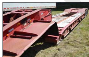
EAGER BEAVER low boy float trailer