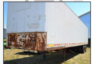
Van trailer with 3-1500 gal. water tanks