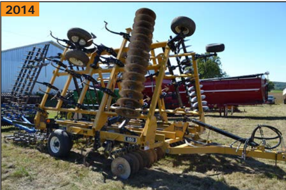
LANDOLL 850-30 finisher with packer 3130-31