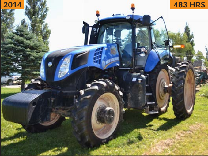
NEW HOLLAND T8-420 4WD farm tractor