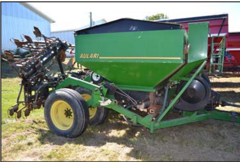
AULARI ALR 2006-ST grain drill