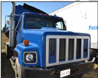
INTERNATIONAL live bottom potato truck