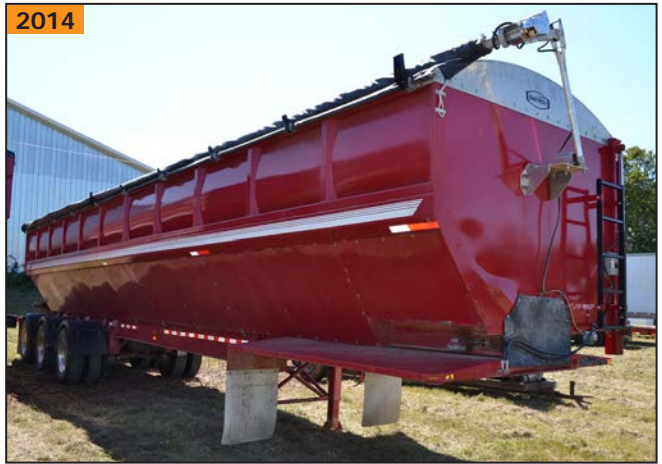
GOW B780 live bottom tri-axle potato trailer