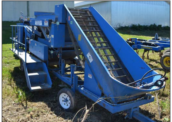
BETTER BUILT 4825 seed cutter