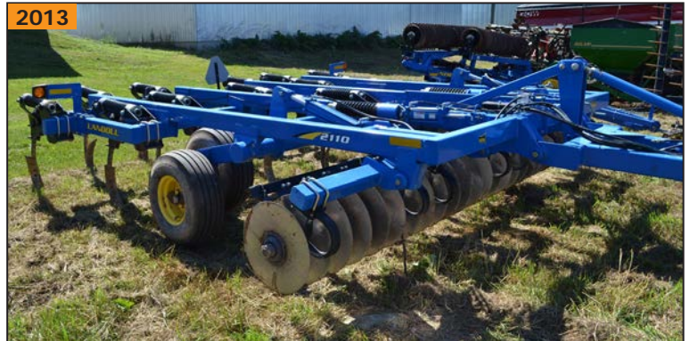
LANDOLL 2110-13 basket harrow

MOST ASSETS HAVE BEEN VERY LIGHTLY USED AND INCREDIBLY WELL MAINTAINED BY THE OWNER. MOST FEATURING LOW HOURS.