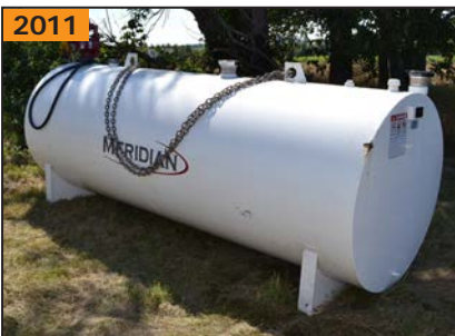
MERIDIAN 4607 L fuel tank with electric pump