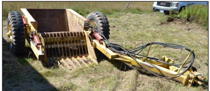
Tow behind potato