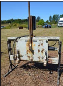
Automatic equipment potato navigator