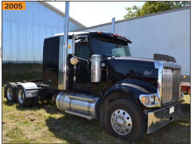
INTERNATIONAL EAGLE tandem highway tractor