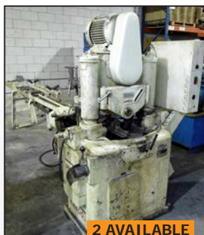
OHLER KA-400 cold saw