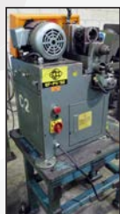
Tube chamfering machine

HARDINGE CONQUEST 42 CNC turning center with bar feed; (2) HARTFORD 10-400 thread rollers; PRAB CW20 centrifuge; TAKISAWA TA25Y CNC turning center; SUPERMAX MAX-1 REBEL CNC vertical machining center; ACME 6 spindle automatic screw machine; SOCO DEF-FA/60SS double end chamfering machine; CITIZEN CINCOM F12 CNC swiss type screw machine; (2) OHLER KA400 cold saws; 3 stage parts washer; TONG blade sharpener; FONG (2001) travelling cold saw; RICHARDS WILCOX (disassembled for transport) 3 ton single girder under slung bridge crane with approx. 26.5' span, 68' runway & bus bar, pendant control; SMERAL 40 ton air clutch press; (2) AERCOLOGY fume extractors; LARGE ASSORTMENT of surplus machinery and parts, CAT 40 tool holders, plastic collapsing bins and skids, chip conveyors, dust collectors, vertical milling machines, metal bins, LNS HYDROBAR bar feeder, RINKER boat with dual axle trailer, coil straighteners, adjustable racking and MORE!