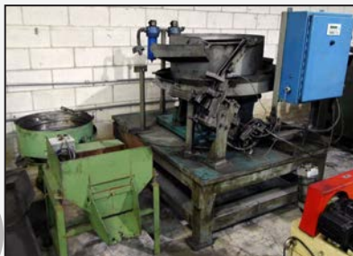
Partial view of bowl feeders available