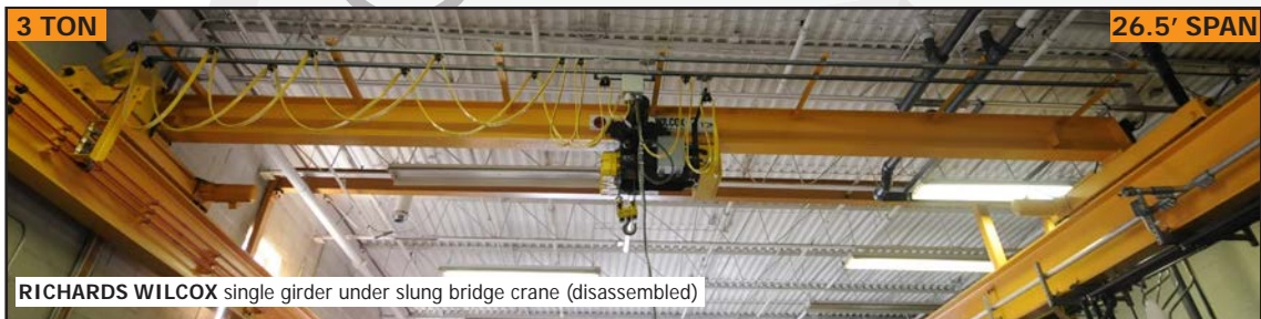
RICHARDS WILCOX single girder under slung bridge crane (disassembled)

ASSETS OF A CUSTOM MACHINING AND TUBE PROCESSING FACILITY