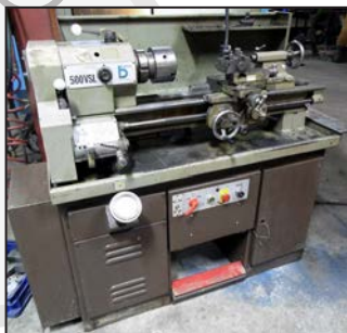
BOXFORD 500 VSL tool room lathe