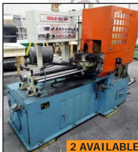
FONG-HO FH SERIES hydraulic circular cold cut saw