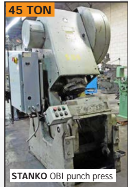
STANKO OBI punch press