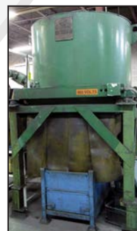
CMI CW-20 centrifuge