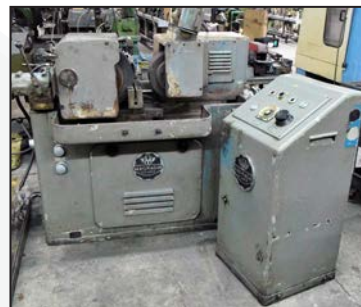
MAGNACHI centerless grinder