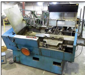
HARTFORD 10-400 thread roller