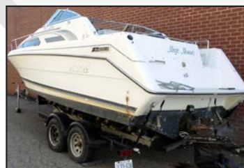
RINKER FIESTA VEE 235 cabin cruiser