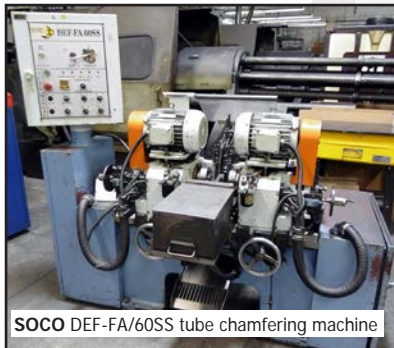
SOCO DEF-FA/60SS tube chamfering machine