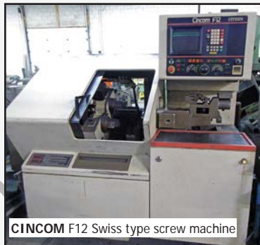
CINCOM F12 Swiss type screw machine