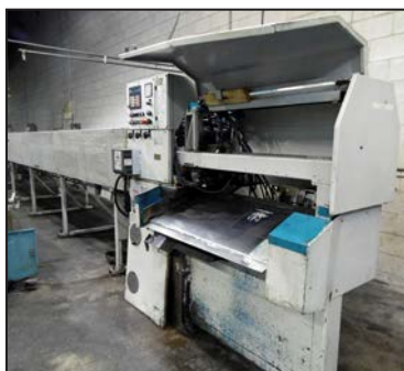
EISELE VSA-90 automatic cold saw