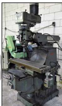
HOLKE F-10-V ram type vertical mil