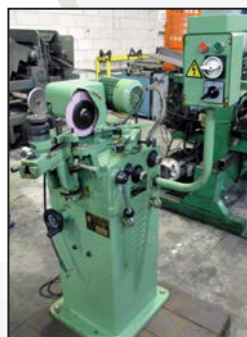
FONG-HO GS-450 tool grinder