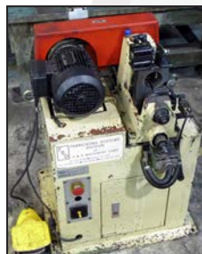
FSD FHC-50-SA single end tube chamfer machine