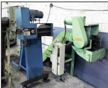
Partial view of motorized conveyors