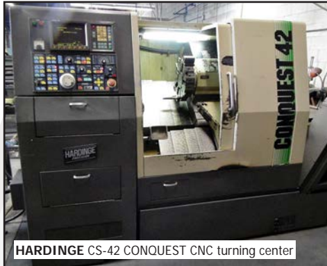
HARDINGE CS-42 CONQUEST CNC turning center