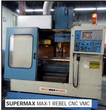
SUPERMAX MAX-1 REBEL CNC VMC

Surplus to the Ongoing Needs of MSMS ENTERPRISES LTD.