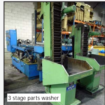
3 stage parts washer