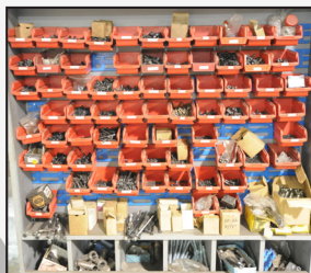
Partial view of hardware available