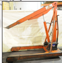
STRONGARM engine hoist