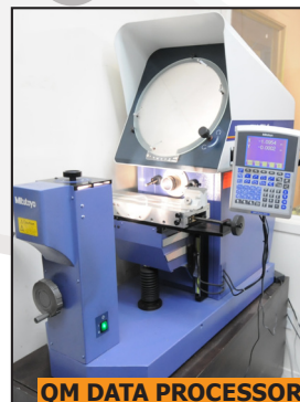
MITUTOYO PH-A14 optical comparator