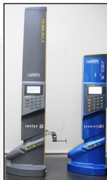
FOWLER digital height gauges