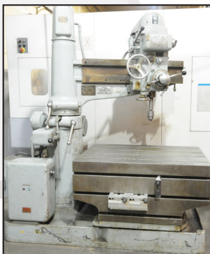
ADCOCK & SHIPLEY 3' radial arm drill