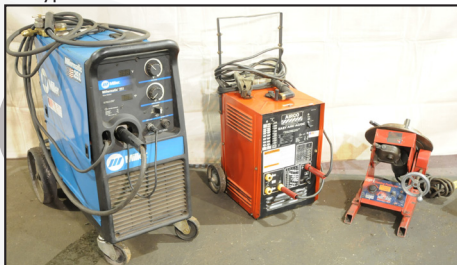
Partial view of welders available