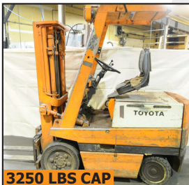
TOYOTA electric forklift