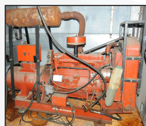
NEWAGE STAMFORD 600VOLT diesel generator