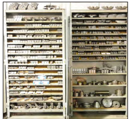
Partial view of chuck jaws available