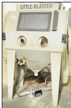
LITTLE BLASTER shot blast cabinet