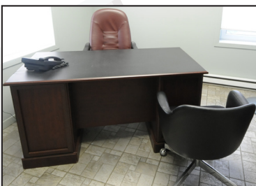
Partial view of office furniture available

ALSO: LISTA tool cabinets, perishable tooling, machine tool accessories, rotary tables, machine vises, inspection and precision equipment, large qty of raw material, dies and accessories, factory equipment, office furniture, business machines, flat screen computers, Nortel Meridian phone system with approx 15 handsets, DIGISTAR TSCC 23A digital surveillance system with (4) night vision cameras and more.