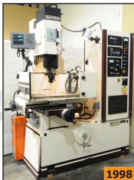
SURE FIRST ED-252 sinker type EDM