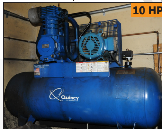
QUINCY QT-10 air compressor