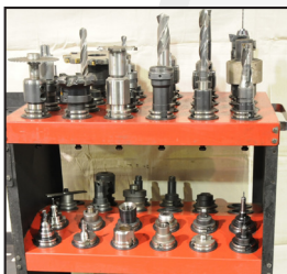
Partial view of tool holders available