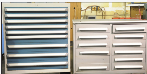
Partial view of tool cabinets available