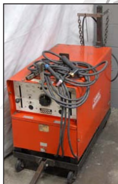
CANOX C-250E-HF arc welder