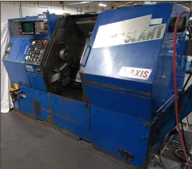
HARDINGE SUPER SLANT SB-3-GN CNC turning center