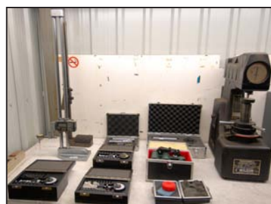
Partial view of inspection equipment available

INSPECTION: Monday, December 14 from 9:00 to 5:00 & morning of auction to start of auction.