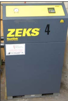
ZEKS HEATSINK 500HSFA400 true-cycling air dryer