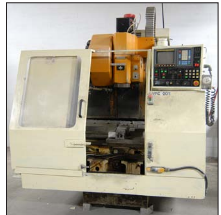
LEBLOND MAKINO vertical machining center