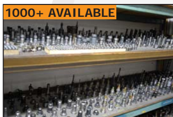
Partial view of CAT 40 tool holders available