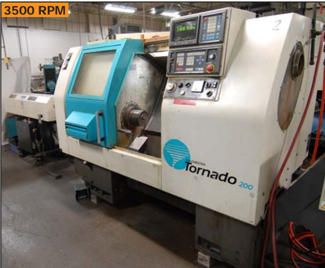
COLCHESTER TORNADO 200 CNC turning center