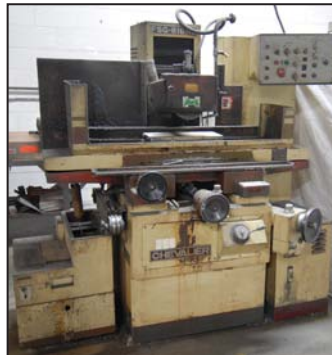
CHEVALIER FSG-818AD hydraulic surface grinder