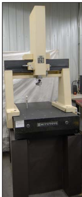
MITUTOYO B120 bridge type CMM