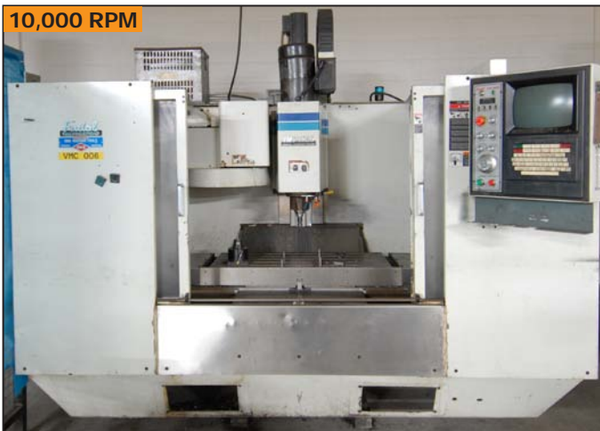
FADAL VMC4020 CNC vertical machining center