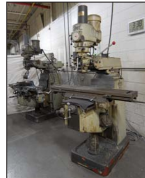
Partial view of vertical turret mills available