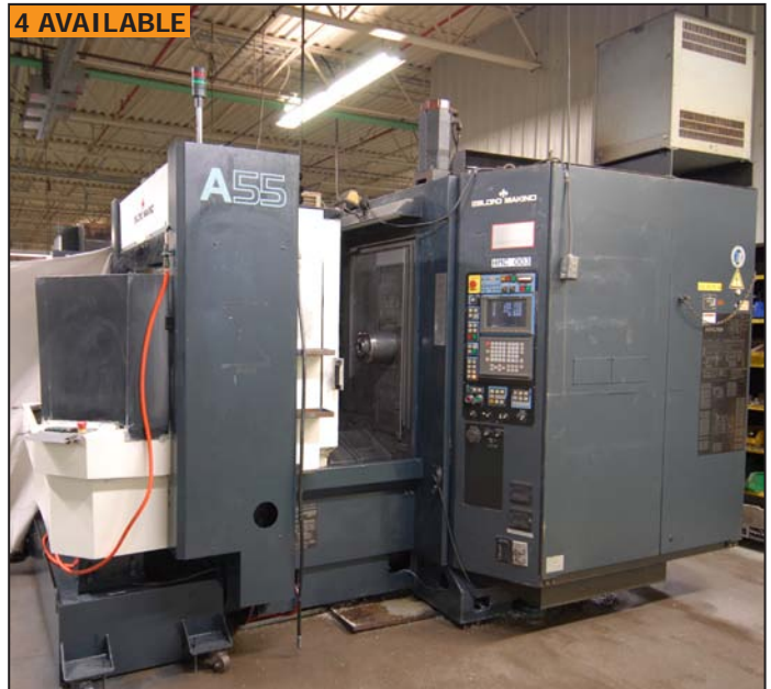
LEBLOND MAKINO A55 CNC horizontal machining center