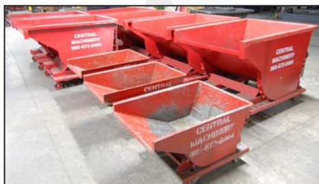
Partial view of dumping hoppers available

NEW AUCTIONS ADDED TO OUR WEBSITE REGULARLY! SUBSCRIBE TO OUR NEWSLETTER FOR UPDATES!