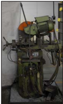
BEWO 350LT/PK/PD cold cut saw