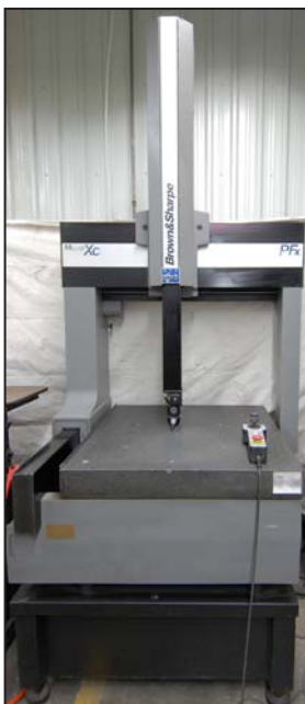
BROWN & SHARPE MICRO XCEL PFX bridge type CMM

ZEKS HEATSINK 500HSFA400 true-cycling air dryer with 26,758 hours, s/n: 309348