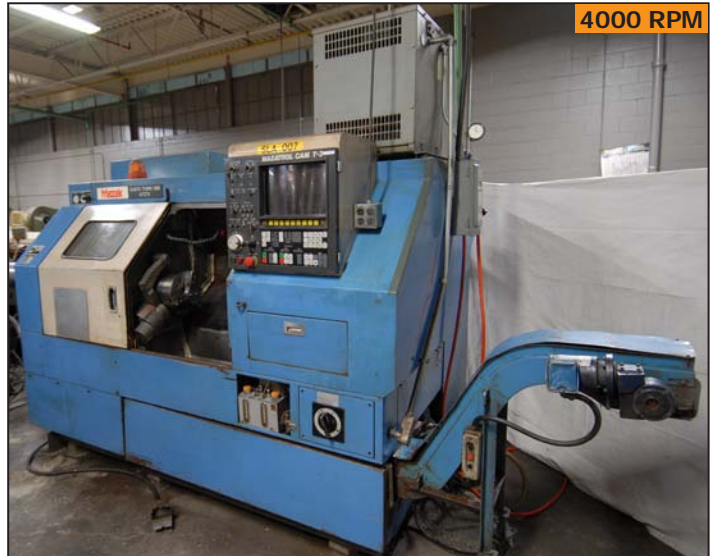
MAZAK QUICK TURN 10N CNC turning center