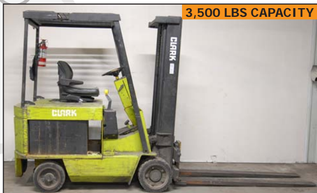
CLARK ECS17 electric forklift