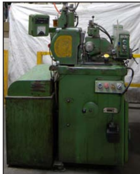
ROYAL MASTER TG12X4 hydraulic centerless grinder