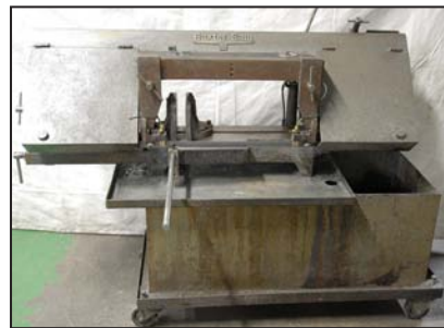
BAXTER SAW 250 metal cutting horizontal band saw