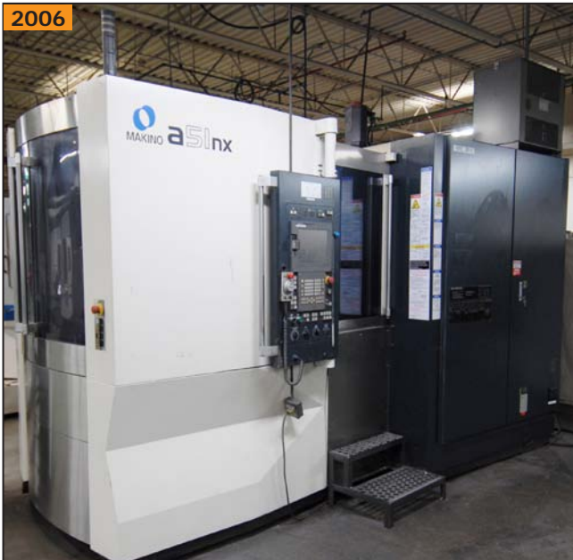
MAKINO A51 CNC horizontal machining center