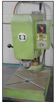
Heavy duty bench type drill press