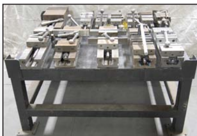
Partial view of machine vises available