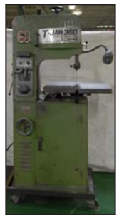
T-JAW 360 vertical band saw