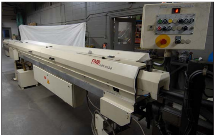
FBM MINI TURBO bar feed

FOR MORE DETAILED LISTINGS AND PHOTOS. www.corpassets.com