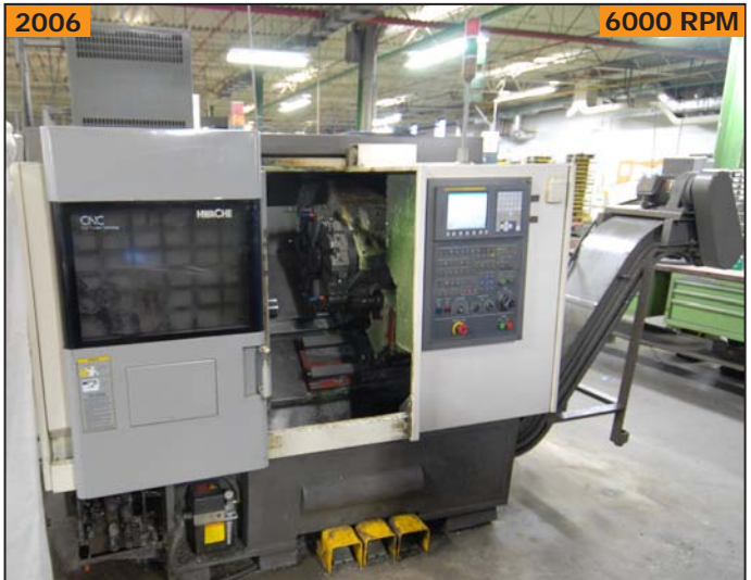
HWACHEON CUTEX-160 CNC turning center