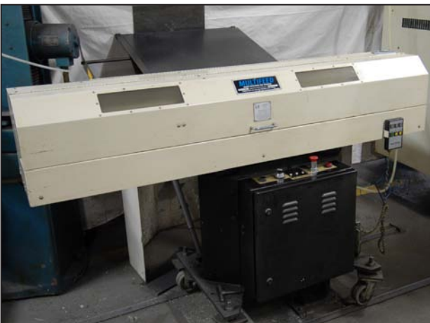
MULTIFEED MLI short magazine CNC bar feed