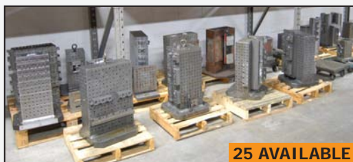
Partial view of tombstones available