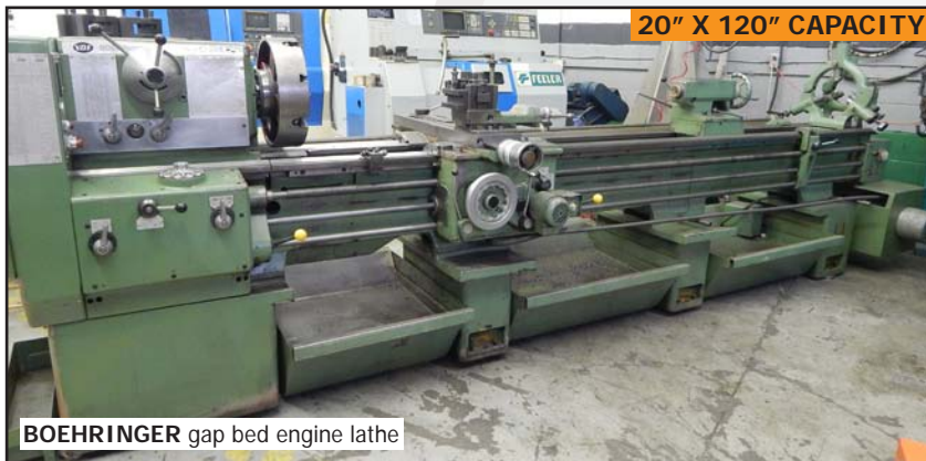
20" X 120" CAPACITY BOEHRINGER gap bed engine lathe