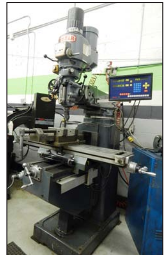
PROSTAR vertical milling machine