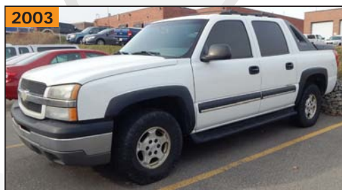
CHEVROLET AVALANCHE 4 door pick-up truck