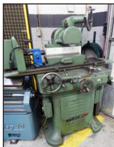
NORTON hydraulic surface grinder