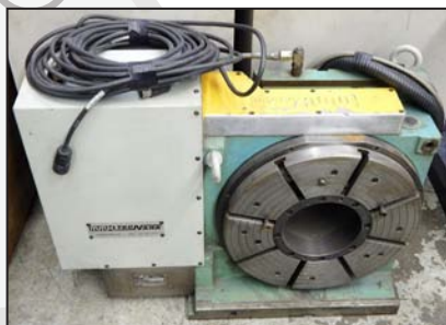
MMK 400 4th-axis with 15.75" chuck