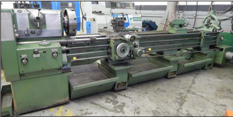
BOEHRINGER gap bed engine lathe