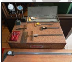
Partial view of inspection equipment available