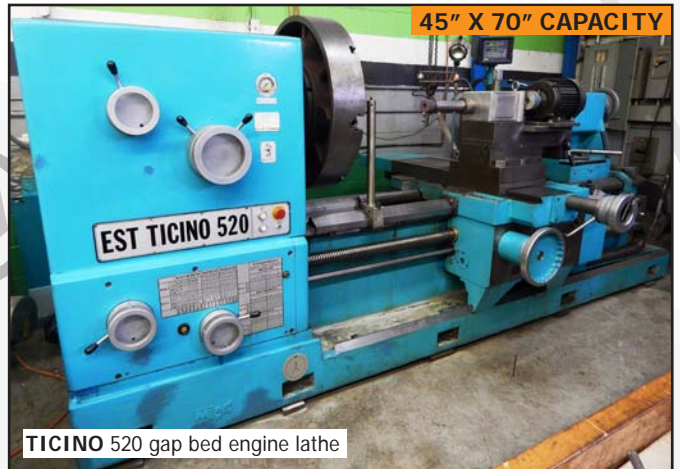
45" X 70" CAPACITY TICINO 520 gap bed engine lathe