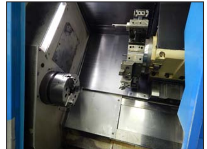
View of chuck and turret