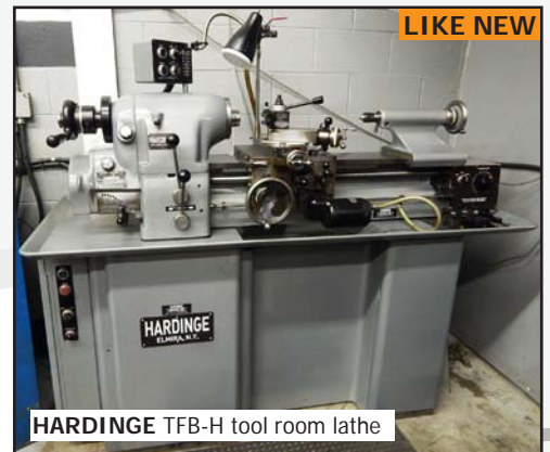
LIKE NEW HARDINGE TFB-H tool room lathe