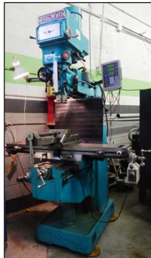
TOPWELL 5VK vertical milling machine