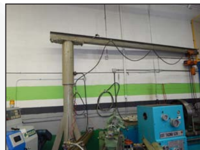
2 ton free standing jib arm with 2 ton jet electric hoist