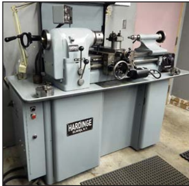
HARDINGE HLV-H tool room lathe