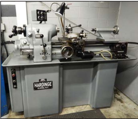
HARDINGE TFB-H tool room lathe