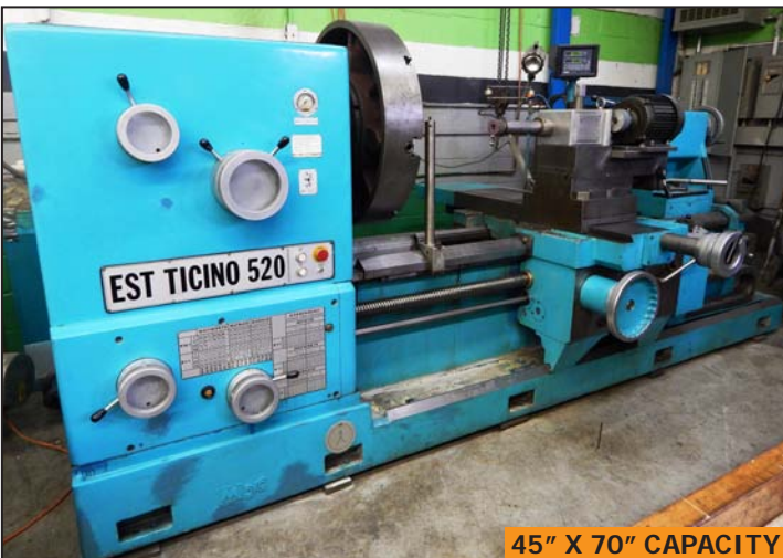
TICINO 520 gap bed engine lathe