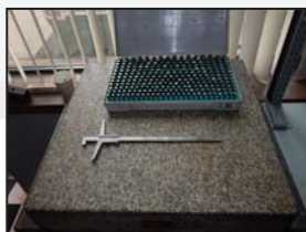
Partial view of inspection equipment available