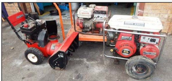
(2) HONDA gas powered generators & NOMA gas powered snow blower