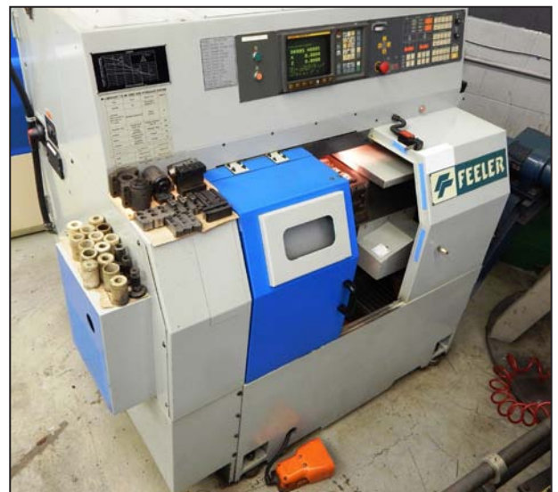
FEELER FTL-10 CNC horizontal turning center