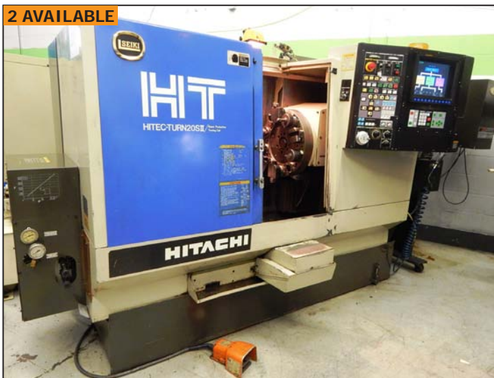
HITACHI HI-TEC TURN 20SII CNC horizontal turning center