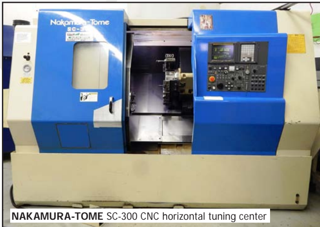
NAKAMURA-TOME SC-300 CNC horizontal turning center