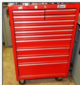
Partial view of LISTA tool cabinets available