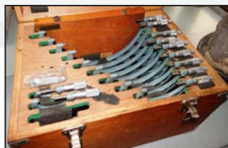
MITUTOYO outside micrometer set