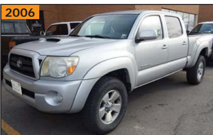
TOYOTA TACOMA 4.0 Liter 4 door pick-up truck