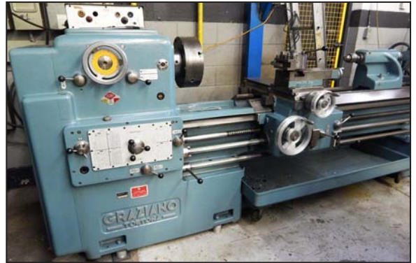
GRAZIANO TORTONA SAG20 gap bed engine lathe