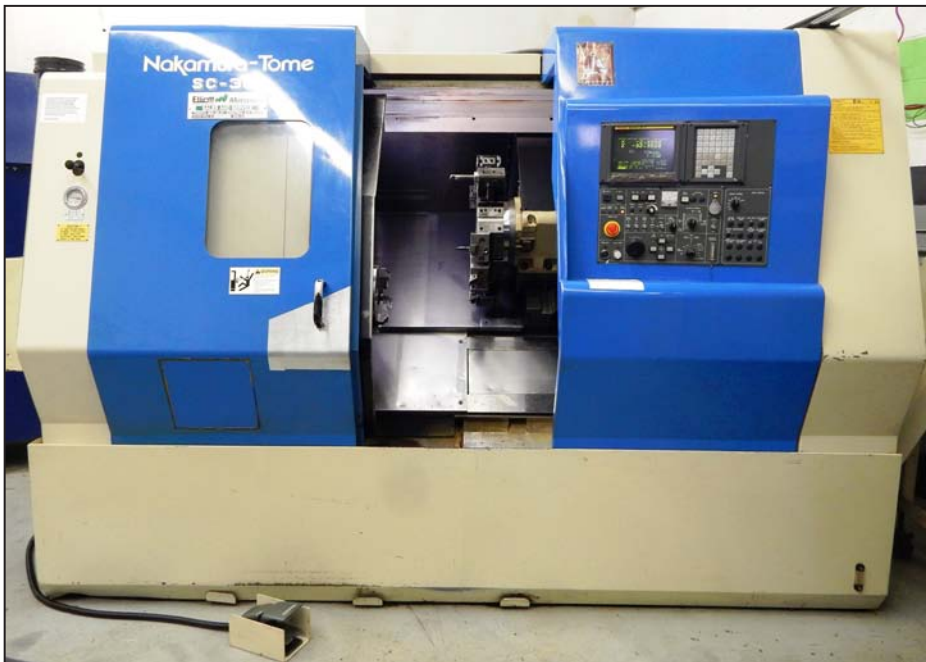
NAKAMURA-TOME SC-300 CNC horizontal turning center