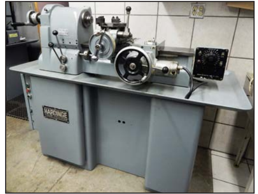
HARDINGE HTC tool room turret lathe