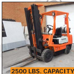
TOYOTA 62-4FGC25 outdoor forklift