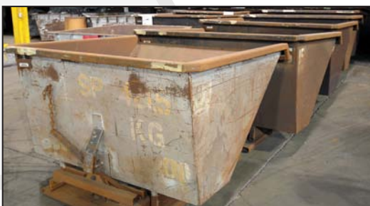
Partial view of dumping hoppers available