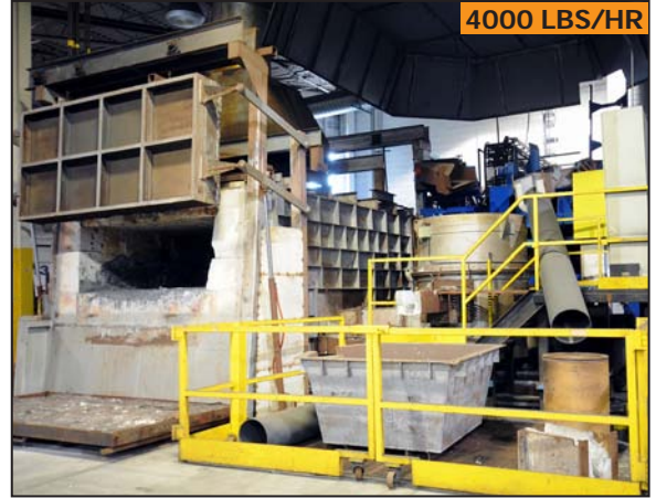
CANENG natural gas fired reverberatory melting furnace