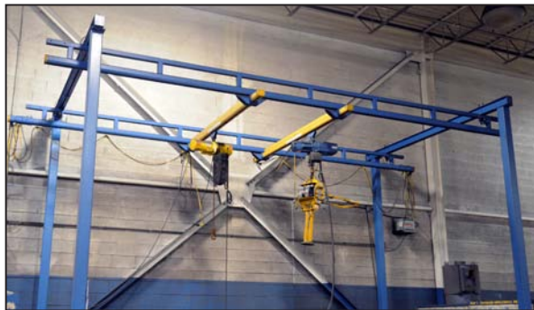
GORBEL free standing floor supported crane system