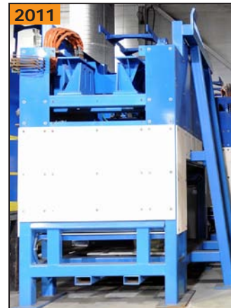
ECLIPSE conveyorized silicon particle lift & dump system