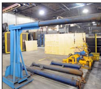
Partial view of lifting accessories available