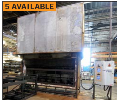
PSH FB-5000 F front loading electric kiln