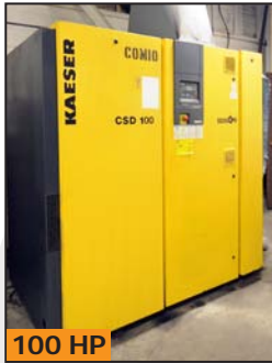
KAESER CSD 100 rotary screw air compressor