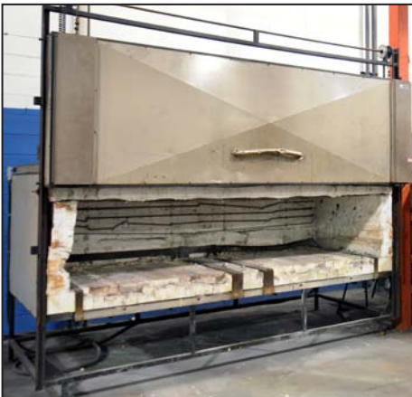
PSH K623-2416-P front loading electric kiln