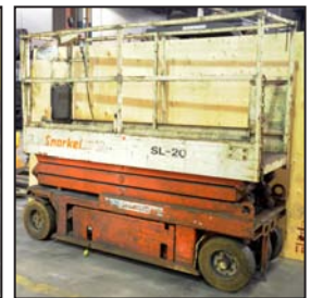
SNORKEL SL20 platform lift