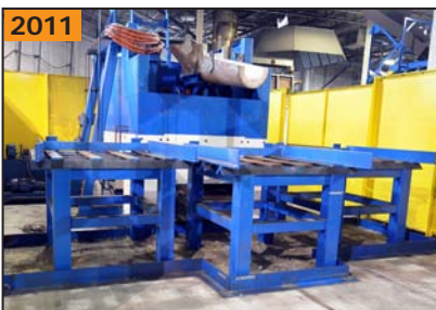
ECLIPSE automated pouring ladle