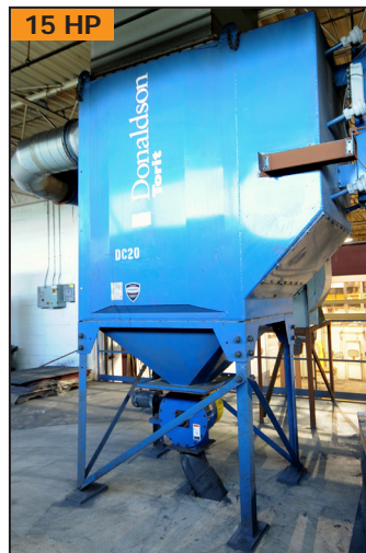
TORIT DF03-12 dust collector