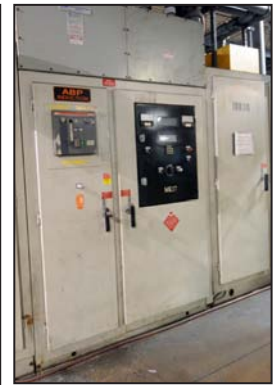
ABP MK17 coreless induction melting furnace controls