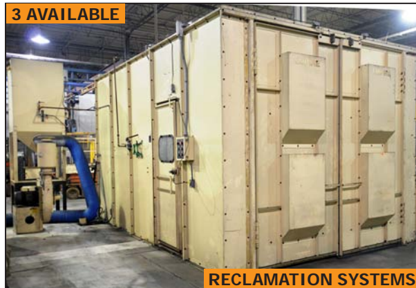
EMPIRE 18' X 11' X 10' complete shot last booth