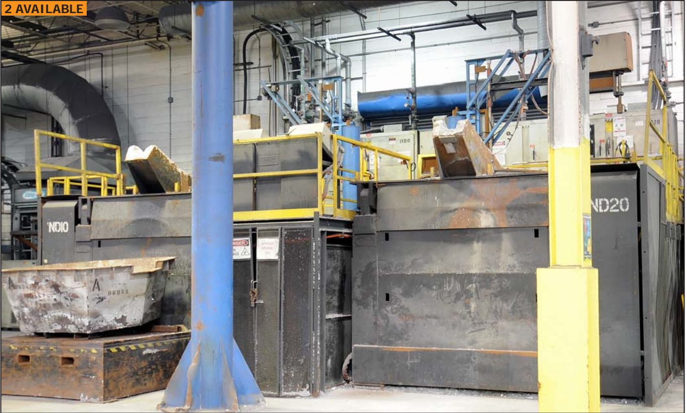
Partial view of ABP coreless induction melting furnaces