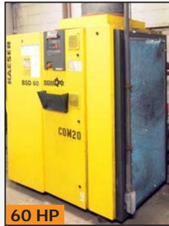
KAESER BSD 60 rotary screw air compressor