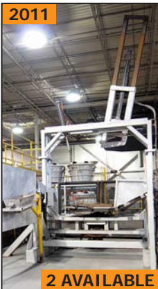
S&A INDUSTRIAL frac lathe