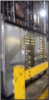
Partial view of electrical panels