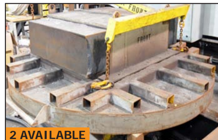
CUSTOM MFG frac heater