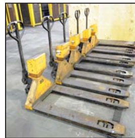
ULINE 5000 lbs pallet trucks with scales