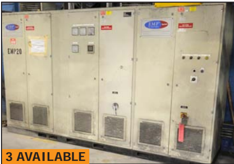
PYROTECK EMP charging & recovery system