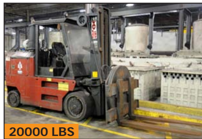
TAYLOR TC200S LPG forklift