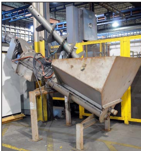
CUSTOM MFG auger transfer system w/ spare auger