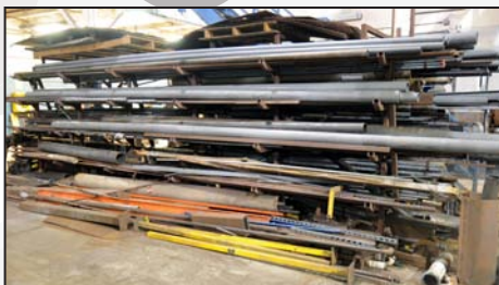
Partial view of raw material inventory available