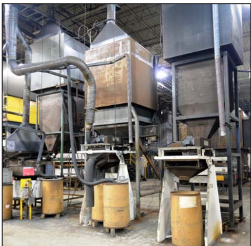
MIDWEST INDUSTRIES universal vibrating screens