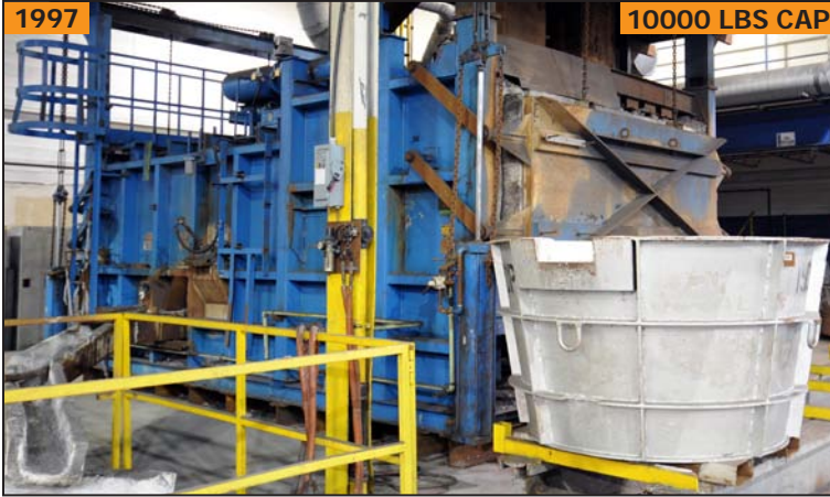
LINDBERG/MPH reverberatory melting furnace