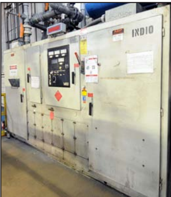
PILLAR MK8 coreless induction melting furnace controls