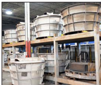
Partial view of Fracs available