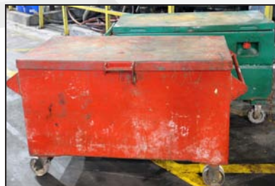
Partial view of job boxes available