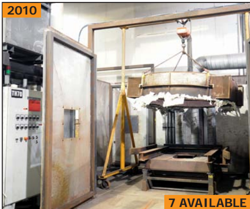
S&A INDUSTRIAL sheet mold heating system