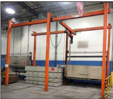
GORBEL free standing floor supported crane system