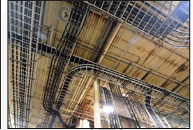
Partial view of electrical wire available