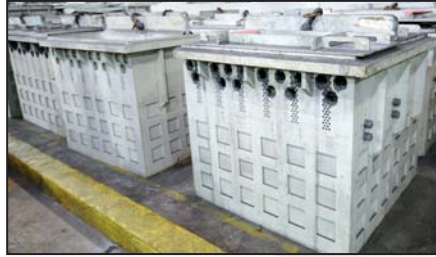
Partial view of totes for acid wash available