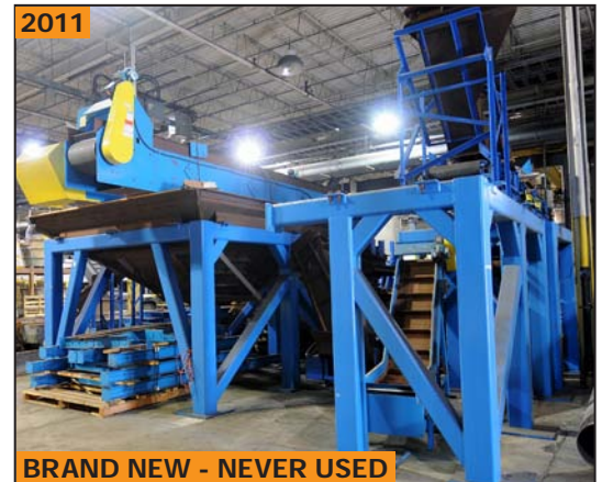
ECLIPSE conveyorized silicon particle lift & dump system