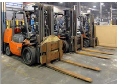
Partial view of forklifts available