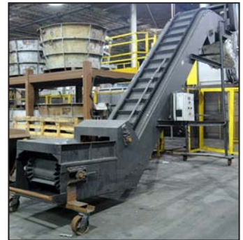
Heavy duty incline conveyor