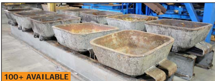
Partial view of Sows available