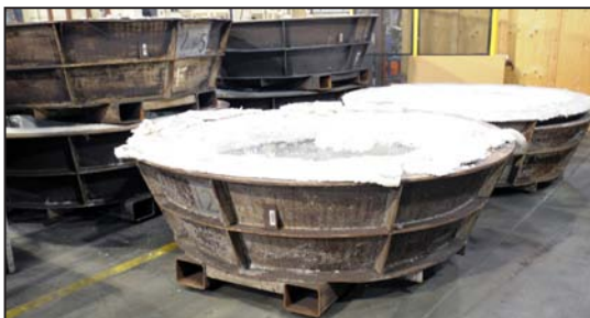
Partial view of sheet molds available