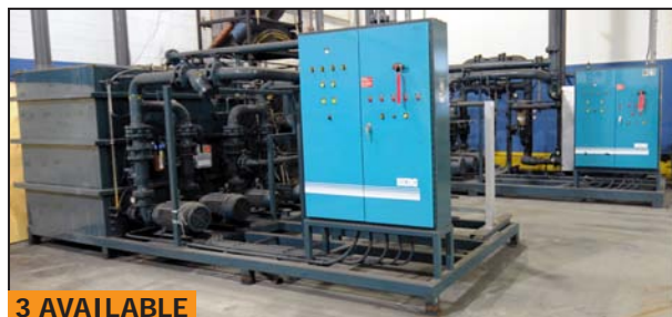
Partial view of BERG chillers available