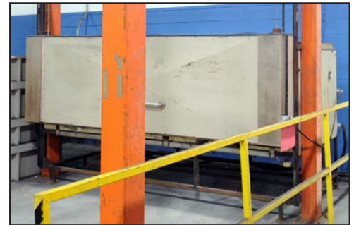
PSH FB-1900F front loading electric kiln