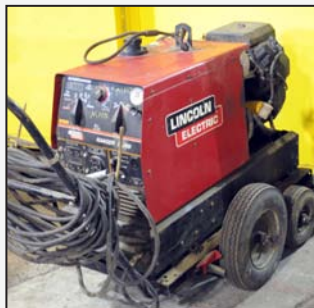
LINCOLN RANGER 10000 engine driven welder