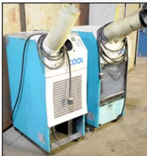
MOVINCOOL CLASSIC PLUS 26 portable air conditioners