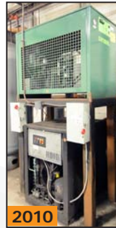
Refrigerated air dryers