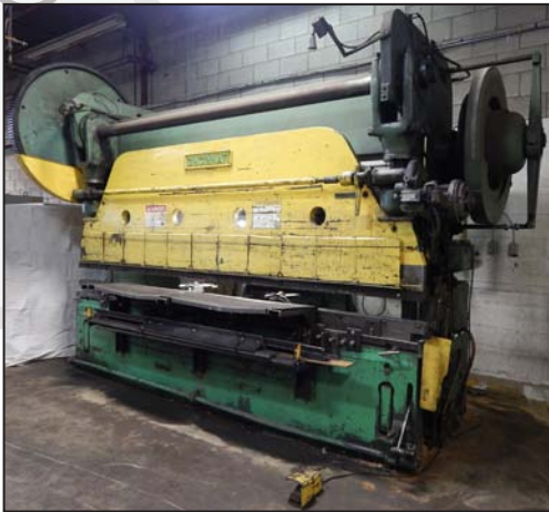
CINCINNATI mechanical press brake