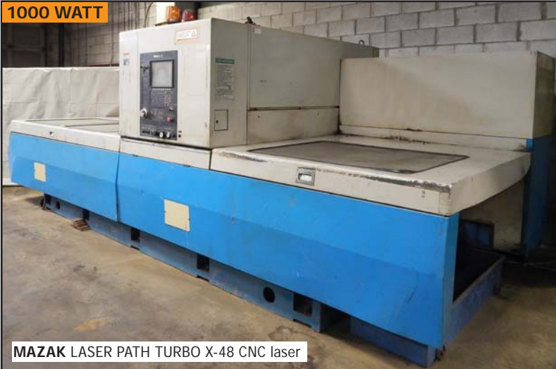
MAZAK LASER PATH TURBO X-48 CNC laser