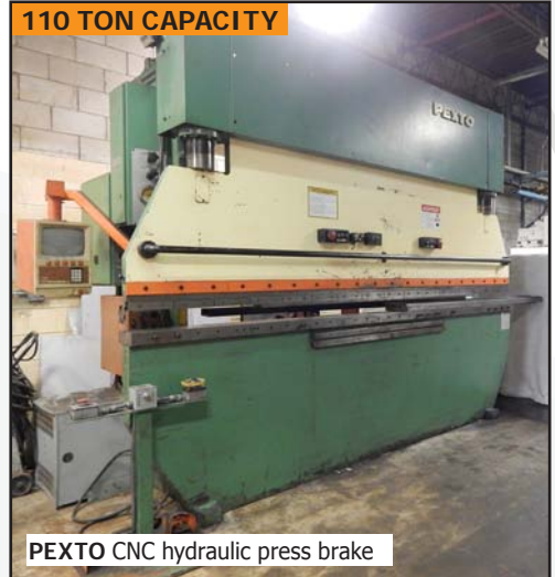
PEXTO CNC hydraulic press brake