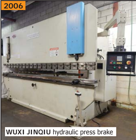
WUXI JINQIU hydraulic press brake