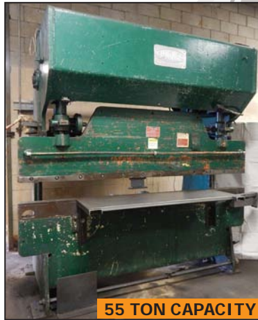
DREIS AND KRUMP 68-B hydraulic press brake