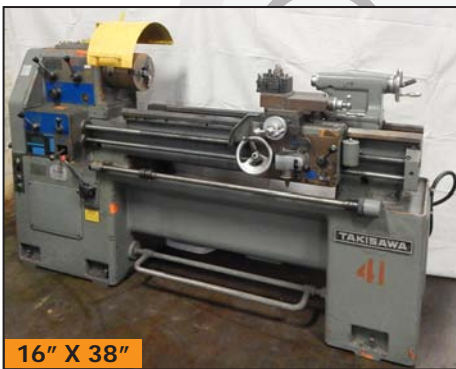
16" X 38" TAKISAWA TSL-1000D lathe