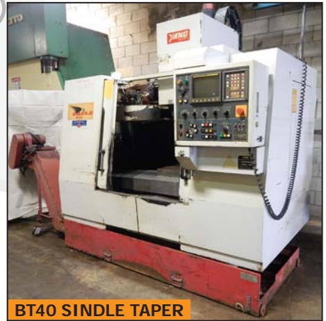
BT40 SINDLE TAPER YANG EAGLE 600 CNC vertical machining center