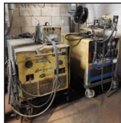
Partial view of welders available