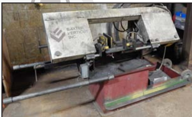
BAXTER VERTICUT 180 horizontal band saw