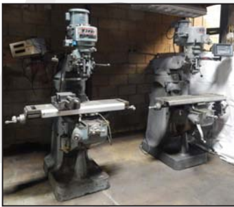
Partial view of milling machines available