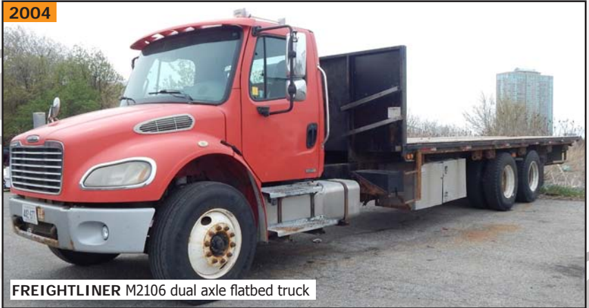
FREIGHTLINER M2106 dual axle flatbed truck