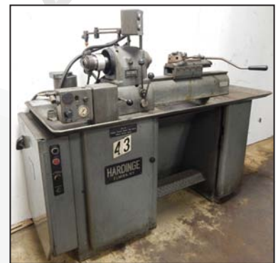
HARDINGE DU-59 turret lathe