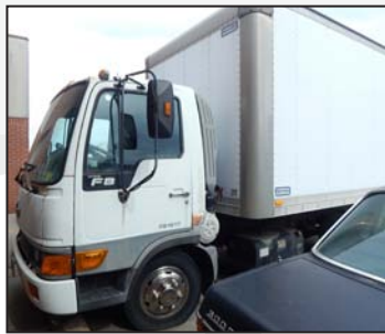
HINO FB1817 cab over cube van