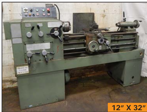
12" X 32" TUM 25-B lathe