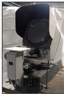
MITUTOYO 12" optical comparator