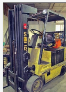
HYSTER 3500lb forklift