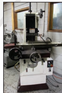
CHEVALIER FSG-618 surface grinder