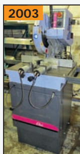
MEP COBRA-350 cold cut saw