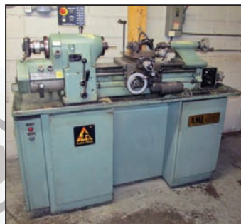
ALEX-TECH tool room lathe