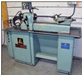
ALEX-TECH tool room lathe