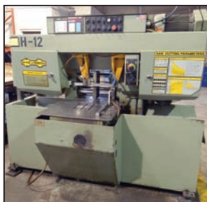
HYD-MECH H-12 automatic hydraulic horizontal saw