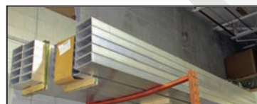
Partial view of raw material available