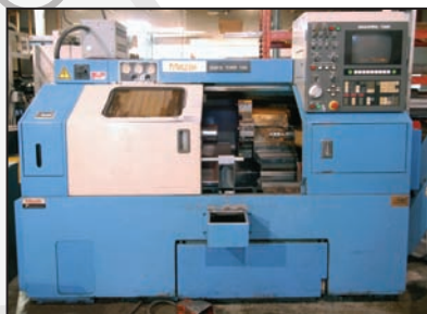
MAZAK QUICK TURN 18N CNC turning center