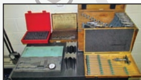
Partial view of tooling available