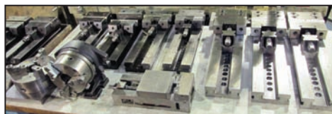
Partial view of precision accessories available