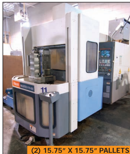
(2) 15.75" X 15.75" PALLETS