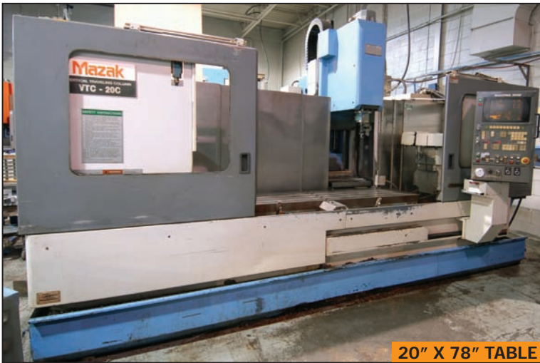
20" X 78" TABLE