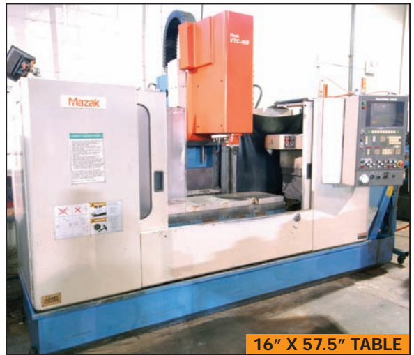
16" X 57.5" TABLE