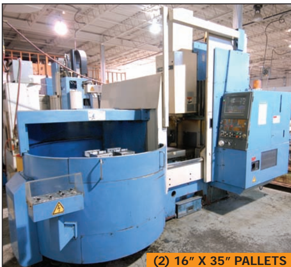
(2) 16" X 35" PALLETS