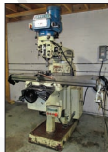
DARBERT KL vertical milling machine