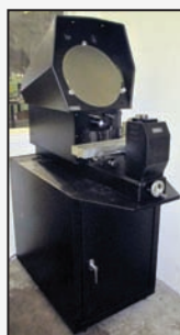
FOWLER optical comparator