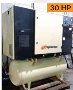
INGERSOLL-RAND 30 HP air compressor