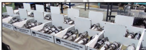
Partial view of tooling available