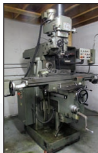
FIRST LC-20VHS milling machine