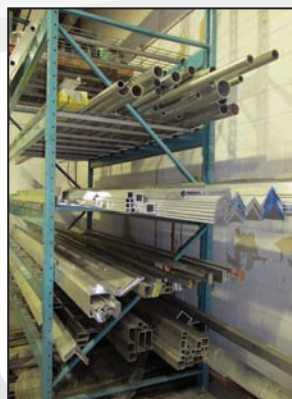
Partial view of raw material