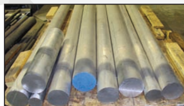
Partial view of raw material available