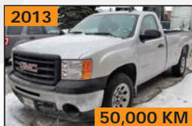
2013 GMC SIERRA 1500 pick-up truck

Tel: (416) 962-9600 • Fax: (416) 962-9601 info@corpassets.com www.corpassets.com