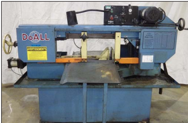
DOALL C-916 horizontal band saw