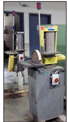
Partial view of sanders available