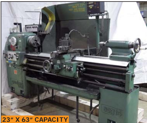
23" X 63" CAPACITY