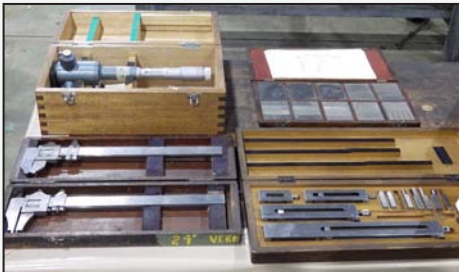
Partial view of inspection equipment available