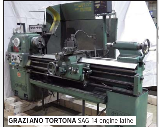
GRAZIANO TORTONA SAG 14 engine lathe