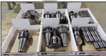
Partial view of machine tools available