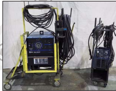
Partial view of MILLER welders available