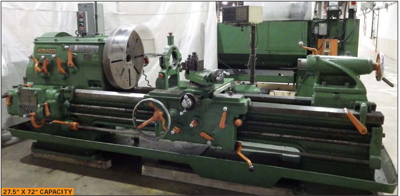
27.5" X 72" CAPACITY