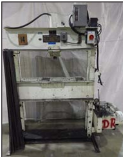
ROGERS S60-13-2 hydraulic shop press