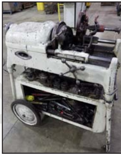
RIDGID portable threader