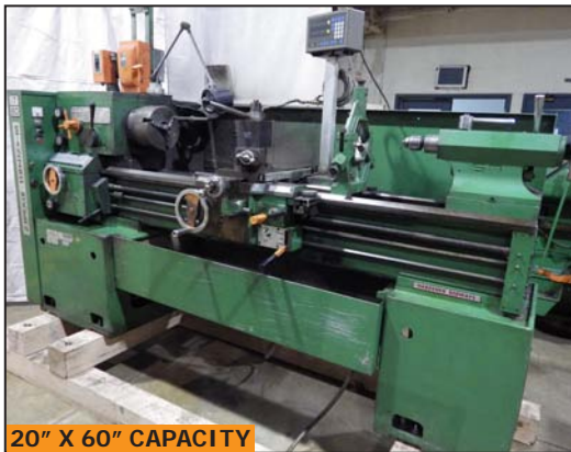
20" X 60" CAPACITY