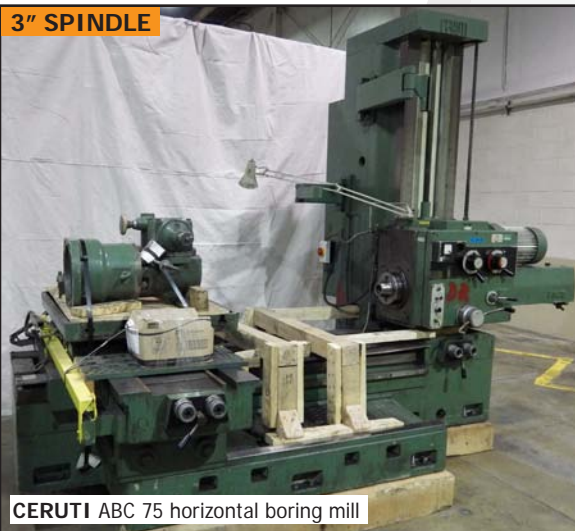
CERUTI ABC 75 horizontal boring mill