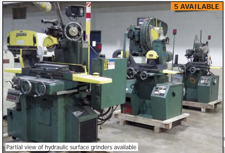
Partial view of hydraulic surface grinders available