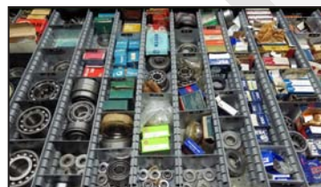
Partial view of perishable tooling available