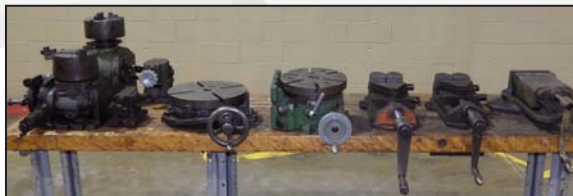
Partial view of machine tools & accessories available