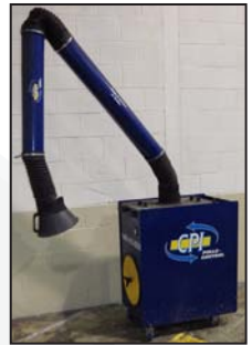
CPI POLLU-CONTROL portable fume extractor