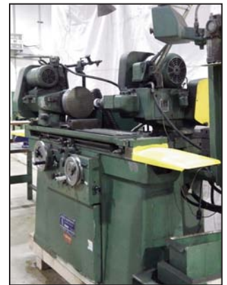
JONES & SHIPMAN 1302 I.D. grinder