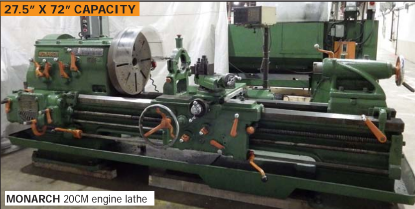
MONARCH 20CM engine lathe