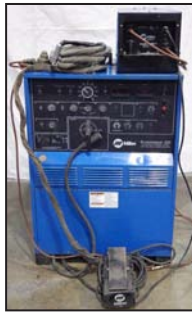
MILLER 350 TIG welder