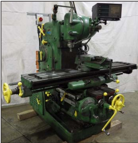
MILWAUKEE NO. 3 universal milling machine