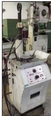
ELECTRO ARC 2S metal disintegrator