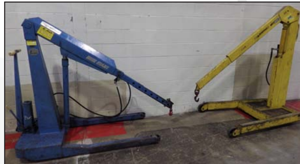
View of hydraulic engine hoists available