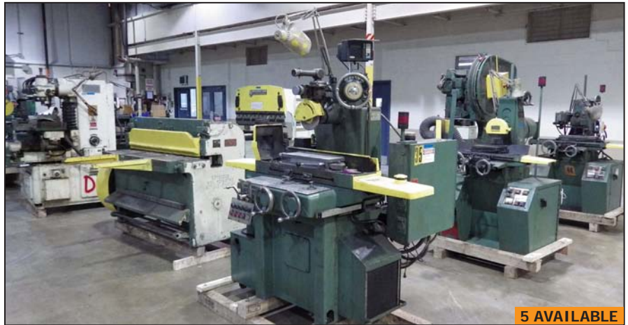
View of hydraulic surface grinders available