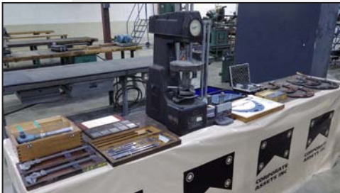
Partial view of inspection equipment available