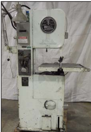
DOALL METALMASTER ML vertical band saw