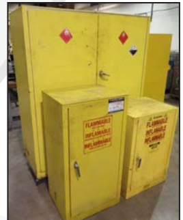
Partial view of fire proof cabinets available