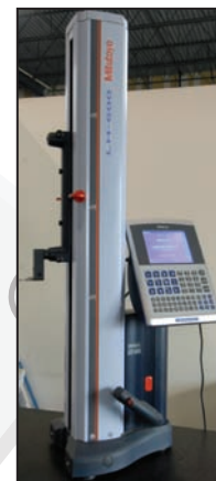
MITUTOYO digital height gauge