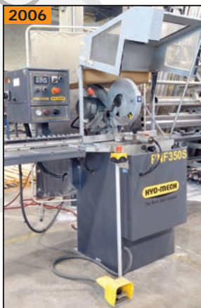
HYD-MECH PNF350S high speed automatic cold cut saw