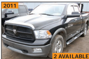
DODGE RAM 1500 SLT PICKUP TRUCK