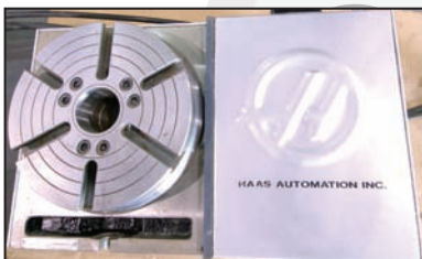
HAAS HRT 210 P1 CNC 10" 4th axis rotary table