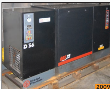
CHICAGO PNEUMATIC QRS25 , 25 HP rotary screw air compressor/dryer combination