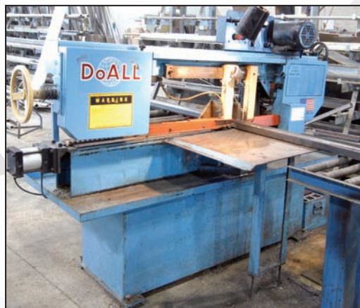
DOALL C916S horizontal band saw