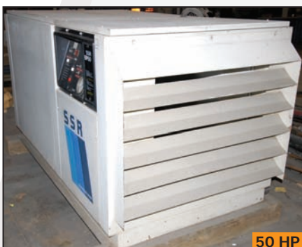
INGERSOLL RAND SSR EP50 rotary screw air compressor