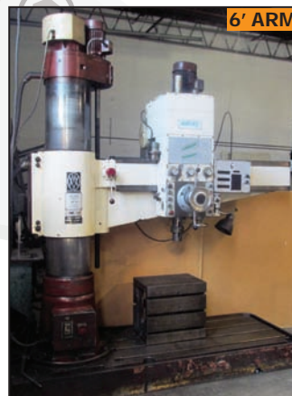
CSEPEL HFR-50 radial arm drill