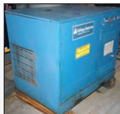
KELLOG AMERICAN KPS50 Piston type air compressor rotary screw air compressor