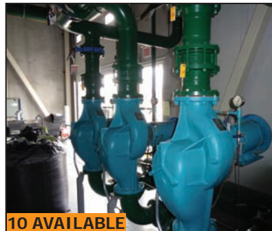
Partial view of FRICK compressors