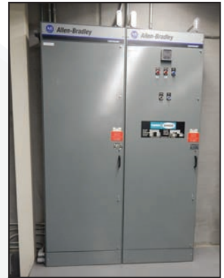
Partial view of switch gear available