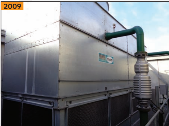
TOROMONT CIMCO cooling tower