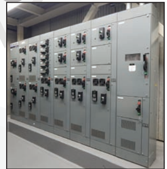
Partial view of switch gear available