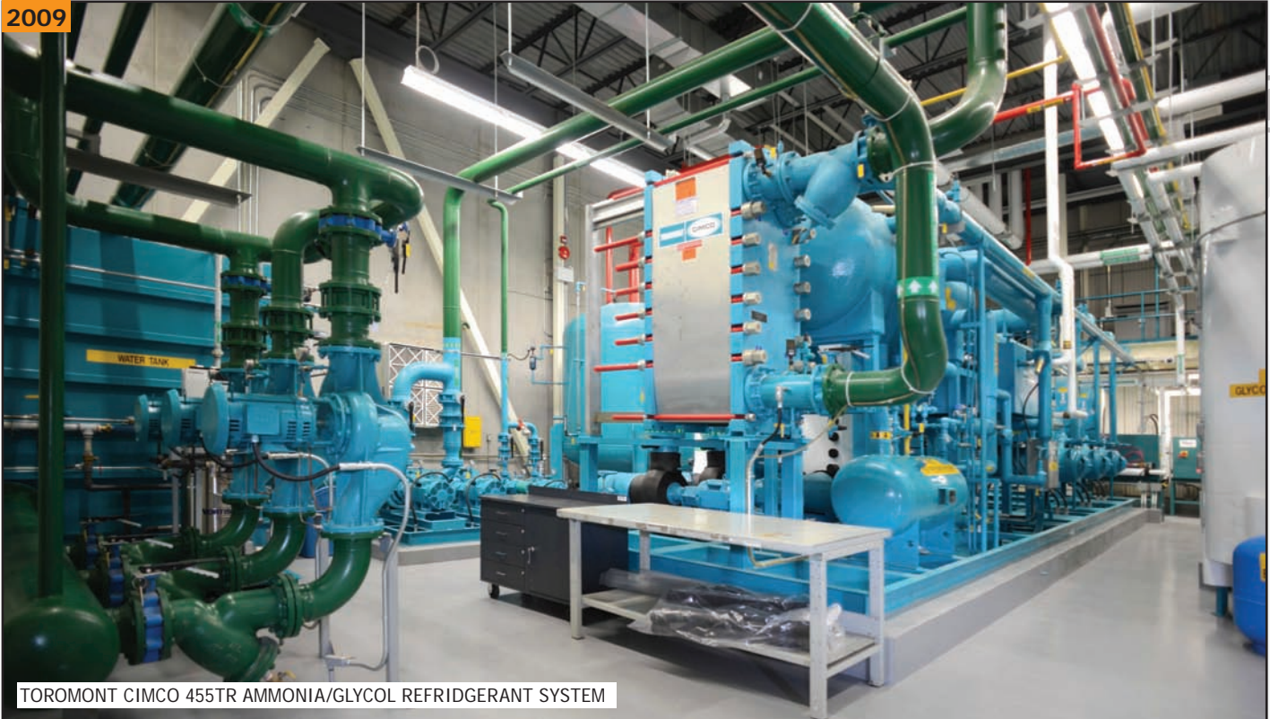
TOROMONT CIMCO 455TR AMMONIA/GLYCOL REFRIDGERANT SYSTEM

TOROMONT/CIMCO AMMONIA COOLED GLYCOL PLANT CONSISTING OF: (1) CUSTOM PACKAGED 406TR A/C REFRIGERATION SYSTEM AND (1) CUSTOM PACKAGED 17TRX2 COOLER REFRIGERATION SYSTEM. BOTH SYSTEMS ARE MOUNTED ON STRUCTURAL STEEL SKIDS, AND CAN BE EASILY DISASSEMBLED FOR EASE OF SHIPPING AND RE-INSTALLATION. SYSTEMS CONSIST OF COMPRESSORS, COOLING TOWER & CHILLERS, SURGE DRUMS, CONDENSERS, HEAT EXCHANGERS, SKIDDED PUMP SYSTEMS, ELIMINATORS, WATER DISTRIBUTION SYSTEMS, AIR HANDLING FANS, DAMPERS, MOISTURE ELIMINATORS, DILUTION TANKS & MORE!