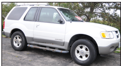
FORD EXPLORER 2dr SUV

HURCO BMC20 CNC vertical machining center with HURCO ULTIMAX II CNC control, 33.7" x 15.7" t-slot table, travels: X-22", Y-14", Z-14", 18" maximum distance spindle nose to table top, 6000 RPM, CAT 40 taper, 16 ATC, 5/7.5 HP, chip tray, coolant, s/n BJ8007119A