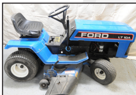
FORD LT10-A lawn tractor