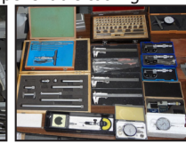
Partial view of inspection equipment