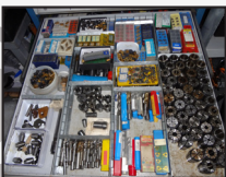
Partial view of perishable tooling