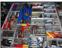
Partial view of perishable tooling