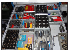
Partial view of perishable tooling

GENERAL floor type drill press, s/n 34-1389