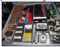
Partial view of perishable tooling