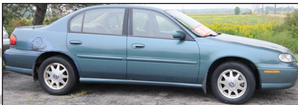
CHEVROLET MALIBU 4dr sedan