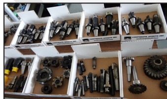
Partial view of tool holders available