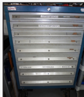
LISTA tool cabinet Partial view of tool cabinets available