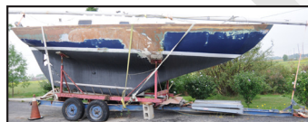
DOM 75 , fiberglass sail boat

Corporate Assets Inc. assumes no liability for errors or omissions in this brochure. Corporate Assets Inc. expressly reserves the right to determine the manner of conducting the auction as it may deem appropriate. All subject to prior sale.