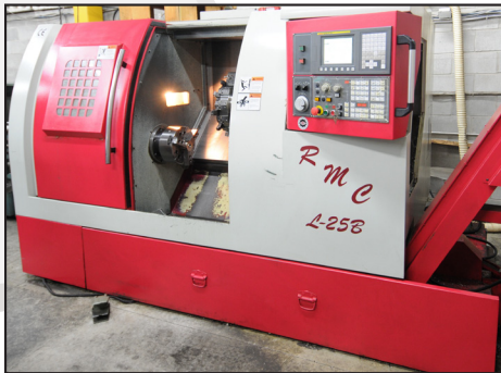
RACER RMC L-25B CNC turning center