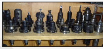
Partial view of CAT 40 tool holders available