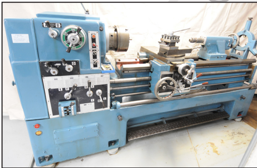
TA SHING G-1500 gap bed engine lathe