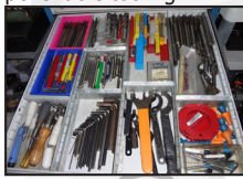
Partial view of perishable tooling