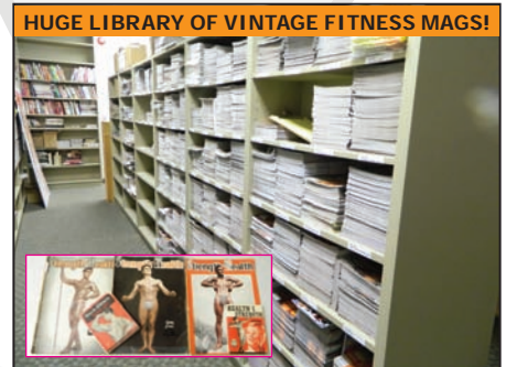
HUGE LIBRARY OF VINTAGE FITNESS MAGS!