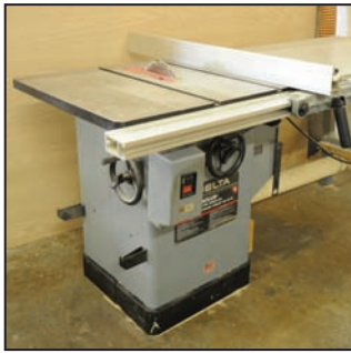
DELTA UNISAW 10" tilting arbor table saw