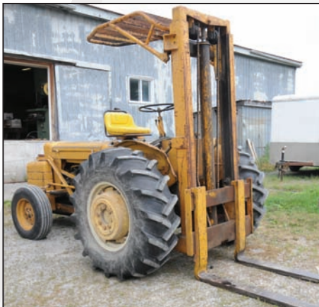
MASSEY FERGUSON MF204 tractor