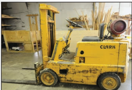
CLARK C40B 4000 lbs. LPG forklift