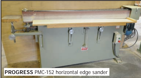
PROGRESS PMC-152 horizontal edge sander