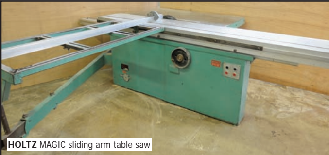
HOLTZ MAGIC sliding arm table saw