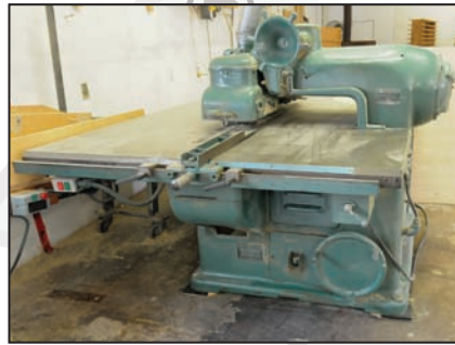
MATTISON 202 14" straight line rip saw