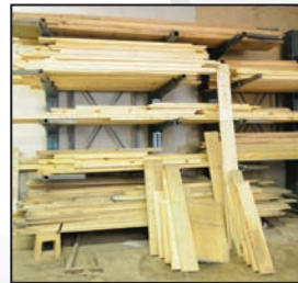
Partial view of wood inventory available