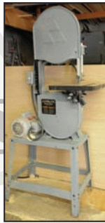
DELTA vertical band saw