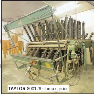
TAYLOR 800128 clamp carrier