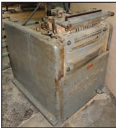
WYSONG & MILES spindle auto. dovetailer