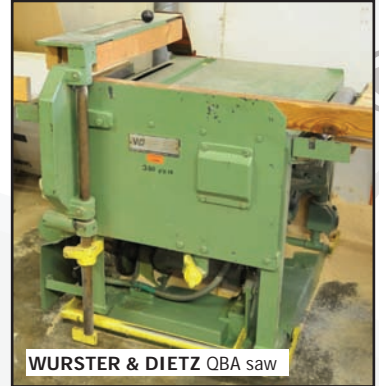
WURSTER & DIETZ QBA saw