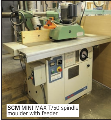
SCM MINI MAX T/50 spindle moulder with feeder