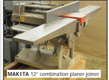
MAKITA 12" combination planer-joiner