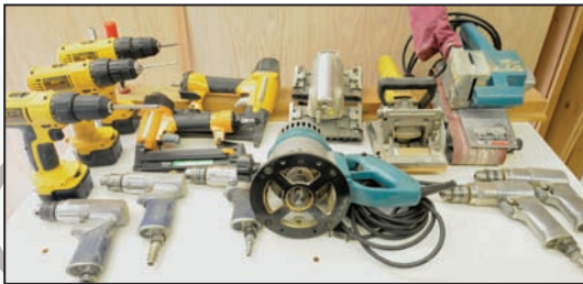
Partial view of power tools available