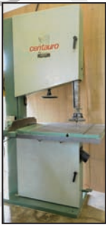
CENTAURO vertical band saw