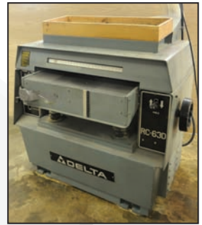
DELTA RC-63D 24" planer