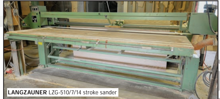
LANGZAUNER LZG-510/7/14 stroke sander