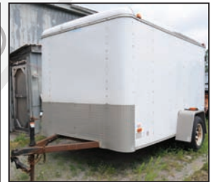
HUALMARK 10' box trailer