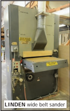
LINDEN wide belt sander