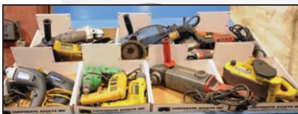
Partial view of power tools available