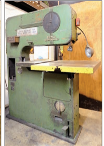
DOALL V36 vertical band saw