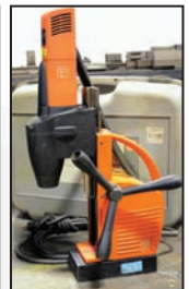
Mag base drill