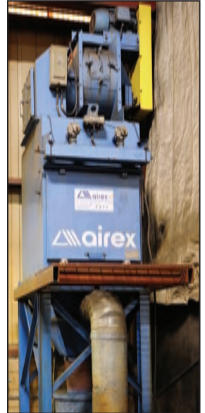
AIREX DCC-685 dust collector