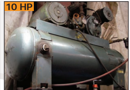
INGERSOLL RAND 10 HP air compressor