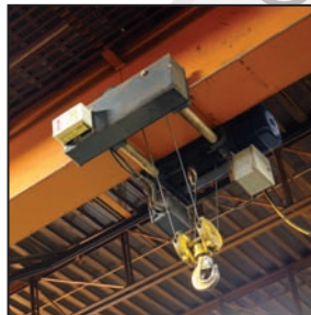
DEMAG 6000 lbs electric hoist