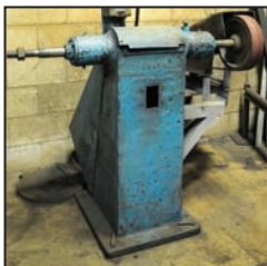
CH&VW #12 double end polishing machine