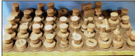
Partial view of punches & dies available