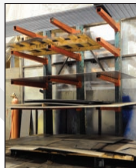
Partial view of inventory available