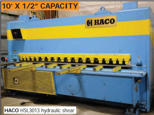
HACO HSL3013 hydraulic shear