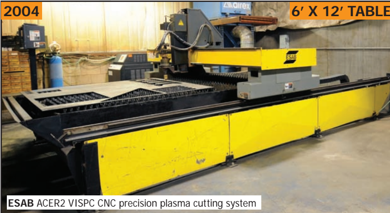
ESAB ACER2 VISPC CNC precision plasma cutting system