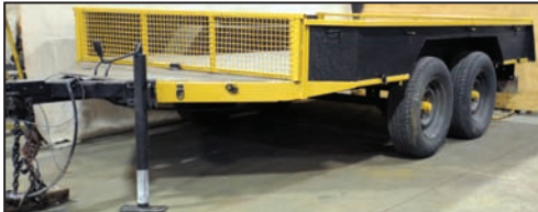
ALLTYPE 10' X 6.5' tandem axle trailer