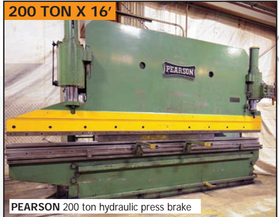
PEARSON 200 ton hydraulic press brake