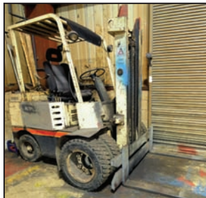
ALLIS CHALMERS 4000 lbs LPG forklift