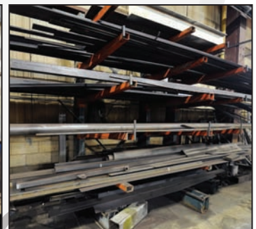
Partial view of inventory available