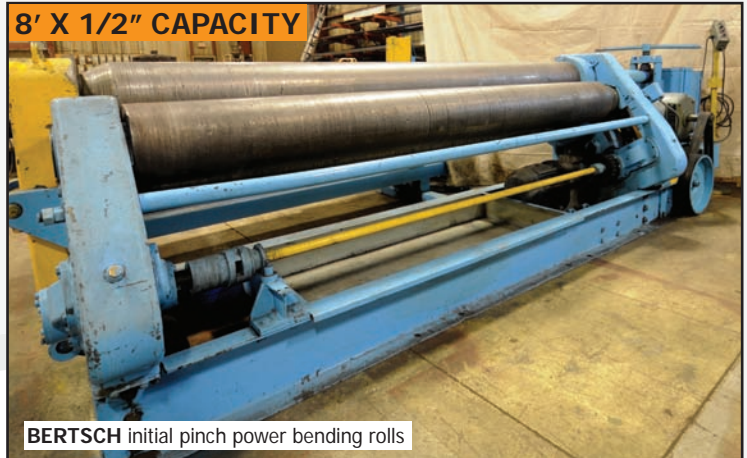
BERTSCH initial pinch power bending rolls

LATE MODEL CNC PLASMA & PLATE FABRICATING FACILITY ALL MACHINERY & EQUIPMENT ARE VERY WELL MAINTAINED