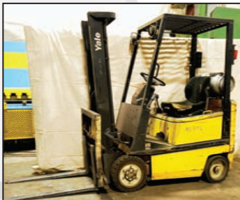
YALE 3000 lbs. LPG forklift