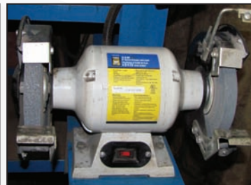
View of bench grinder