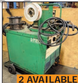
L-TECH VI-252 MIG welder