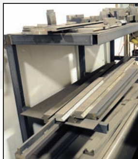
View of press brake dies