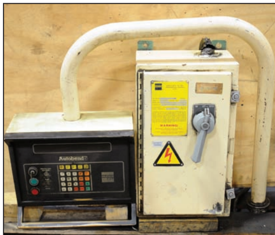
HURCO AUTOBEND 5 programmable back gauge