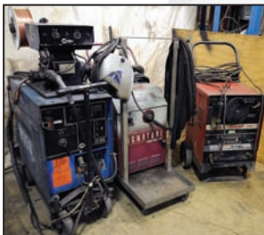
Partial view of welders available