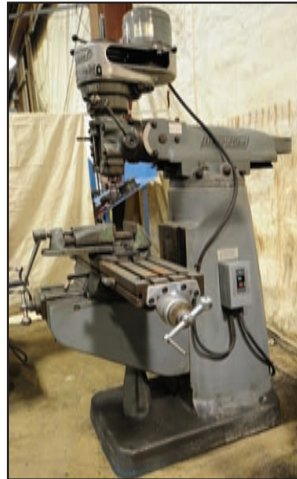
BRIDGEPORT vertical milling machine