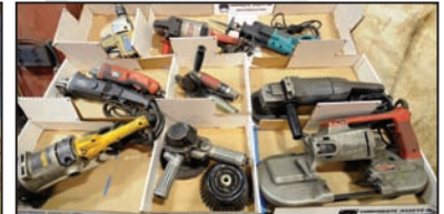
Partial view of power tools available