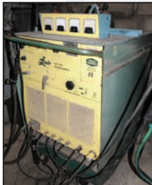
LINDE UCC 305 TIG & stick welder