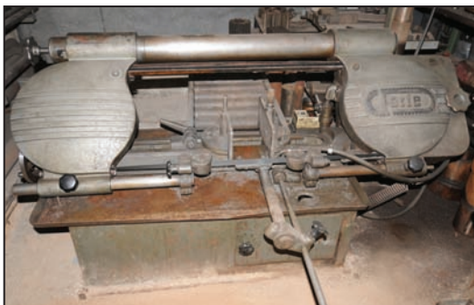
FORTE 12" horizontal band saw