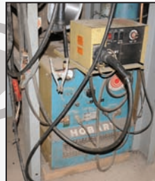
HOBART FC 500 MIG welder