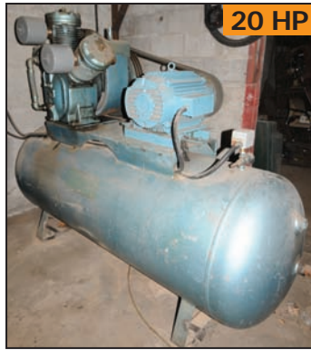
INGERSOLL RAND 15TE air compressor