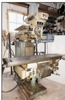
TOS FNK25 vertical milling machine