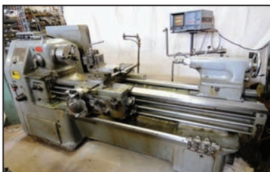
OKUMA LS engine lathe