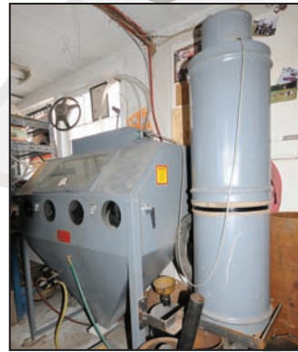
TRINCO 4876P shot blast cabinet