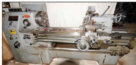
OKUMA LS engine lathe