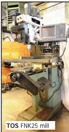
TOS FNK25 mill