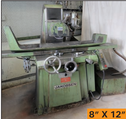
8" X 12"