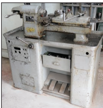
LEINEN second opp lathe