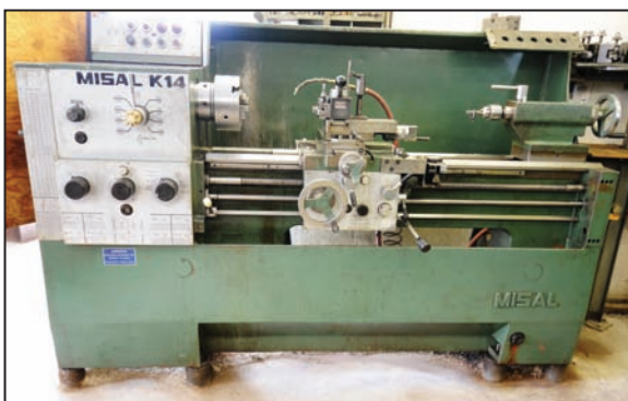
MISAL K14 gap bed engine lathe