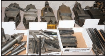
Partial view of tooling available