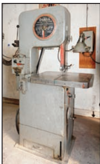
DOALL 1612-U vertical band saw