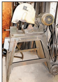
EMERSON 16" abrasive cut off saw

PLEASE VISIT OUR WEBSITE FOR A MORE DETAILED LISTING.