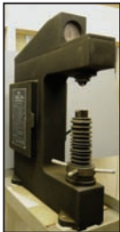
FIE #R hardness tester