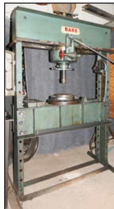
DAKE 75H hydraulic shop press