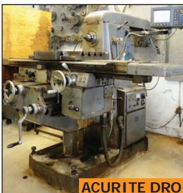
TOS horizontal milling machine

LEINEN second opp lathe with 7/8" bar cap, speeds to 3480 RPM, collet chuck s/n n/a