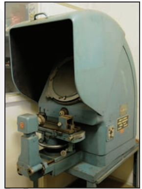
JONES & LAMSON BC-14 optical comparator