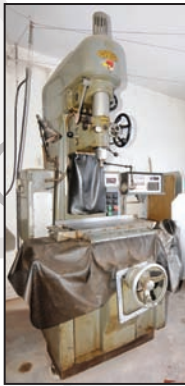
MOORE #3 jig borer