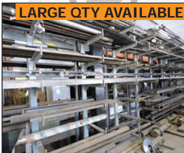
Partial view of steel inventory available