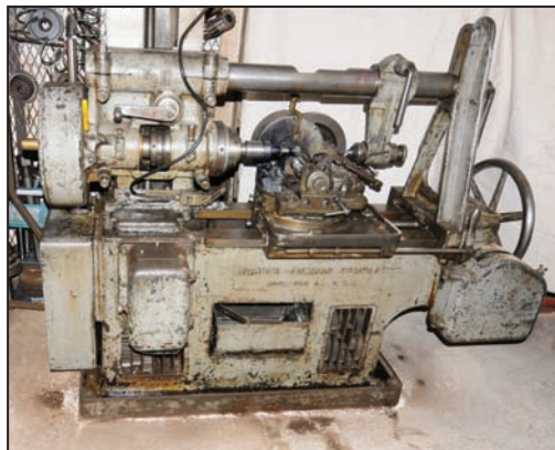
BARBER COLEMAN 12 gear hobber