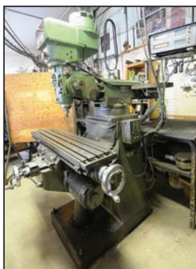
EXCELLO 602 vertical milling machine