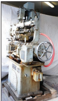
BARBER COLEMAN 6-10 gear hobber

EMERSON 16" abrasive cut off saw s/n n/a