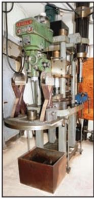
A&B combo press & milling machine