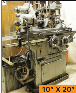
10" X 20"