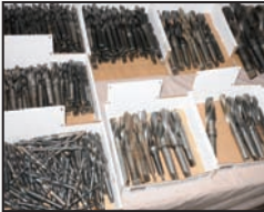
Partial view of tooling available