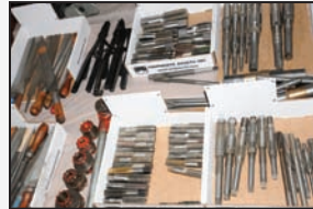
Partial view of tooling available