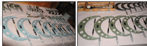
Partial view of inspection equipment available