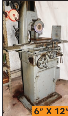
6" X 12"