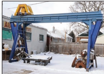
Outdoor gantry system