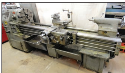
OKUMA LS engine lathe