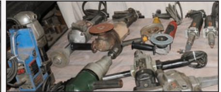
Partial view of power tools available