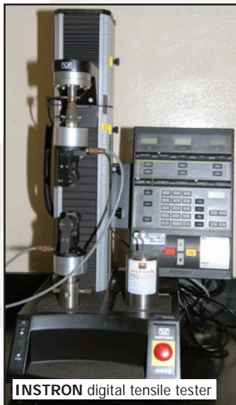
INSTRON digital tensile tester