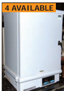
FISHER SCIENTIFIC 2 cu/ft digital lab oven