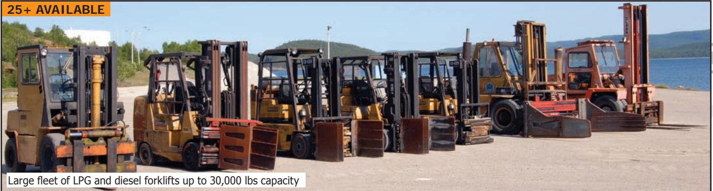
Large fleet of LPG and diesel forklifts up to 30,000 lbs capacity