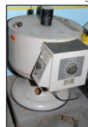
IEC MODEL K floor type lab centrifuge