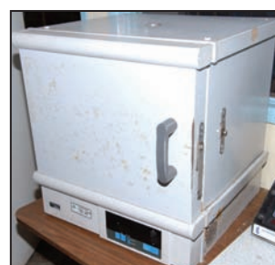
FISHER SCIENTIFIC 1 cu/ft digital ISOTEMP lab oven