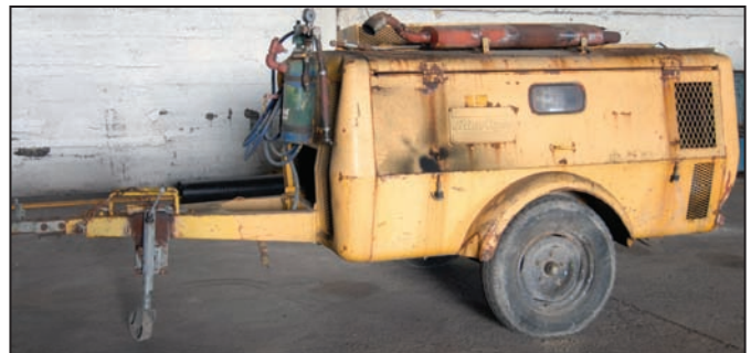
ATLAS COPCO ST 35 DD portable DIESEL air compressor