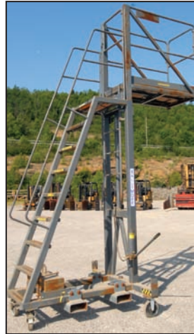
BALLYMORE TT9-13 portable hydraulic lift