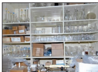
Partial view of glassware available