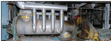
INGERSOLL RAND mixer