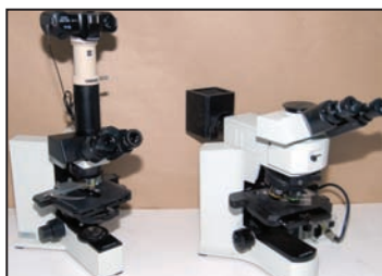
NIKON digital microscopes