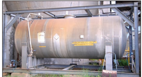
Partial view of storage tanks available

CONTACT 416.962.9600 TO CONSIGN EQUIPMENT AT AN UPCOMING AUCTION