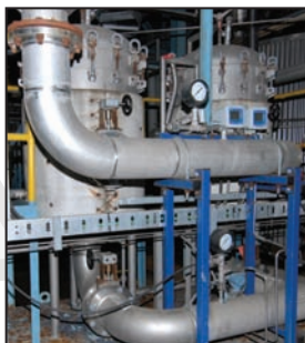
View of GLEGG 264MS03 stainless steel pre-filters