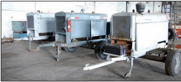
View of LINCOLN electric gas powered welder/generators