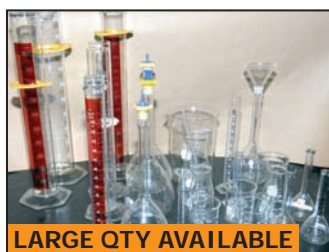
Partial view of glassware available