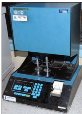
TECHNIDYNE digital ISO brightness tester