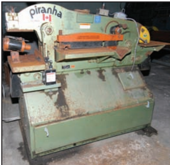
PIRANHA 70 ton hydraulic iron worker