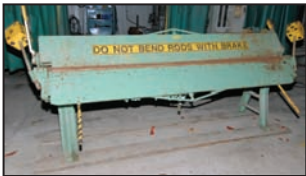
BROWN BOGGS 10'X16GA manual brake