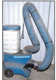
NEDERMAN portable fume extractor