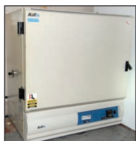
BLUE M SCP SCIENCE digital lab oven