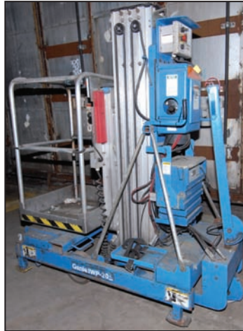
GENIE IWP-20S SUPERSERIES portable hydraulic lift