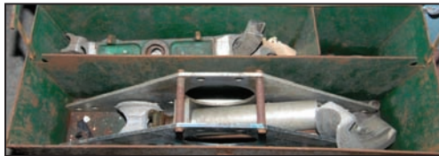
GREENLEE hydraulic bender