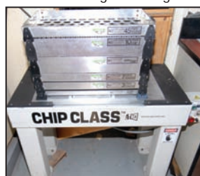
TMI CHIPCLASS chip classification tester