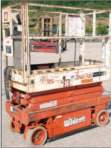
SNORKEL WILDCAT SL15 electric scissor lift