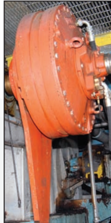
Retrofit brown stock washer hydraulic drive