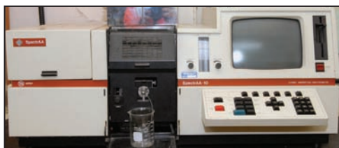
VARIAN SPECTRA AA-10 digital atomic absorption spectrometer