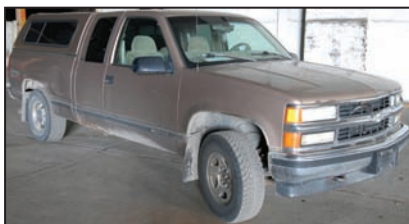
CHEVROLET 1500 271 pickup truck