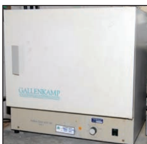
GALLENKAMP SIZE 1 lab oven