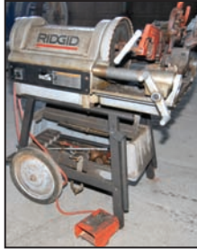
RIDGID 1224 pipe threader