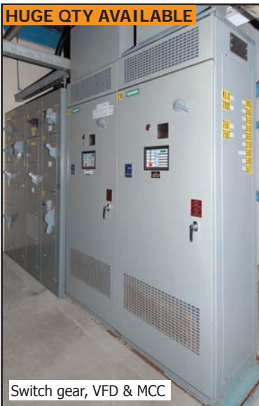
Switch gear, VFD & MCC