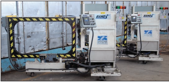
SANDAR INDUSTRIES B1200 heavy duty, automatic strapping machines