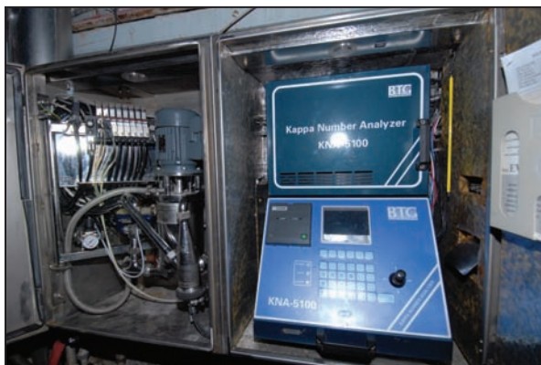
BTG KNA-5100 kappa number analyzer