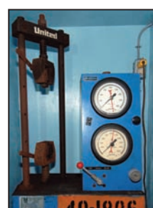
UNITED analog tensile tester