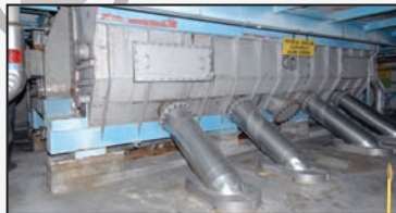
Bottom view of brown stock washer