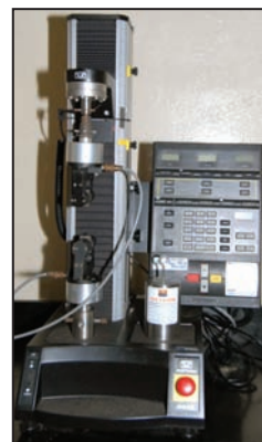
INSTRON digital tensile tester