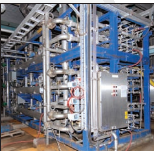
GLEGG-FILTERITE REVERSE OSMOSIS water filtration system