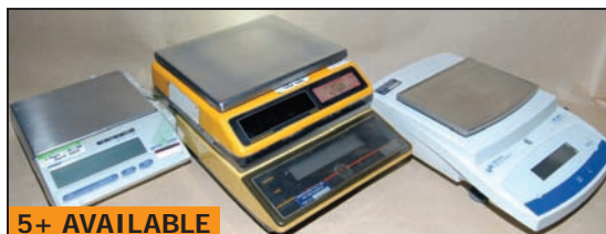
Partial view of digital balance scales