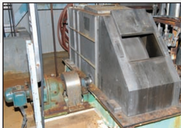
Titanium rotary filter screen