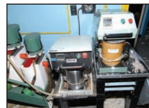
View of mixers

This brochure is only a partial listing. PLEASE VISIT OUR WEBSITE