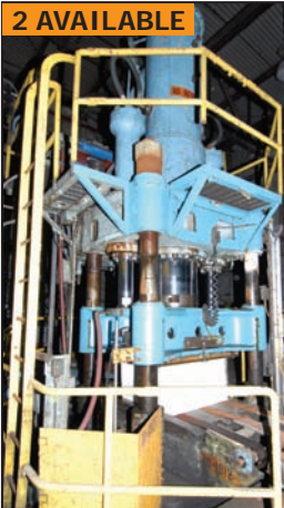
600 ton four post hydraulic pulp baling press