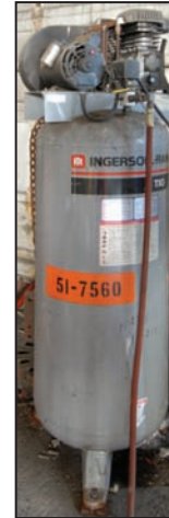
INGERSOLL RAND air comp.