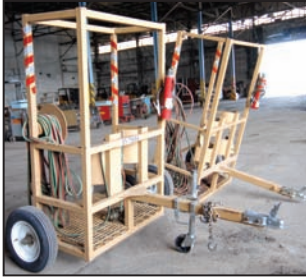
UNION CARBIDE portable oxy-acetylene torch trailers