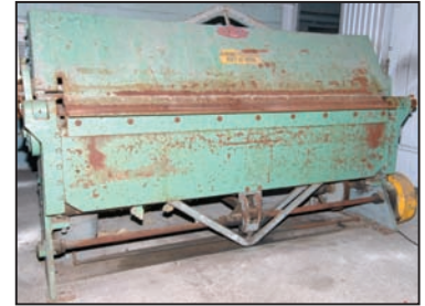
CHICAGO 10'X10GA power brake