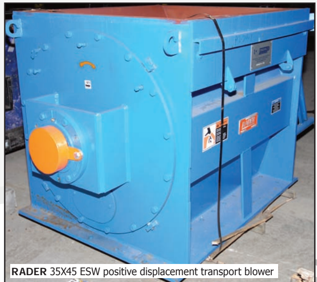
RADER 35X45 ESW positive displacement transport blower