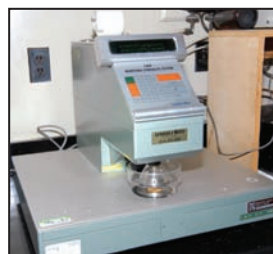
LORENTZEN & WETTRE digital strength tester