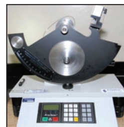
ELMENDORF digital tearing tester