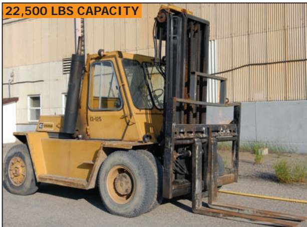
CATERPILLAR V225B DIESEL forklift