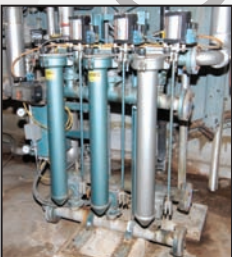
RONNINGEN PETER in line filters