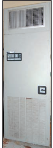
Floor mounted air make-up