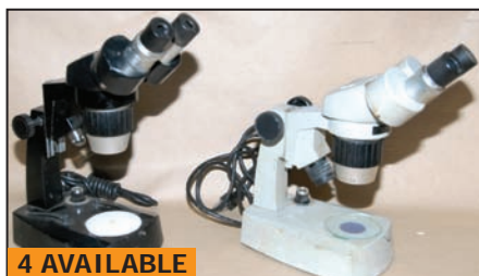
NIKON analog microscopes