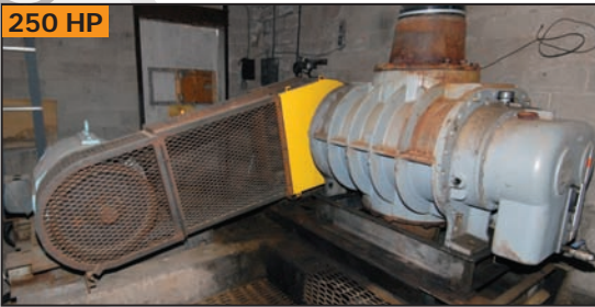
SUTORBILT 1437-5111 rotary type positive displacement transport blower