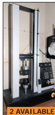
INSTRON digital tensile tester