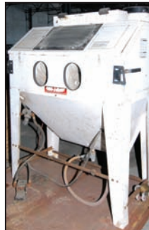
MOD-U-BLAST sandblasting cabinet