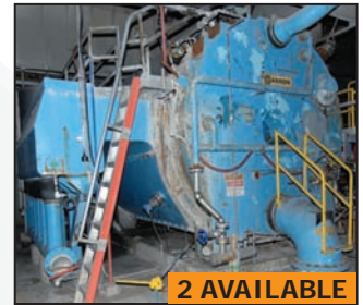
ML-KAMYR 800 series roll press