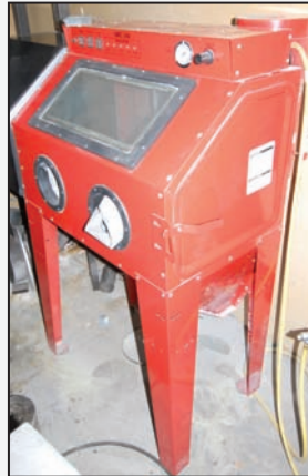
SBC 350 E SERIES sandblasting cabinet