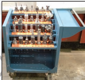
Partial view of CAT40 assorted tool holders available