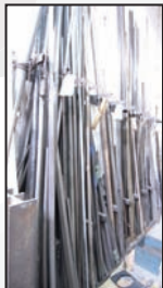
Partial view of raw material