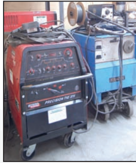
LINCOLN PRECISION TIG welder & MILLER MIG welder