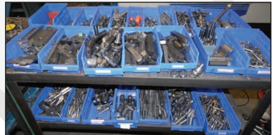
Partial view of clamping hardware available