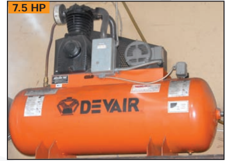
DEVAIR TAP-5052 7.5 HP tank mounted piston type air compressor