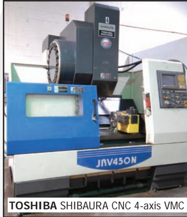
TOSHIBA SHIBAURA CNC 4-axis VMC