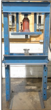
GOLDEN GEAR hyd. H-frame shop press