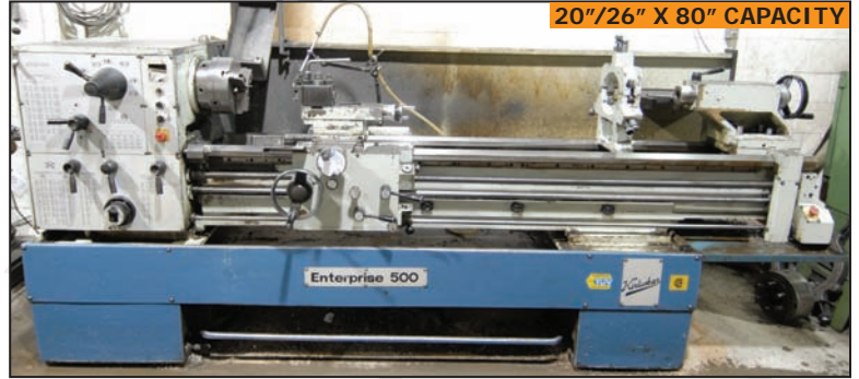
KIRLOSKAR ENTERPRISE 500 gap bed engine lathe