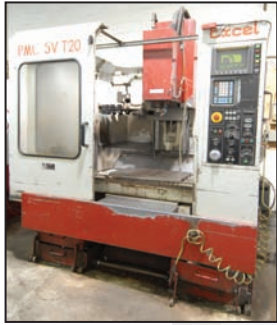
EXCEL PMC-5V T20 CNC vertical machining center