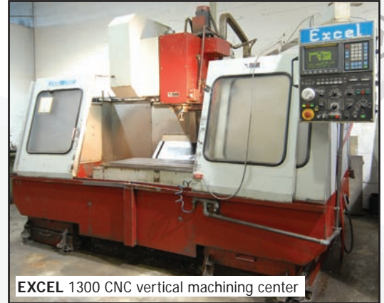
EXCEL 1300 CNC vertical machining center