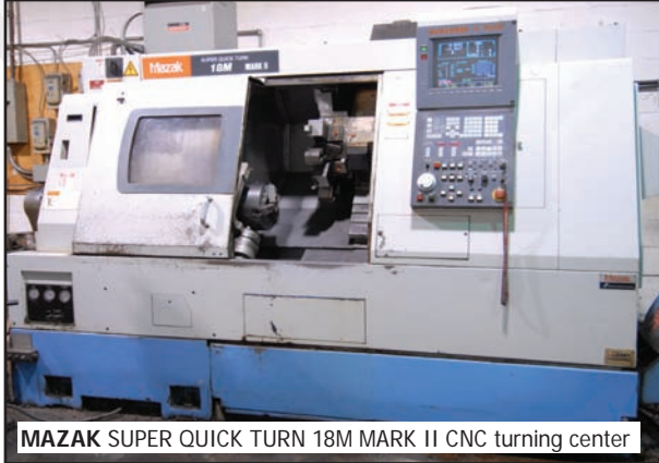
MAZAK SUPER QUICK TURN 18M MARK II CNC turning center