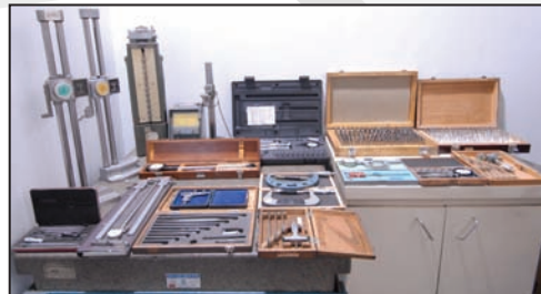
Partial view of inspection equipment available