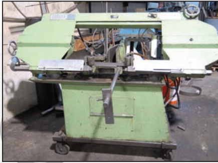
HESKA 260 10" horizontal band saw