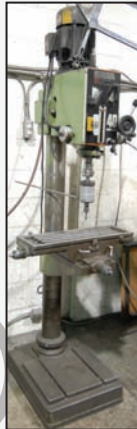
RONG FU drilling machine