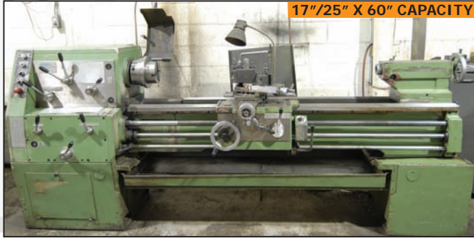
AFM TUG-40 gap bed engine lathe