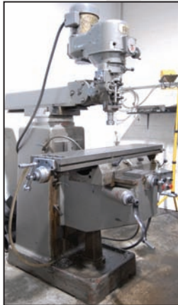
FIRST LC-185VS vertical turret milling machine