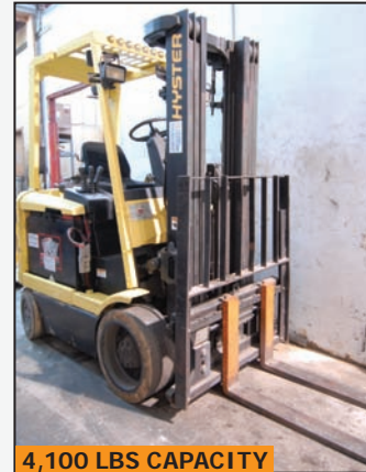
HYSTER E45XM-27 4,100 LBS cap electric forklift