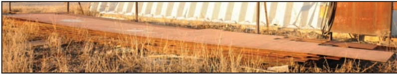
Partial view of steel plates available