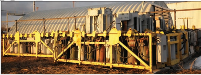
Partial view of transformers available