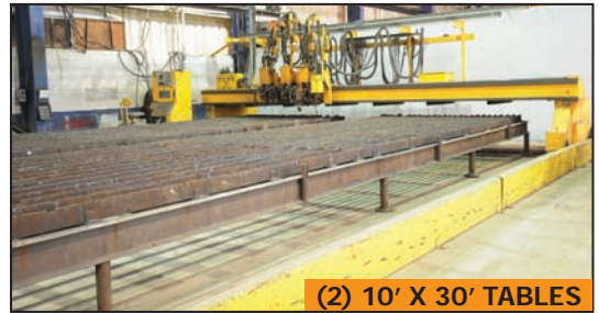
(2) 10' X 30' TABLES

ESAB AVENGER 2-8 CNC heavy duty gantry plate cutting system