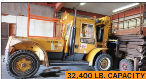
HYSTER H30B diesel forklift