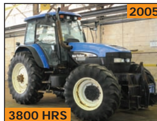
3800 HRS 2005 NEW HOLLAND TM155 4WD tractor