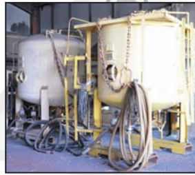
View of shot blast units