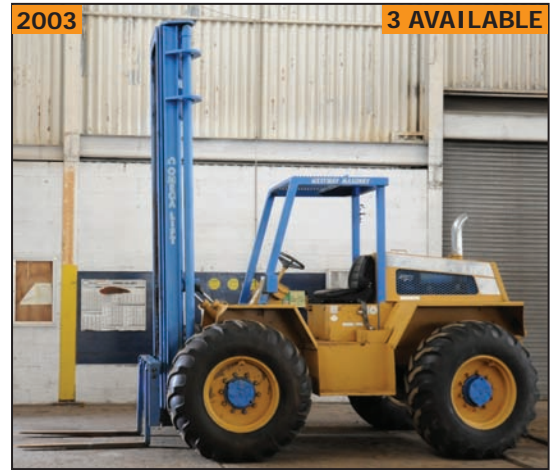
2003 3 AVAILABLE OMEGA LIFT 44236NT rough terrain high reach forklift