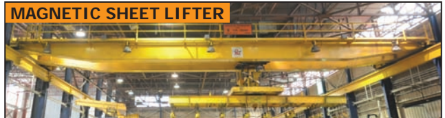
PROVINCIAL 8 ton double girder top running bridge crane