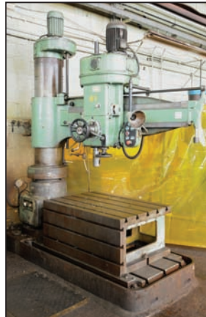
HCP VR 50/1.6 5' radial arm drill