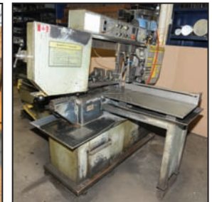
HYD-MECH S20A automatic horizontal band saw