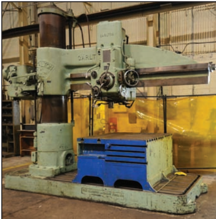
CARLTON 8' radial arm drill