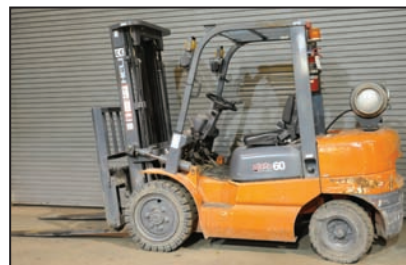
HELI FG 60 5150 lbs LPG forklift