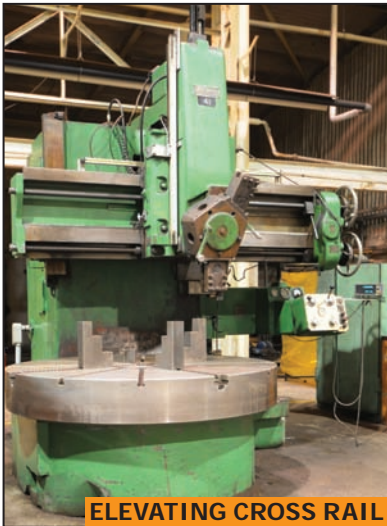
WEBSTER & BENNETT 72" vertical boring mill