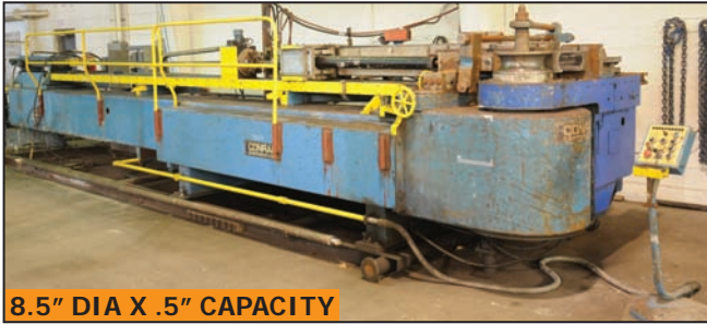
8.5" DIA X .5" CAPACITY

UNION CARBIDE CM 150 CNC oxy-acetylene cutting table