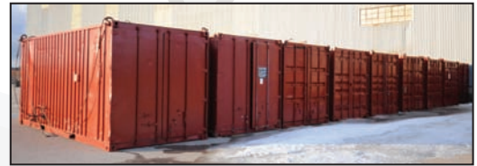
Partial view of steel containers available