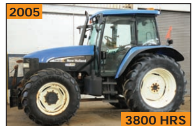
3800 HRS 2005 NEW HOLLAND TM120 4WD tractor