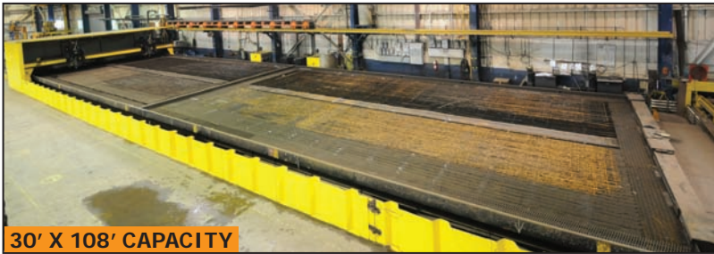
30' X 108' CAPACITY

ESAB AVENGER 2-8 CNC heavy duty gantry plate cutting system