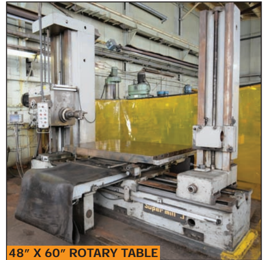
SUPERMILL J 4" table type horizontal boring mill