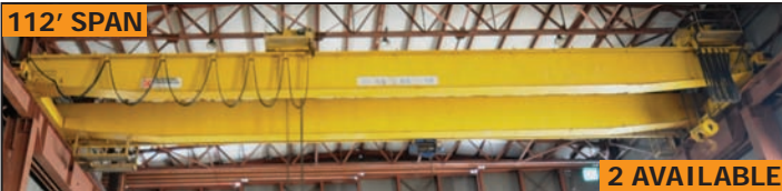
KOEHRING/PROVINCIAL 80 ton double girder top running bridge crane