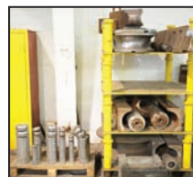
Partial view of pipe bending dies & mandrels