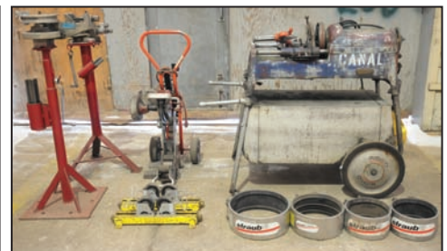
View of assorted pipe equipment available

FOR MORE DETAILED LISTINGS AND PHOTOS. www.corpassets.com