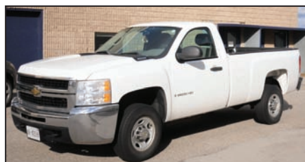
CHEVROLET 2500 HD pickup truck