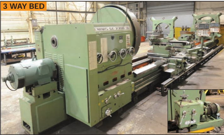
GEMINIS GE 2200-3G 86.7" X 42' heavy duty engine lathe (INSET: GEMINIS milling attachment)