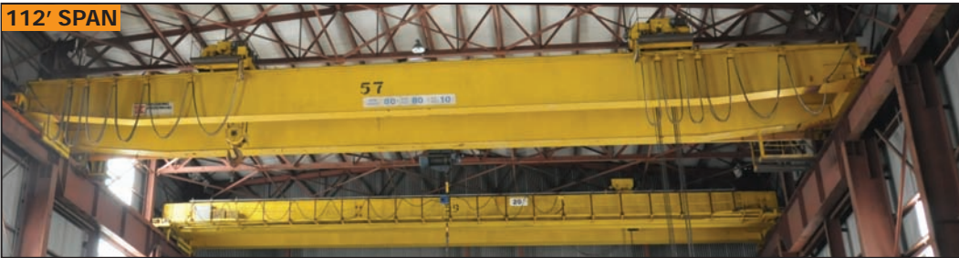
KOEHRING/PROVINCIAL 80 ton & 20 ton double girder cranes