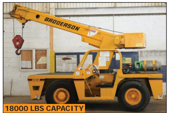
18000 LBS CAPACITY BRODERSON IC802D carry deck crane