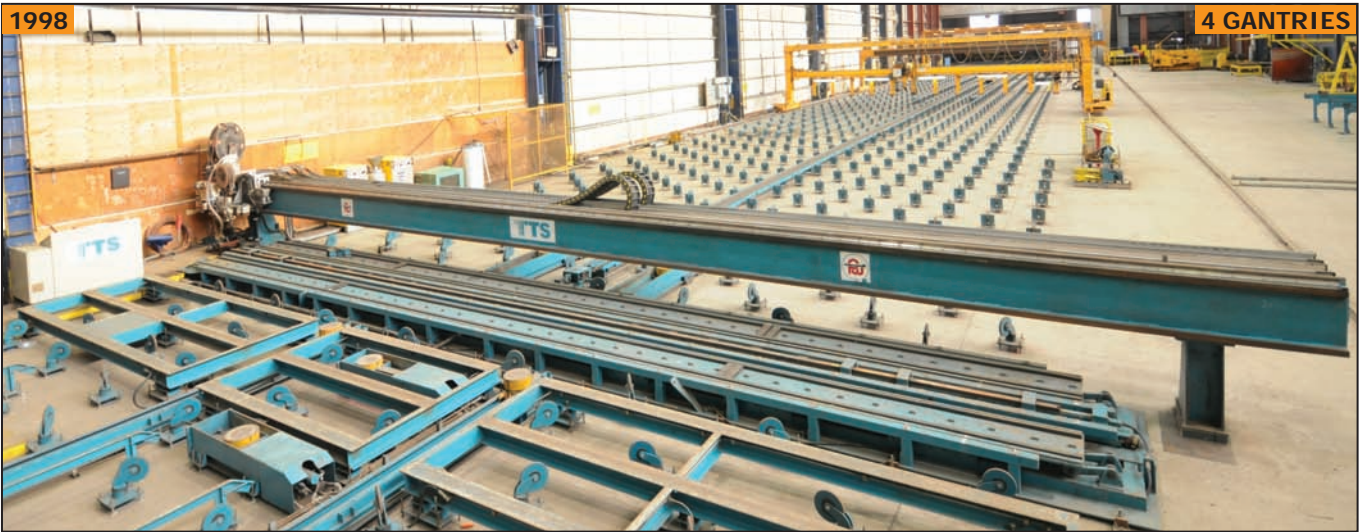
TTS panel production line