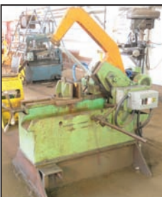
KASTO power hack saw