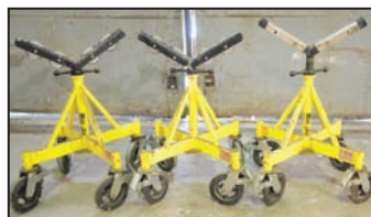
Partial view of pipe stands