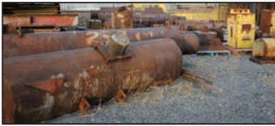
Partial view of counterweights available