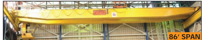
PROVINCIAL 10 ton double girder top running bridge crane