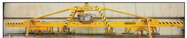
ANVER 16,000 lb, 36' vacuum lifter

This brochure is only a partial listing. PLEASE VISIT OUR WEBSITE