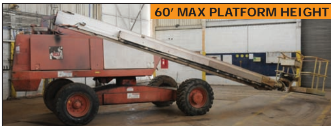
60' MAX PLATFORM HEIGHT SNORKELIFT A60R boom lift