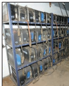
View of LINCOLN LN 25 welders