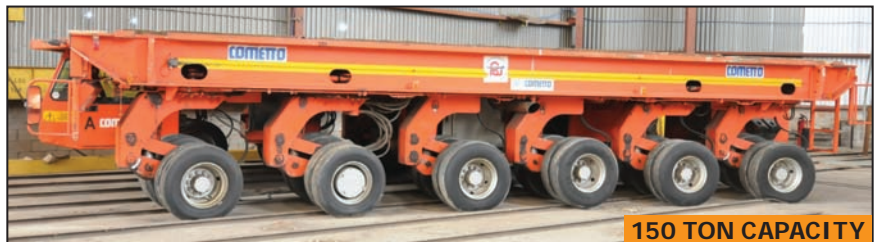
150 TON CAPACITY COMETTO ETL 150/6 12 axel, heavy duty, low-profile cabin, elevating transporter