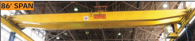
PROVINCIAL 10 ton double girder top running bridge crane