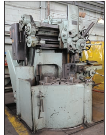
BULLARD 34" vertical boring mill