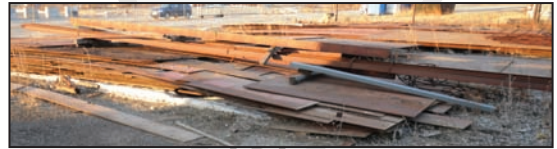
Partial view of steel remnants available