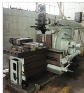
BERTRAM mechanical shaper