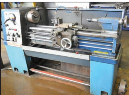
COLCHESTER MASTER 2500 gap bed engine lathe