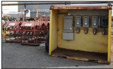
Partial view of marine accessories available