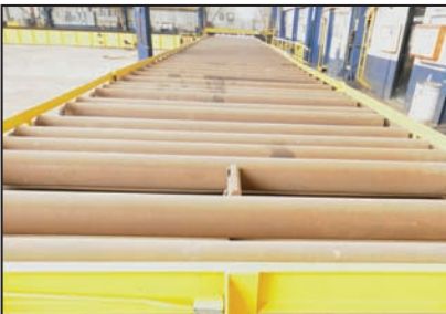
HEAVY DUTY 150' X 13 .5' wide power roller conveyor