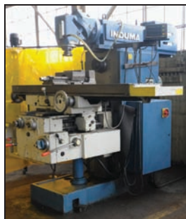
INDUMA motorized overarm mill