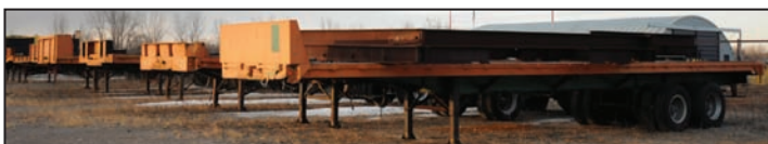
Partial view of trailers available