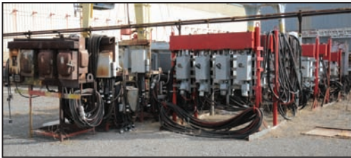
Partial view of marine accessories available