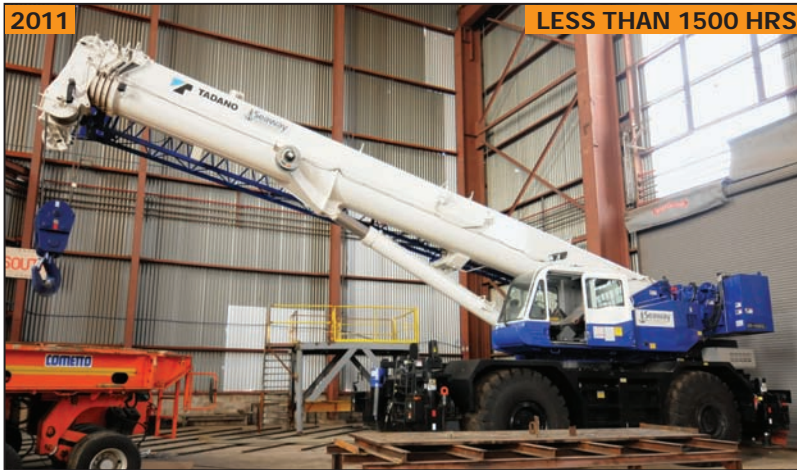
2011 LESS THAN 1500 HRS TADANO GR-1000XL 100 ton hydraulic rough terrain crane