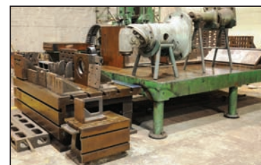
View of Machine Accessories