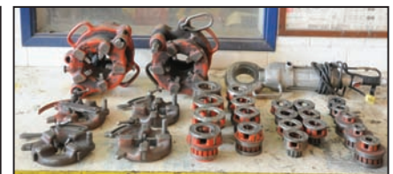
View of assorted pipe equipment available