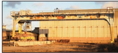
PROVINCIAL 8 ton gantry crane