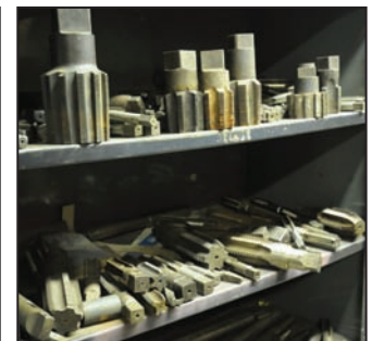
Partial view of Perishable tooling available

CONTACT 416.962.9600 TO CONSIGN EQUIPMENT AT AN UPCOMING AUCTION