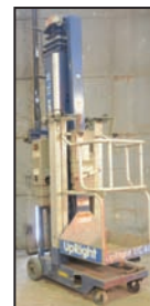
GENIE man lift