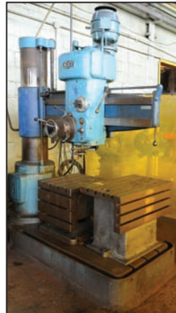
MAS VR4 4' radial arm drill