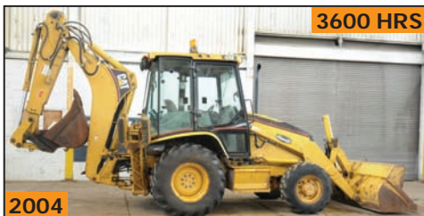
2004 3600 HRS CATERPILLAR 420D loader backhoe