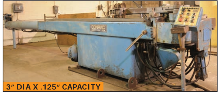
3" DIA X .125" CAPACITY

CONRAC 280 rotary die hydraulic pipe bender