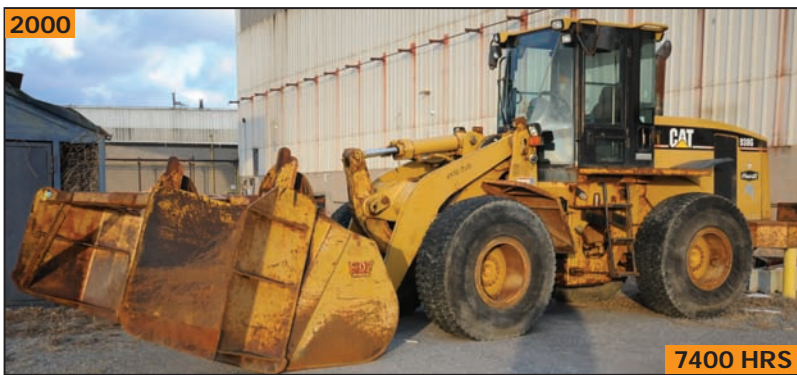
2000 7400 HRS CATERPILLAR 938G articulating front end wheel loader