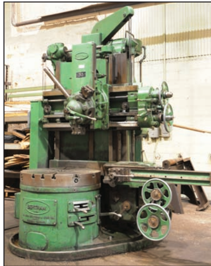
BERTRAM 40" vertical boring mill