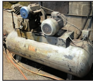
10 HP tank mounted piston type air compressor