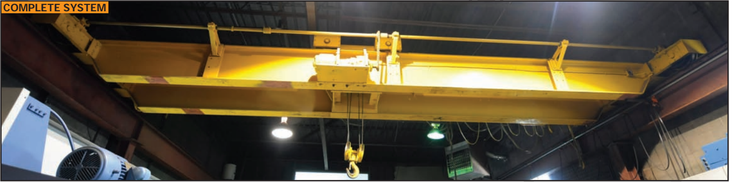
10 ton double girder crane