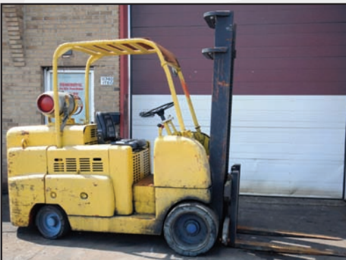
ALLIS CHALMERS 12000 lbs. LPG forklift