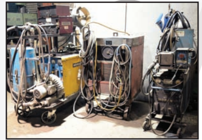
Partial view of welders available