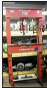
CAROLINA shop press