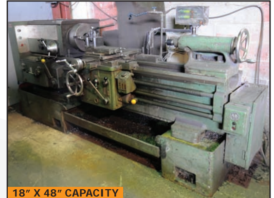
18" X 48" CAPACITY VDF 18" X 48" engine lathe