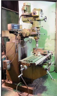
HOLKE F-11V vertical milling machine