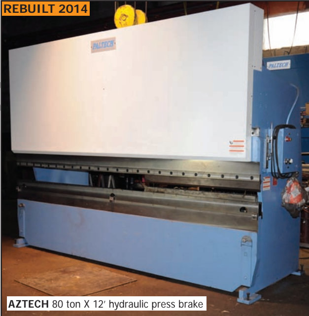
AZTECH 80 ton X 12' hydraulic press brake