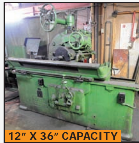
12" X 36" CAPACITY NORTON hydraulic surface grinder