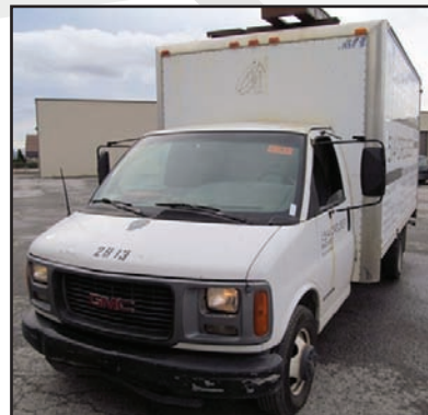
GMC SAVANNAH cube van