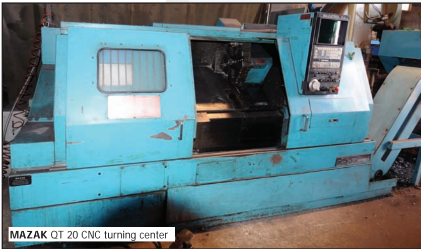
MAZAK QT 20 CNC turning center