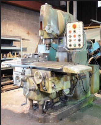
TOS FA5BV vertical milling machine