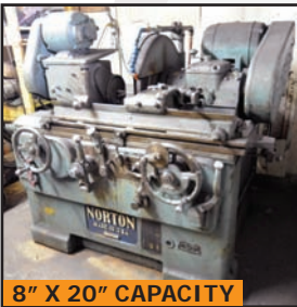
8" X 20" CAPACITY NORTON plain cylindrical grinder