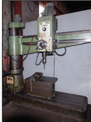
BERGONZI 5' radial arm drill