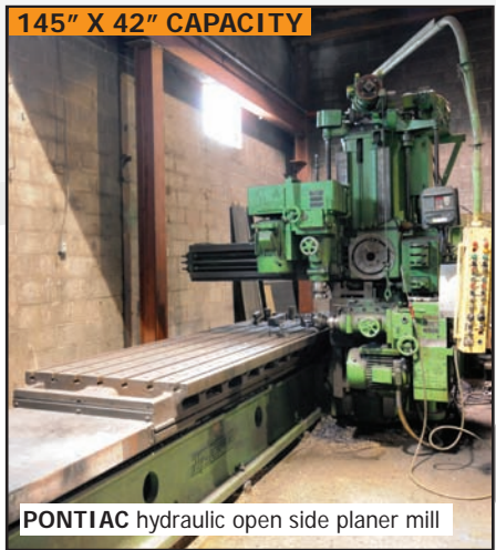
PONTIAC hydraulic open side planer mill