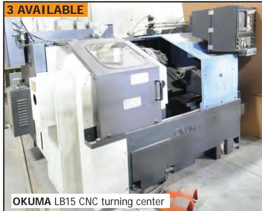
OKUMA LB15 CNC turning center