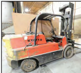
HYSTER S120A 12000 lbs LPG forklift