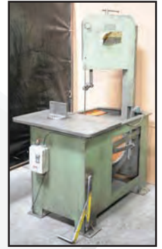
VERTICUT 115B vertical band saw