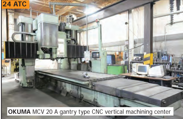
OKUMA MCV 20 A gantry type CNC vertical machining center