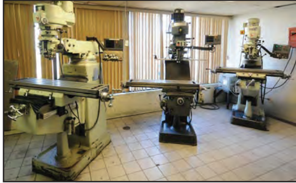
View of vertical milling machines