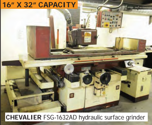
CHEVALIER FSG-1632AD hydraulic surface grinder