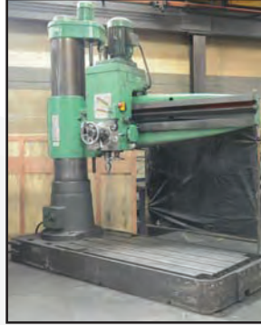
CESPEL RFH75-2000 7' radial arm drill