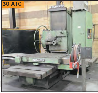
BURGMASER HTC 330 CNC horizontal machining center