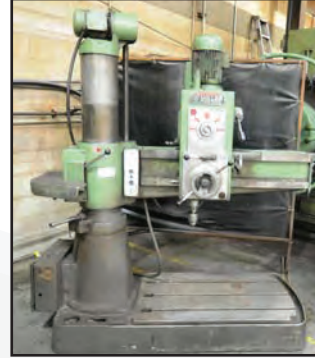
BERGONZI FS 1000 4' radial arm drill