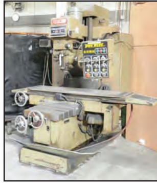
TOPWELL TW-105 bed type vertical milling machine