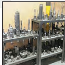
Partial view of tool holders available