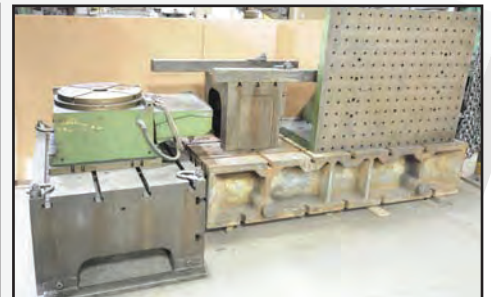
Partial view of machine accessories available