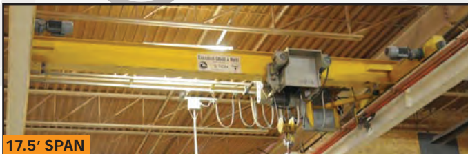
CANADIAN CRANE 5 ton free standing crane system