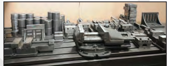
Partial view of machine accessories available

ALSO: (2) OKUMA MCV-A, large capacity CNC bridge type vertical machining centers with 50 taper spindles & tool changers; DANLY SS2-300-108-84 SSDC press; (4) OKUMA CNC turning centers; CHEVALIER FSG-1632AD hydraulic surface grinder; CHEVALIER FSG-618M surface grinder; HEPBURN 20 ton double girder free standing crane system; CANADIAN CRANE 5 ton single girder free standing crane system; TOYOTA LPG forklift; HYSTER LPG forklift; (3) air compressors; T-JAW 500 vertical bandsaw; 5' radial arm drill with box table; MILLER 3' radial arm drill with box table; BURGMASER CNC horizontal machining center with FANUC CNC control; TOP WELL heavy duty vertical milling machine; TOS heavy duty vertical milling machine; MILLER welders; (3) FIRST vertical milling machines; 500 ton press Vibro-pads; LARGE ASSORTMENT of tooling, power tools, 50 taper tool holders, machine vises, angle plates and box tables, saw horses, lifting chains and accessories, hydraulic jack systems, lathes & MORE!