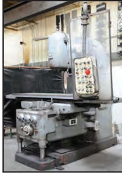
TOS FB40V vertical milling machine