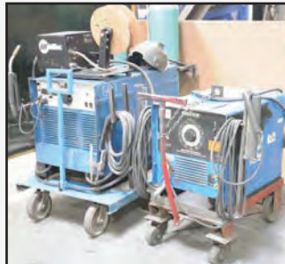
Partial view of welders available