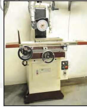
CHEVALIER FSG-618 manual surface grinder