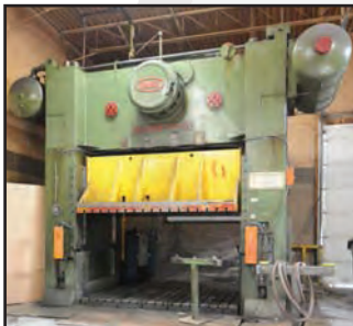
DANLY SS2-300-108-84 straight side double crank press