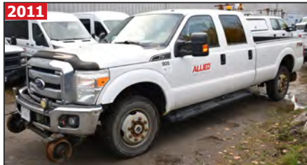
FORD F-350 XLT FX4 crew cab pickup truck