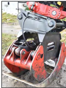
View of HITACHI ZX230W attachment