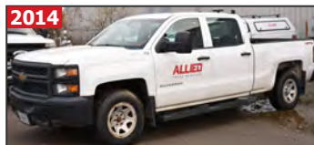
CHEVROLET SILVERADO 1500 crew cab pickup truck