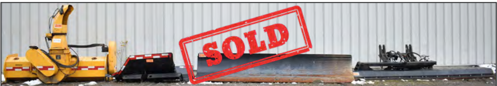
View of NORDCO MODEL B M7 ballast regulator winter package

CONTACT 416.962.9600 TO CONSIGN EQUIPMENT AT AN UPCOMING AUCTION