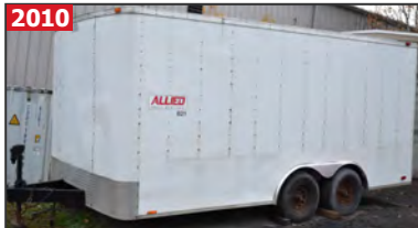
FOREST RIVER tandem axle 16' enclosed utility trailer