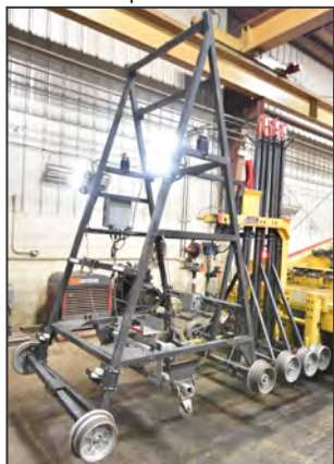
View of HARSCO sensor tower