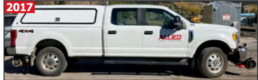
FORD F-250 SUPER DUTY hi-rail crew cab pickup truck