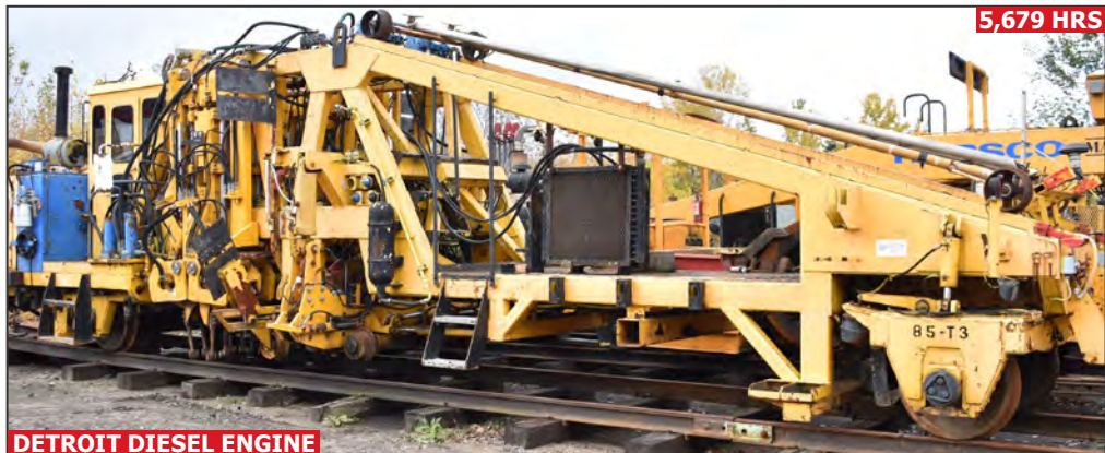
DETROIT DIESEL ENGINE JACKSON 6700 tamper