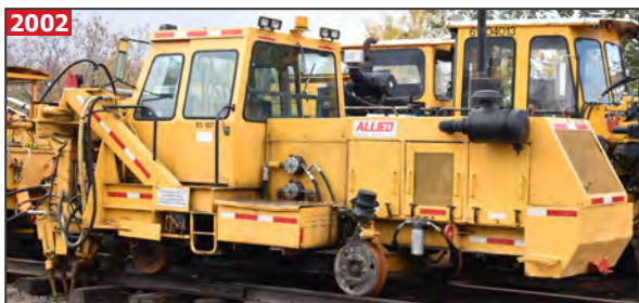
2002 HARSCO HTT STM chase tamper