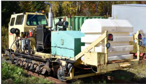
NORTH self-propelled rail heater