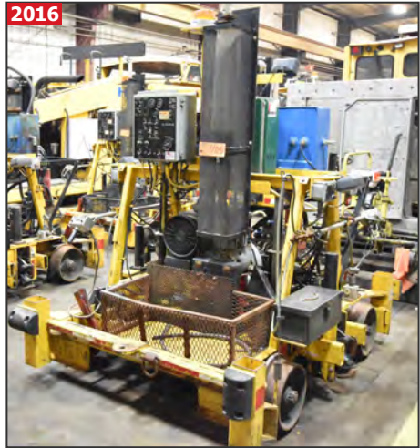
NORDCO MODEL LS rail hydraulic self-propelled auto-lift system