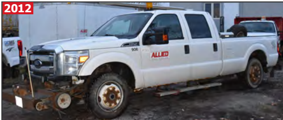
FORD F-250 XLT crew cab pickup truck