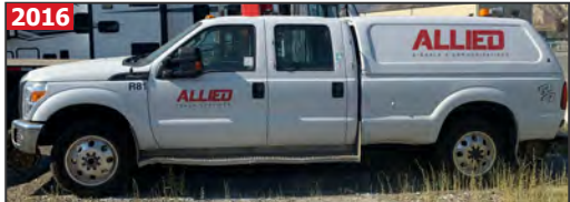
FORD F-250 SUPER DUTY hi-rail crew cab pickup truck