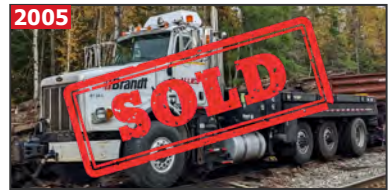
PETERBILT (2005) 357 tri-axle tracker truck