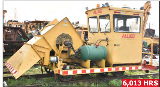
NORTHERN CHICAGO blower self-propelled blower