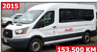
FORD TRANSIT 15-passenger van