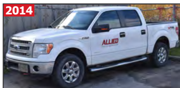
FORD F-150 XLT crew cab pickup truck