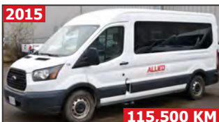
FORD TRANSIT 15-passenger van