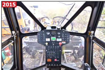
Interior cab view of NORDCO MODEL D TRIPP tie remover/insertor