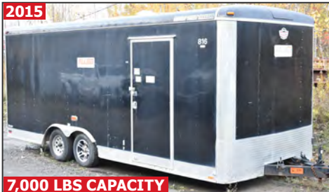
7,000 LBS CAPACITY