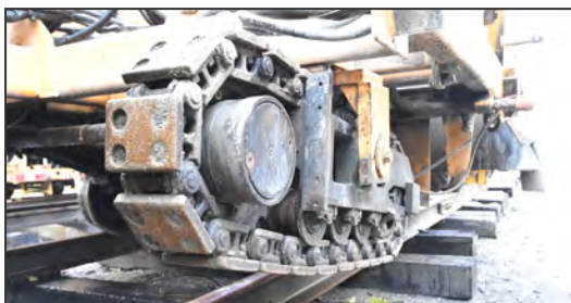
View of KERSHAW track