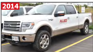
FORD F-150 XTR crew cab pickup truck