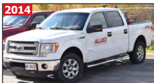
FORD F-150 XTR crew cab pickup truck