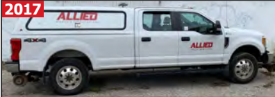
FORD F-350 SUPER DUTY hi-rail crew cab pickup truck