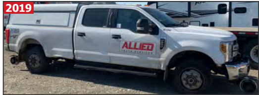
FORD F-250 XTL SUPER DUTY hi-rail crew cab