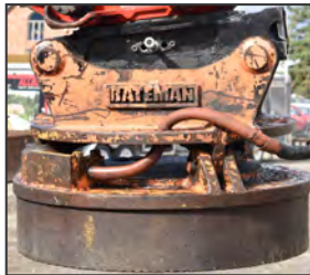
View of HITACHI ZX230W rotator attachment