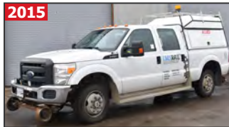
FORD F-250 SUPER DUTY hi-rail crew cab pickup truck