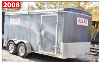
CARGO MAX enclosed utility trailer