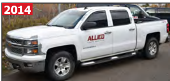
CHEVROLET SILVERADO LT 1500 crew cab pickup truck