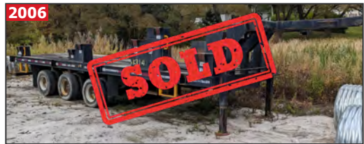
MAJESTIK 28' tri-axle equipment hauler trailer with BRANDT OTM tracker conversion

CONTACT 416.962.9600 TO CONSIGN EQUIPMENT AT AN UPCOMING AUCTION