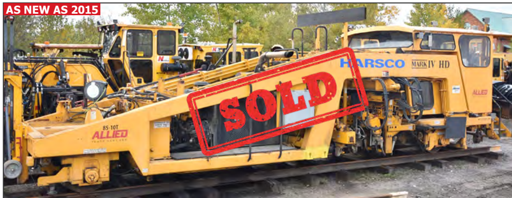
HARSCO MODEL MK IV HD tamper