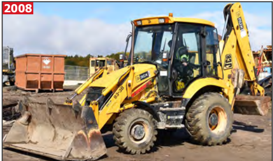
JCB 3CX backhoe