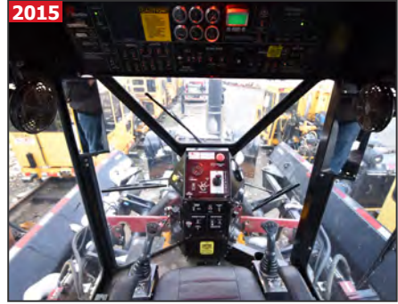
Interior cab view of the NORDCO MODEL B M7 ballast regulator