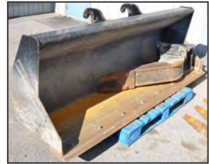
View of CAT bucket and trench attachments