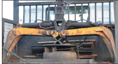
View of grapple attachment