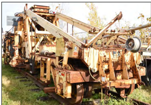
JACKSON 6700 tamper