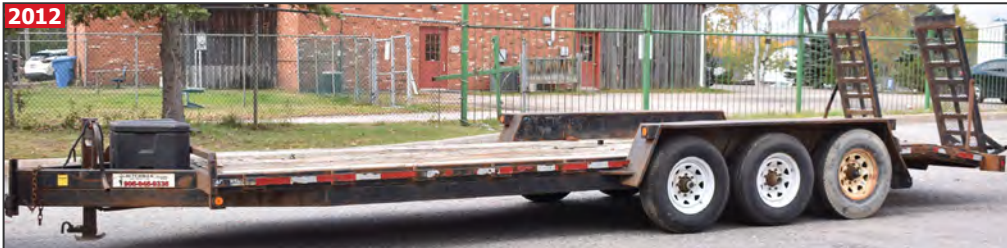
HITCHMAN tri axle flat deck trailer