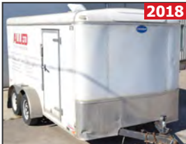
UNITED TRAILERS tandem axle 14' enclosed utility trailer