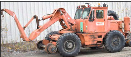
PETTIBONE 441B SPEEDSWING loader