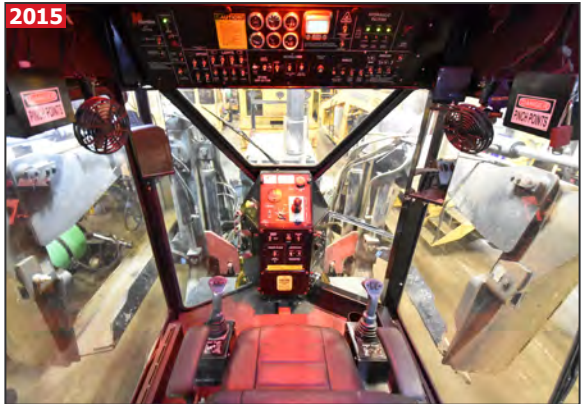
Interior cab view of the NORDCO MODEL B M7 ballast regulator