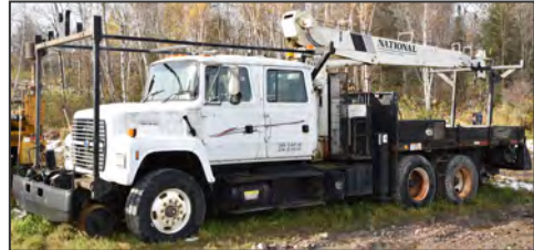
FORD LNT8000 tandem axle boom truck