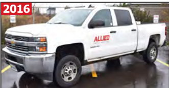
CHEVROLET SILVERADO 2500 HD crew cab pickup truck