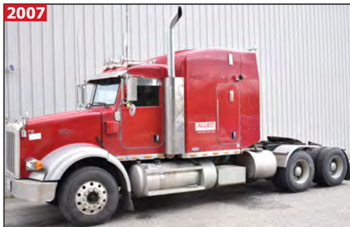
PETERBUILT 378 TT/CT tandem axle semi tractor truck