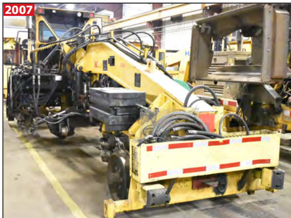
NORDCO MODEL C TRIPP tie remover/insertor