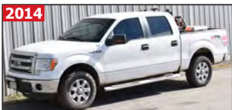
FORD F-150 XLT crew cab pickup truck