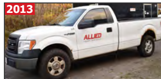
FORD F-150 XL regular cab pickup truck