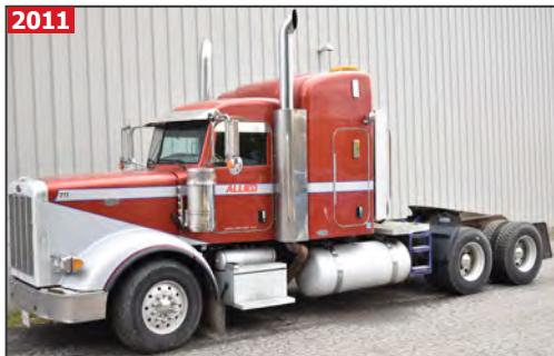
PETERBUILT 367 TT/CV tandem axle semi tractor truck