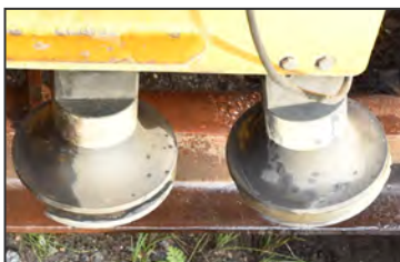
View of HARSCO tie bells