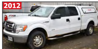
FORD F-150 XLT crew cab pickup truck