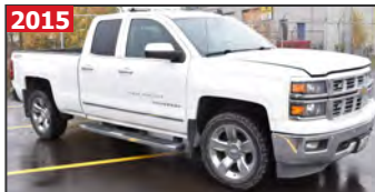
CHEVROLET SILVERADO 1500 SUPER CREW crew cab pickup truck