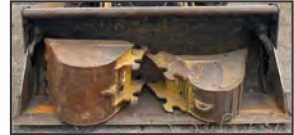
View of CAT bucket attachment