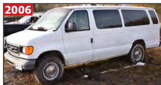
FORD E-350 passenger van

CONTACT 416.962.9600 TO CONSIGN EQUIPMENT AT AN UPCOMING AUCTION