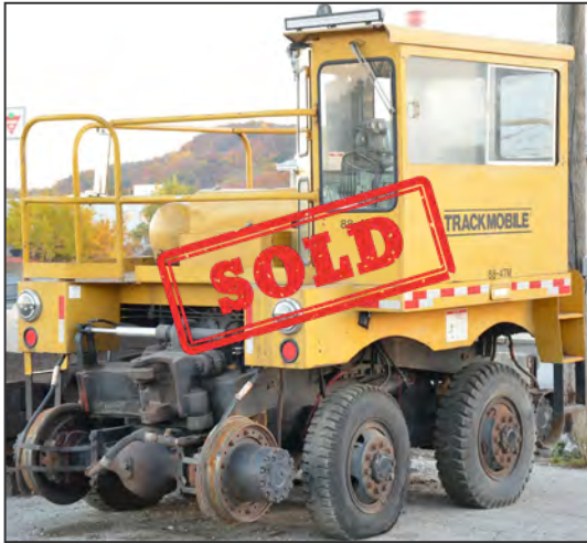
TRACKMOBILE 9TM mobile railcar mover