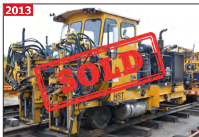
2013 NORDCO HST tamper