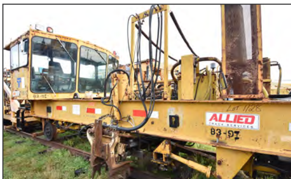
TAMPER TR10 tie remover/insertor