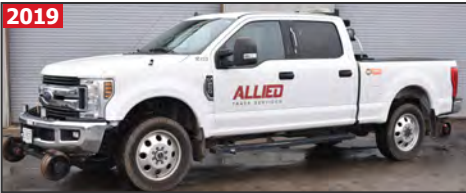
FORD F-250 XTL SUPER DUTY hi-rail crew cab pickup truck