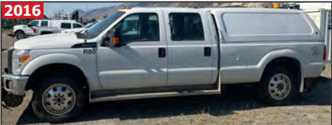
FORD F-250 SUPER DUTY hi-rail crew cab pickup truck