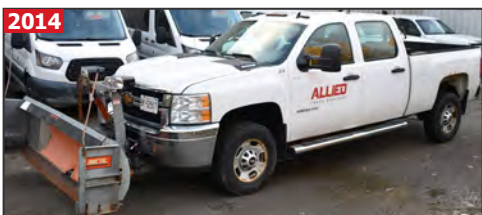
CHEVROLET SILVERADO 2500 crew cab pickup truck