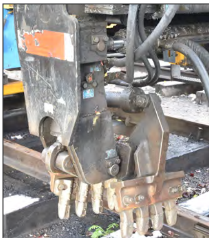
View of NORDCO TRIPP workhead

TO SCHEDULE AN AUCTION CONTACT 416.962.9600