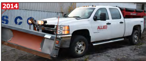
CHEVROLET SILVERADO 2500 crew cab pickup truck