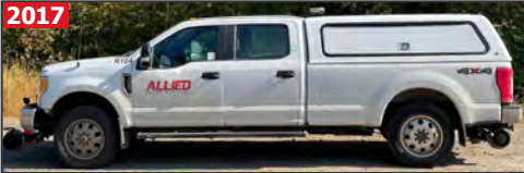
FORD F-250 SUPER DUTY hi-rail crew cab pickup truck