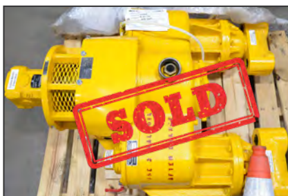
Partial view of spare tamper work heads available