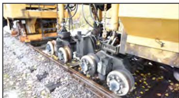
View of HARSCO track

HARSCO FAIRMONT TAMPER HTT T50-27 track stabilizer