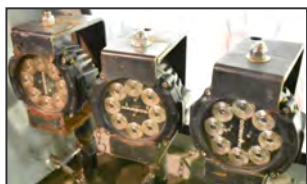
View of HARSCO sensors