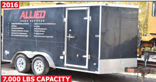
7,000 LBS CAPACITY