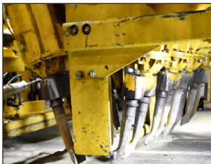
View of HARSCO work heads