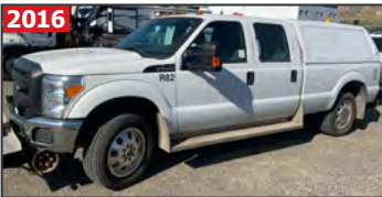
FORD F-250 SUPER DUTY hi-rail crew cab pickup truck