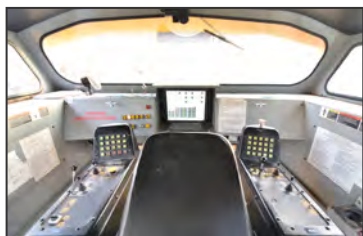
Interior cab view of the HARSCO MODEL MK IV HD tamper