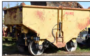
Ballast hopper rail cart