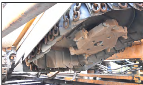
View of KERSHAW table