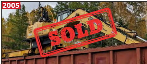
JOHN DEERE 120C hydraulic excavator with BRANDT OTM tracker conversion