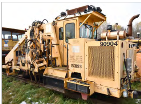
JACKSON 3300 tamper