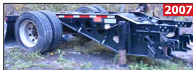
MAGNUM booster axle

TO SCHEDULE AN AUCTION CONTACT 416.962.9600