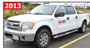
FORD F-150 XTR crew cab pickup truck