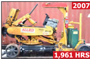
MEADOWELD RS-98NU-bear abrasive rail saw