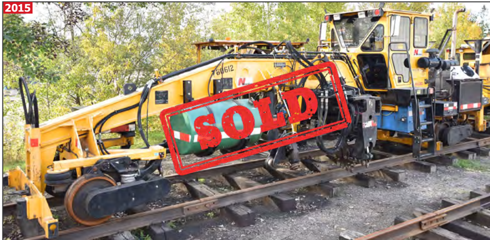
NORDCO MODEL D TRIPP tie remover/insertor