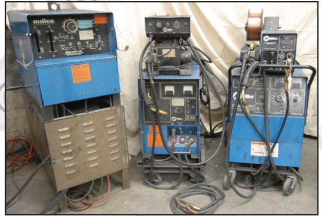
View of MILLER welders