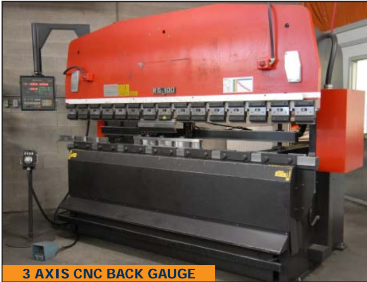
3 AXIS CNC BACK GAUGE AMADA RG100, 100 ton x 10 ft CNC hydraulic press brake