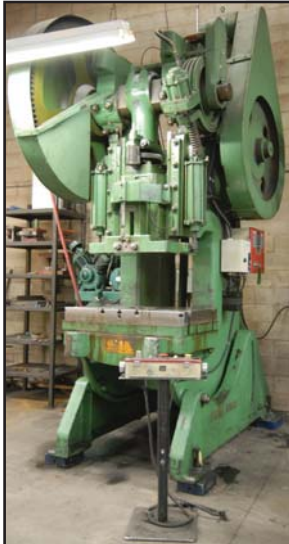
BROWN BOGGS 20 LJ, gap frame press