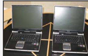
View of TOSHIBA laptop computers