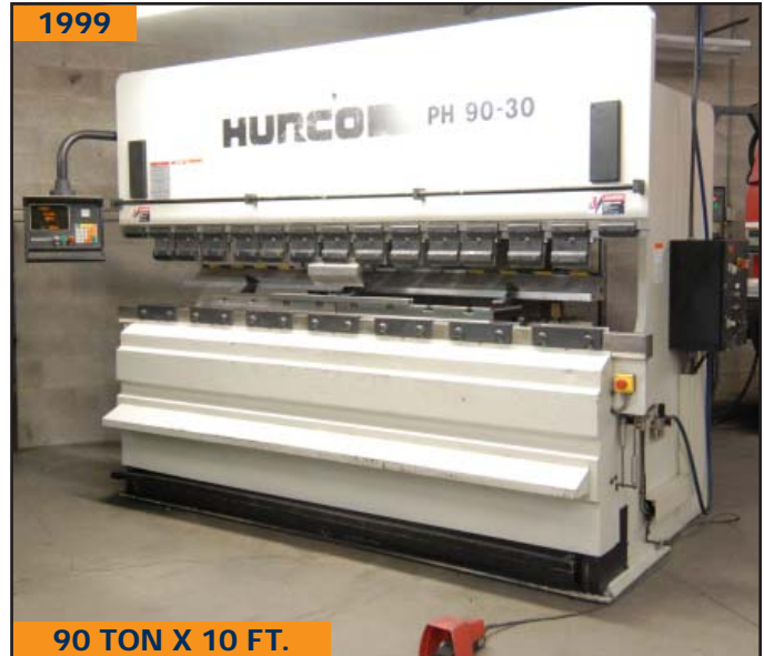
1999 90 TON X 10 FT. HURCO PH 90-30, CNC hydraulic press brake