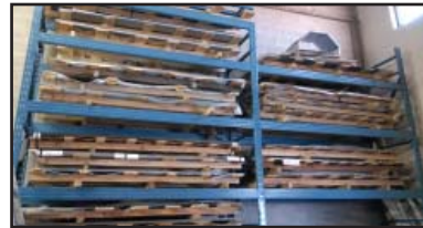
Partial view of raw material