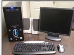
Partial view of computers