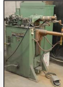
PRECISION 75 KVA spot welder