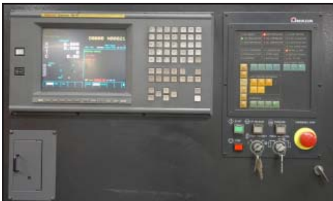
FANUC 18P CNC control