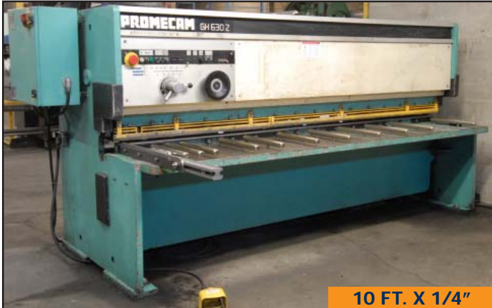
PROMECAM GH 630Z shear