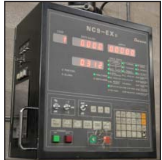
AMADA NC9-EX11, CNC control