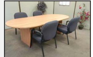
View of office furniture