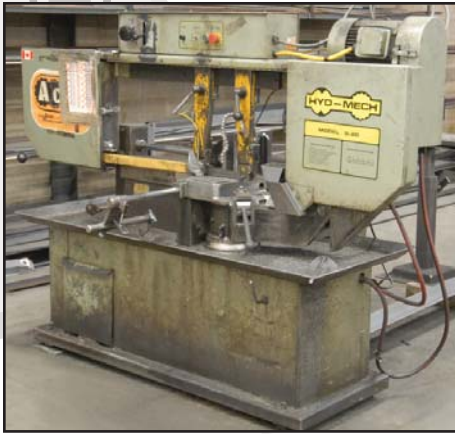
HYD MECH S20, bandsaw