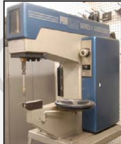
PEMSERTER SERIES 4, hardware insertion press