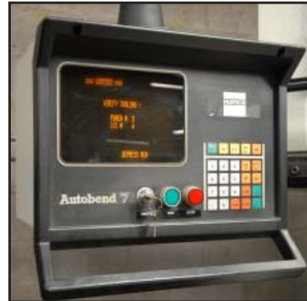
HURCO AUTOBEND 7, CNC control