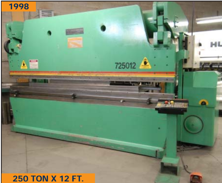
1998 250 TON X 12 FT. ACCURPRESS 725012, CNC hydraulic press brake