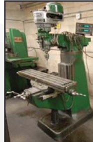
BRIDGEPORT vertical milling machine