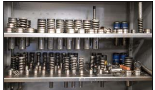
Partial view of punch tools