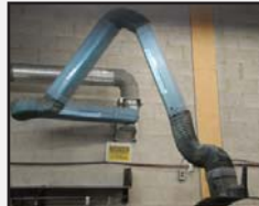
NEDERMAN arm c/w dust collect