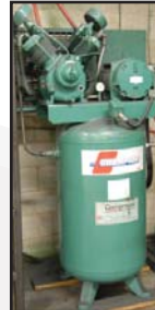
CHAMPION 10 HP air compressor