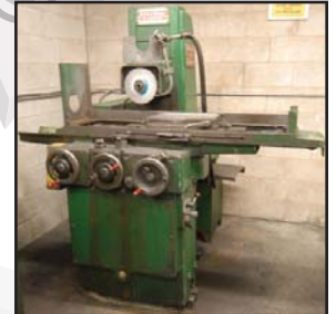
BROWN & SHARPE 618 surface grinder