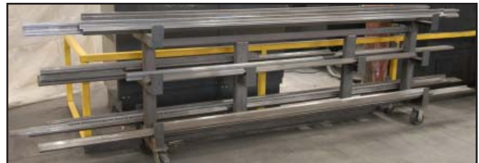
Partial view of press brake dies