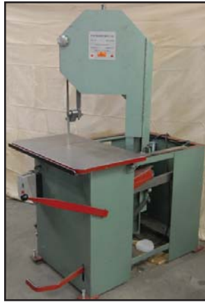
ER MAIER KM1012 bandsaw