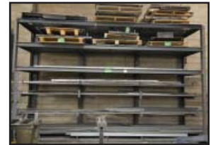
Partial view of raw material