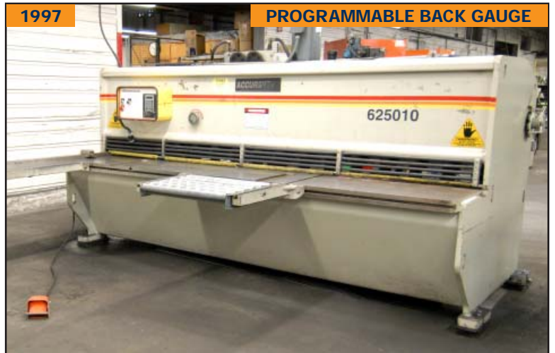
ACCUR SHEAR 625010 CNC hydraulic shear