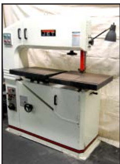
JET vertical band saw