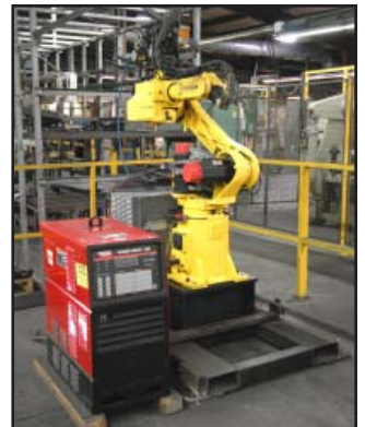
FANUC ARCMATE 120i CNC welding robot w/ LINCOLN POWERWAVE 450