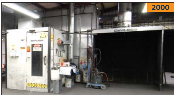
DEVILBISS paint system