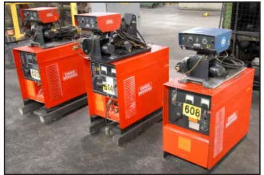
CANNOX MIG welders