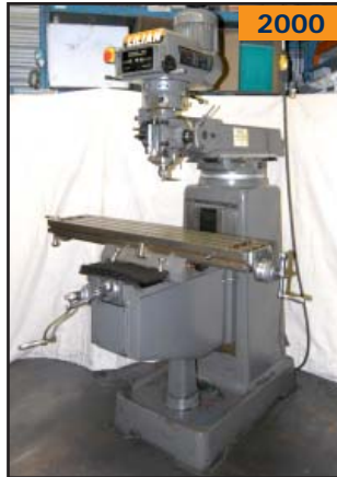
LILIAN 3VH vertical turret milling machine