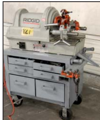
RIDGID 1822 pipe threader