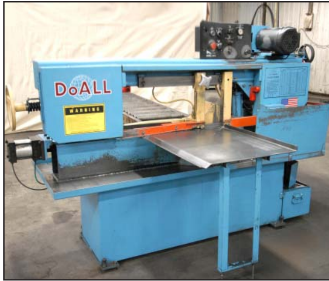
DOALL C-916 horizontal band saw