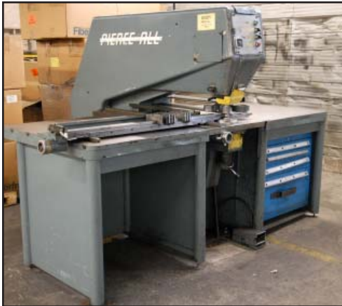
PIERCEALL single end hydraulic duplicating punch