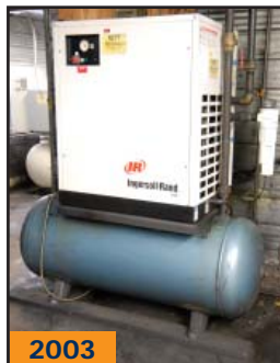
2003 INGERSOLL RAND TMS 200 air dryer