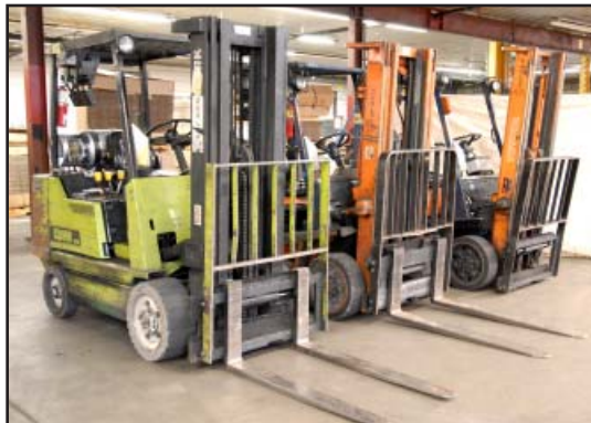
View of Forklifts