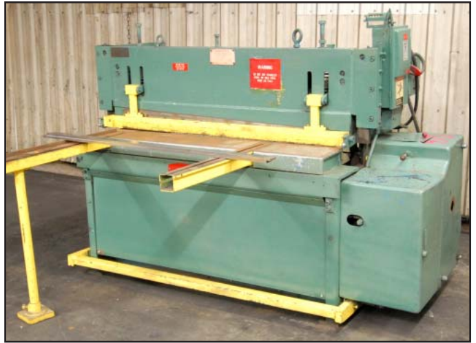
KEETONA 4' x .120" mechanical shear