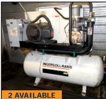
2 AVAILABLE INGERSOLL RAND EP25-ESP 25 HP rotary screw air compressor