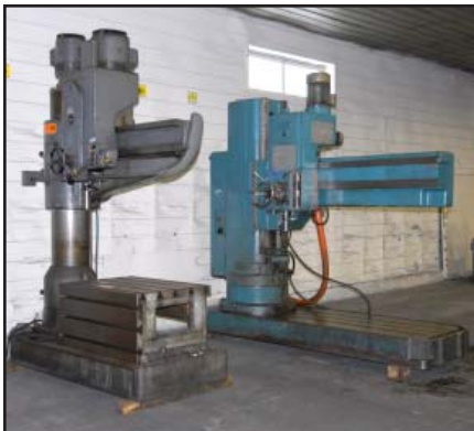
MAS & AJAX radial drills