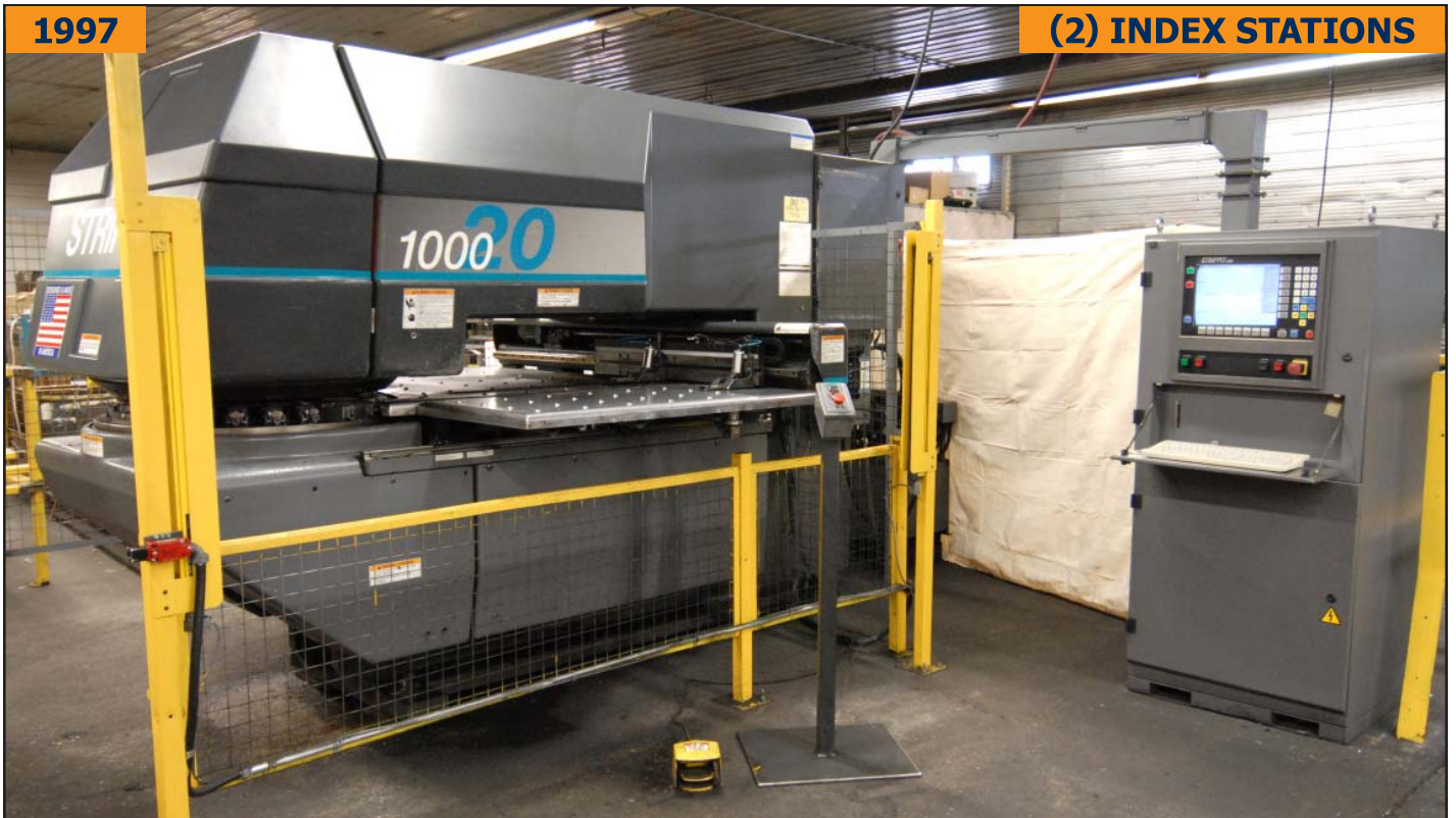
STRIPPIT FC 1000/20 CNC turret punch