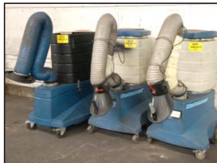
NEDERMAN fume extractors