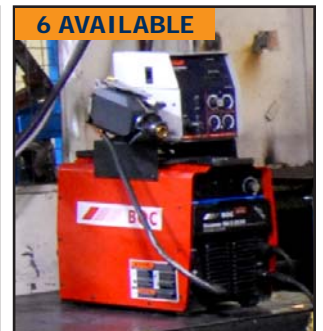
6 AVAILABLE CANNOX STARPOWER 304 C-CC/CV MIG welder