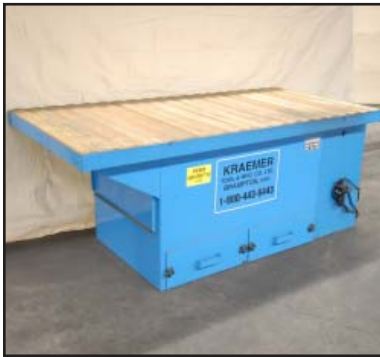
KRAEMER KTM DDT downdraft table