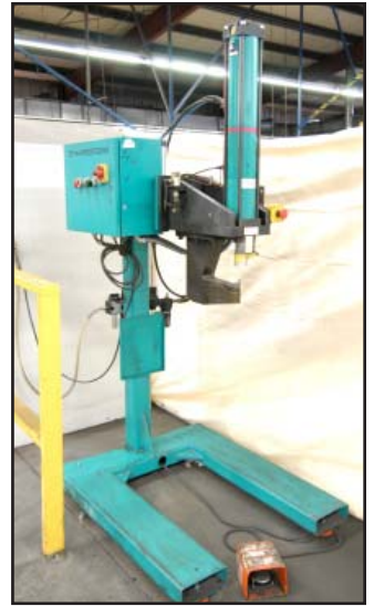
TOX PC 8 ton insertion press