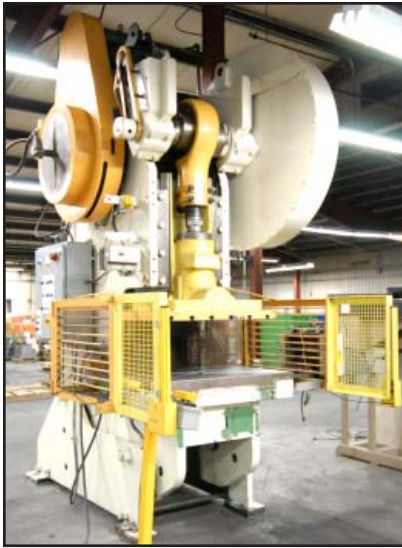
GOREJ OBI press