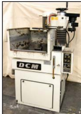
DCM PDG5-3AF punch grinder