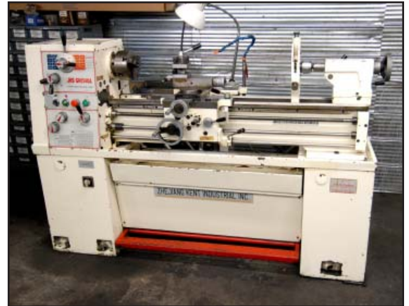
JHS GH1340A toolroom lathe