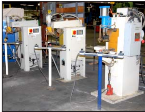
View of Spot Welders