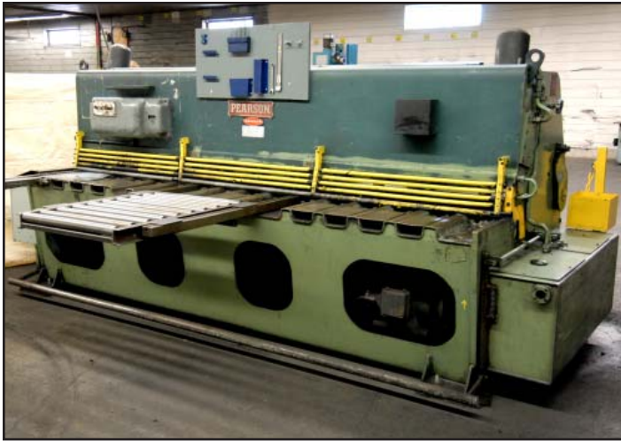
PEARSON hydraulic shear with 10' X .25"