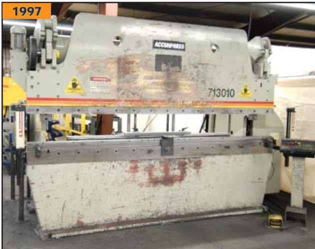
ACCURPRESS 713010 130 ton hydraulic press brake