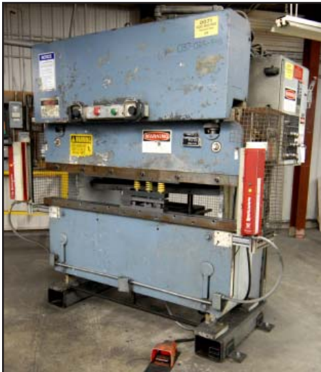
PACIFIC JL 55-6 55 ton hydraulic press brake