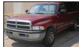
DODGE RAM 1500 truck