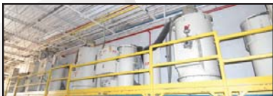
View of media delivery system