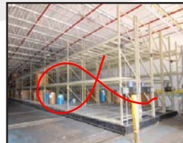
View of automated racking system