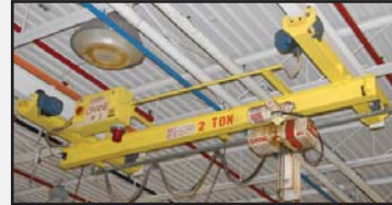
MT.CLEMENS 2 ton crane