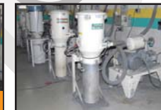
CONAIR vacuum pumps