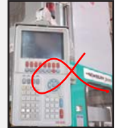
View of PATHFINDER control for NEWBURY mold machines