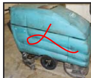
TENNANT floor sweeper