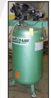
SPEEDAIRE 5HP air compressor