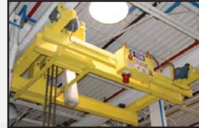
MT.CLEMENS 5 ton crane