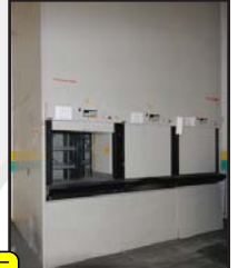
8000 automated storage system