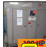
100 HP LEROI air compressor