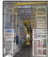
Storage system with lift