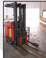
RAYMOND electric reach truck