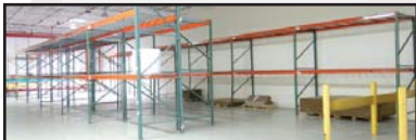
Adjustable pallet racking