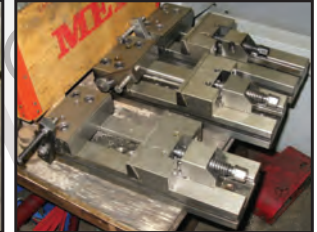
Qty of tooling, machine vices, tables, racks etc.