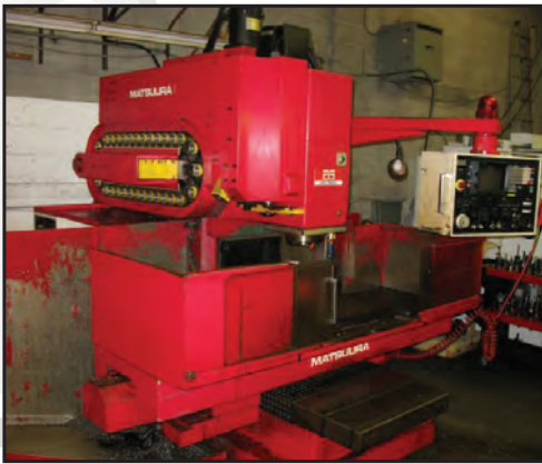
MATSUURA MC-760V CNC VMC