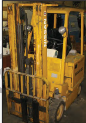
NISSAN electric forklift with charger, approx. 2,500 lbs.