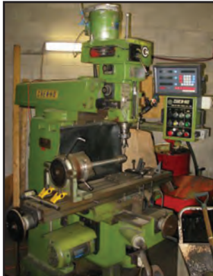
CHEN-HO (1994) CH-2BAT vertical mill