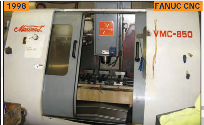
MAXIMART VMC 850, CNC VMC