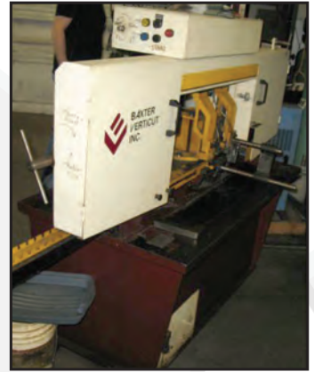
BAXTER 360HSA VERTICUT saw