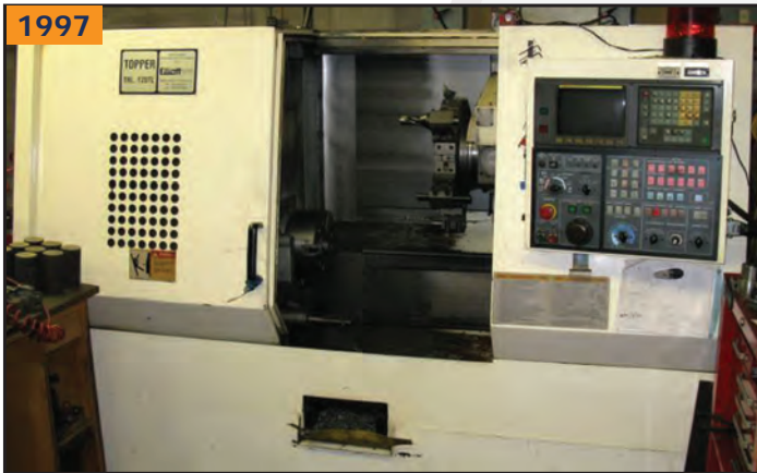
TOPPER TNL/120TC CNC lathe