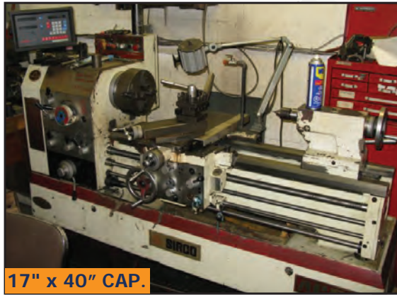
17" x 40" CAP.