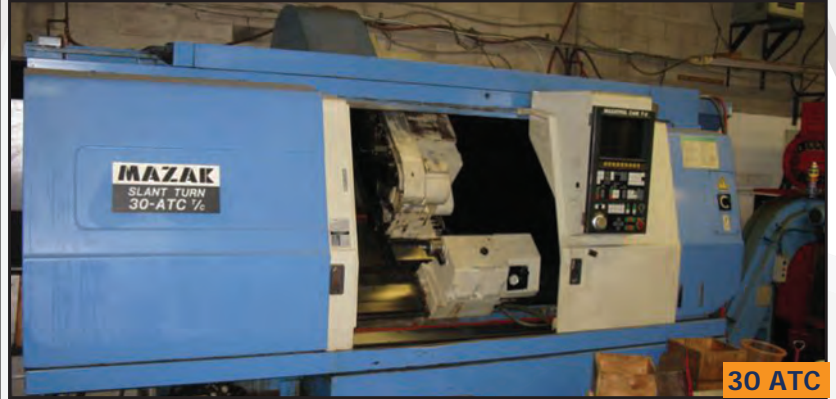
MAZAK CNC slant bed lathe