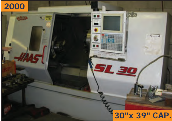
HAAS SL 30T CNC lathe