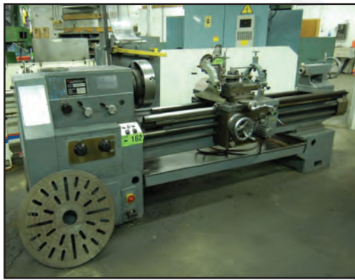
HAVLIK L-5-2000 engine lathe