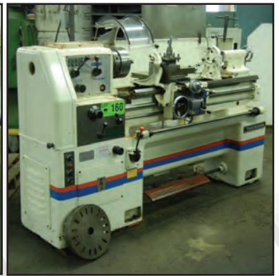
TAKISAWA TSL-DELUXE 1000 CD engine lathe