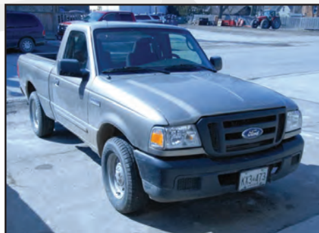
FORD RANGER p/u truck