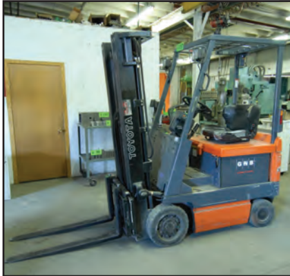
TOYOTA 3000 lb. cap. electric forklift