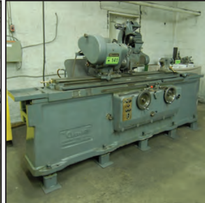
CHURCHILL 12" x 50" ID/OD grinder