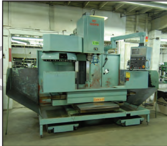
EUMACH MC1050 PB CNC VMC