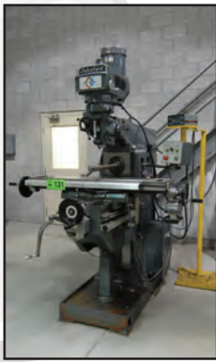
JOHNFORD 5VH turret mill