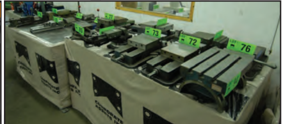
View of machine tool accessories