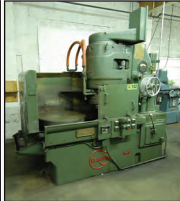
BLANCHARD NO. 18 rotary surface grinder