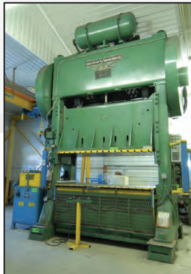
MCKAY/WARCO 250 ton S.S. press w/ feeder