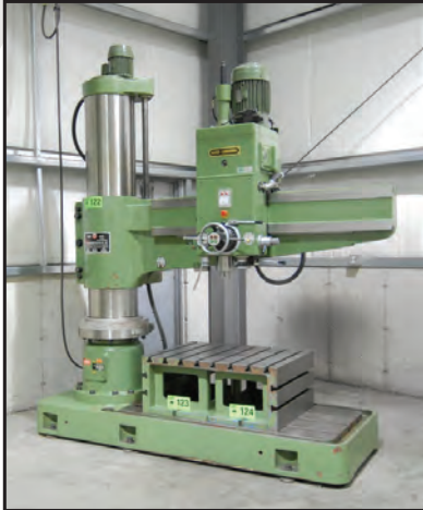
KAO MING KMR-1600 DH radial arm drill