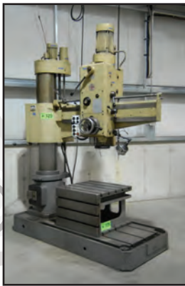
WMW 5' radial arm drill