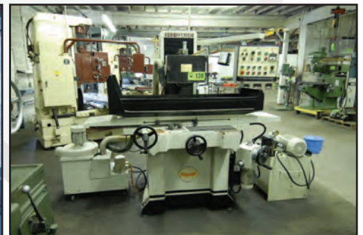
FREEPORT SGS1224 AHD grinder

AUCTION CONDUCTED BY CORPORATE ASSETS INC. For further information contact us at: 2 St. Clair Ave. W., Suite 1002, Toronto, Ontario, Canada M4V 1L5 Tel: (416) 962-9600 • Fax: (416) 962-9601 • Email: info@corpassets.com • Web: www.corpassets.com Toronto • Montreal • Chicago