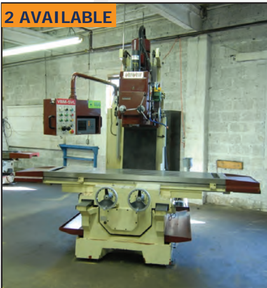
FORTWORTH VBM-5VL vertical mill