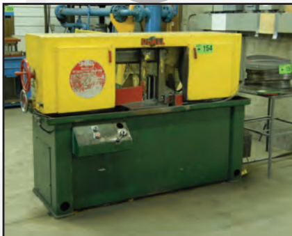
DOALL C-7 horizontal bandsaw