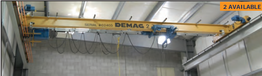
DEMAG 2 ton O.H. bridge crane