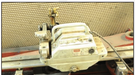
GRACO GK 171-90 track cutter

SEIKI vertical turret mill with 9" X 42" table, speeds to 4200 RPM, power table feed, s/n n/a