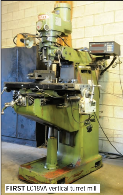
FIRST LC18VA vertical turret mill