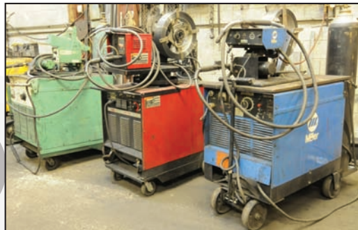
Partial view of welders available