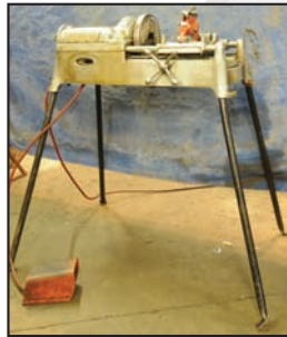
RIGID 535 power threader