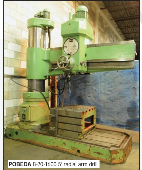
POBEDA B-70-1600 5' radial arm drill