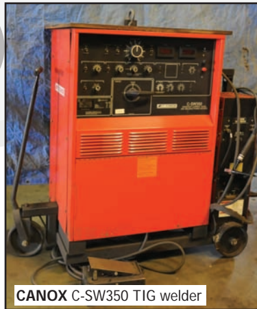
CANOX C-SW350 TIG welder