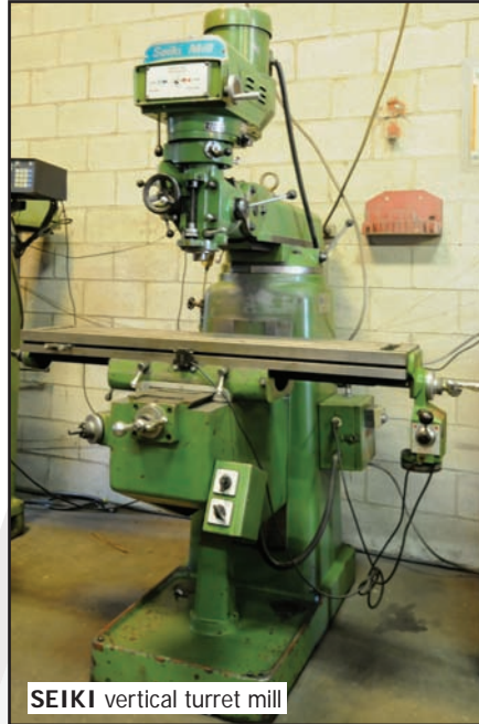
SEIKI vertical turret mill