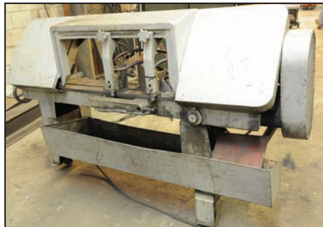
KALAMAZOO 13AW 17" horizontal band

CANOX C400 stick welder with wire feed, cable & gun s/n JF953023