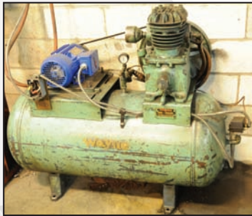
WAYNE 2 HP tank mounted piston type air compressor