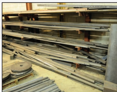
Partial view of steel inventory