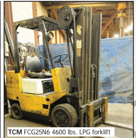
TCM FCG25N6 4600 lbs. LPG forklift