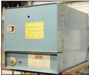
GRACO 125 rod oven