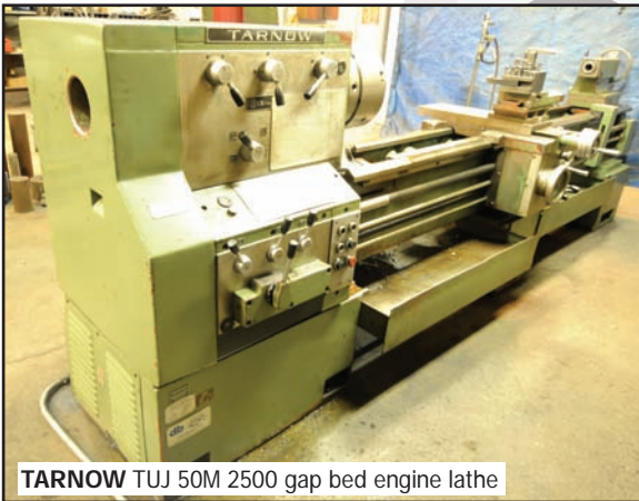
TARNOW TUJ 50M 2500 gap bed engine lathe