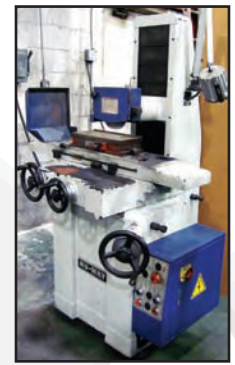
NU WAY 6" X 18" manual surface grinder