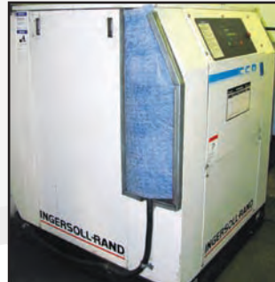
INGERSOLL RAND 30 HP air compressor