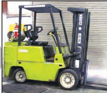
CLARK 7300 lbs. LPG forklift