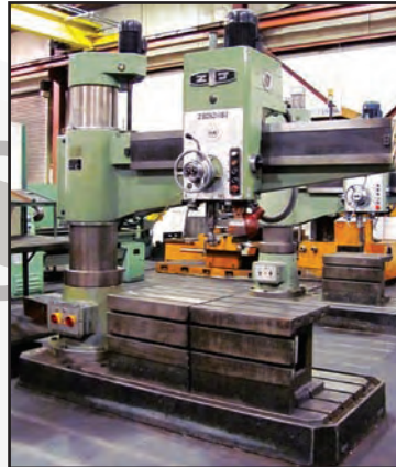
ZJ 4' radial arm drill