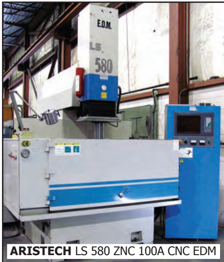
ARISTECH LS 580 ZNC 100A CNC EDM