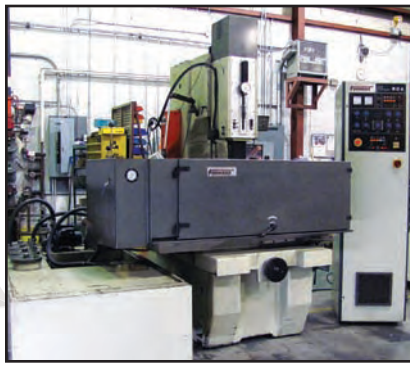
FORWARD M707M90A EDM