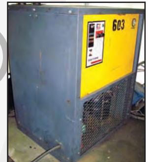
ZEKS air dryer