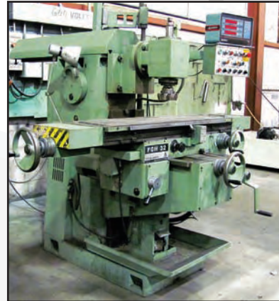
TOS FGH 32 horizontal milling machine