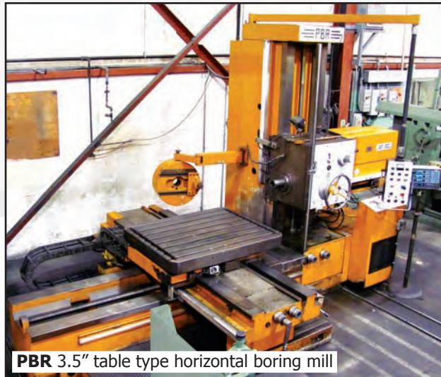
PBR 3.5" table type horizontal boring mill