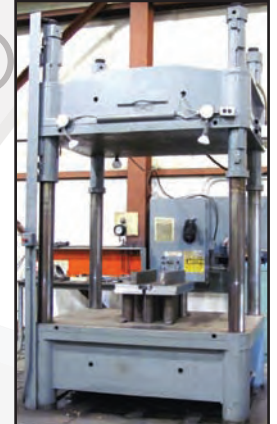
120 ton die spotting press