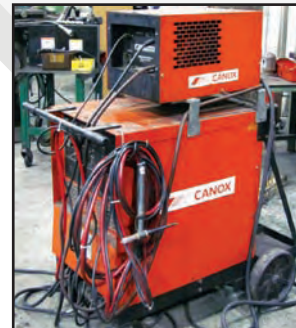
CANOX tig/stick welder