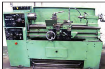
PINACHO 14" X 44" engine lathe