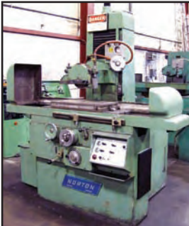
NORTON 12" X 24" hydraulic surface grinder