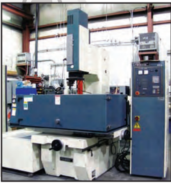
FORWARD NC707N600L90A CNC EDM