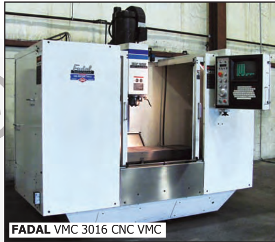
FADAL VMC 3016 CNC VMC