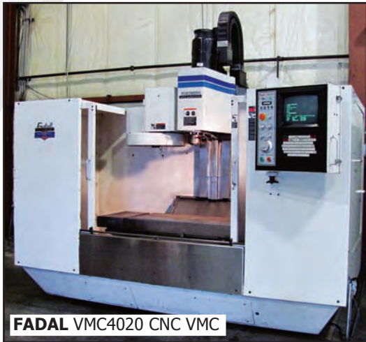
FADAL VMC4020 CNC VMC

Surplus to the Ongoing Needs of MANTEC TOOL AND MOULD INC.