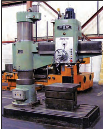
ZJ 5' radial arm drill