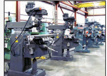
View of Turret mills