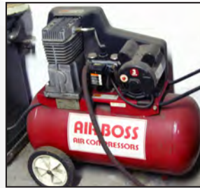
AIR BOSS 3HP air compressor