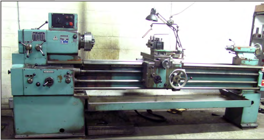
TOS 20"/26" X 80" gap bed engine lathe