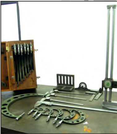
view of inspection equipment