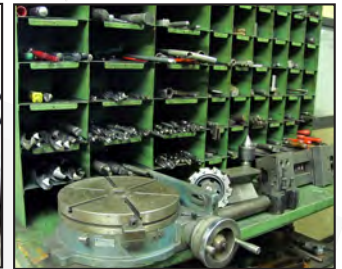
view of machine accessories & tooling