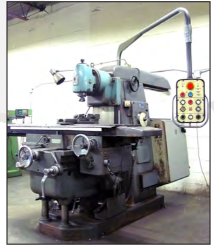
TOS FA5BH horizontal milling machine