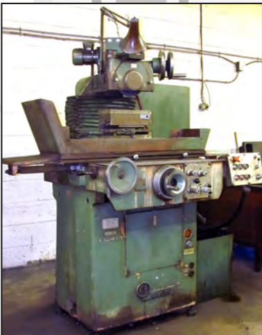
JOTES 8" X 18" hydraulic surface grinder