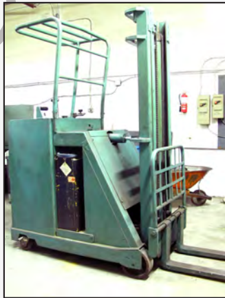
3000 lbs. electric lift truck