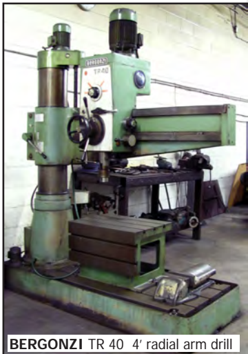
BERGONZI TR 40 4' radial arm drill