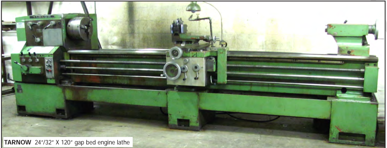
TARNOW 24"/32" X 120" gap bed engine lathe