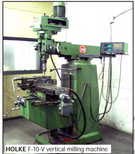
HOLKE F-10-V vertical milling machine