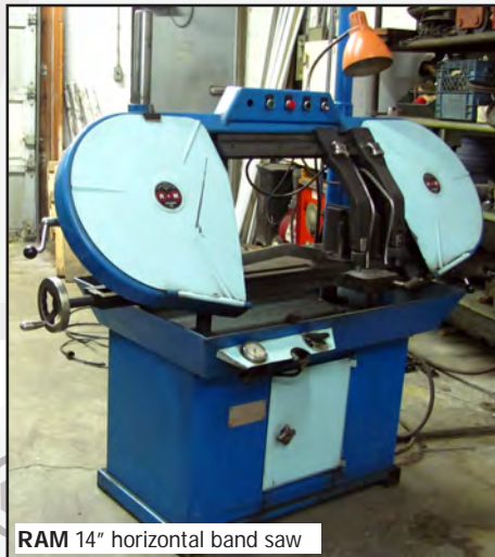
RAM 14" horizontal band saw