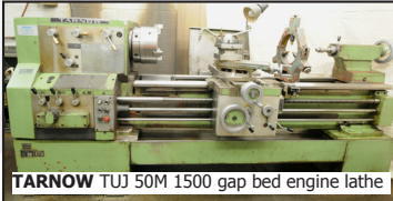
TARNOW TUJ 50M 1500 gap bed engine lathe