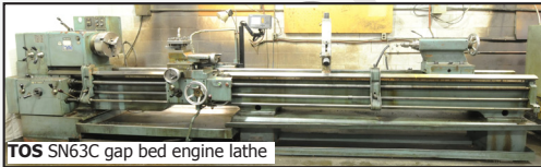
TOS SN63C gap bed engine lathe