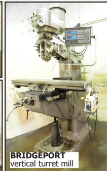
BRIDGEPORT vertical turret mill