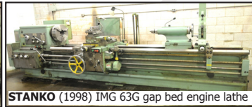
STANKO (1998) IMG 63G gap bed engine lathe