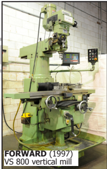
FORWARD (1997) VS 800 vertical mill

Surplus to the Ongoing Needs of BETHLEHEM MACHINING LIMITED