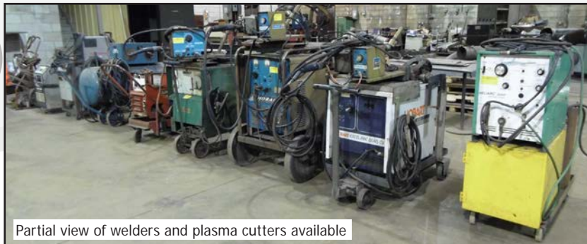
Partial view of welders and plasma cutters available