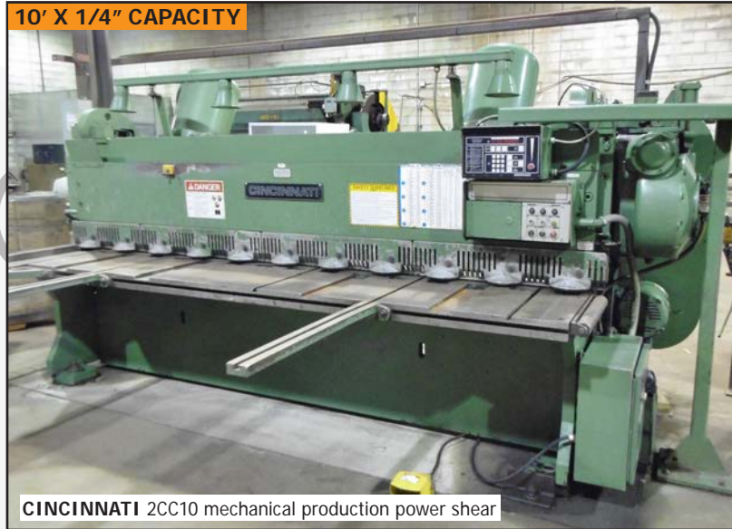
CINCINNATI 2CC10 mechanical production power shear