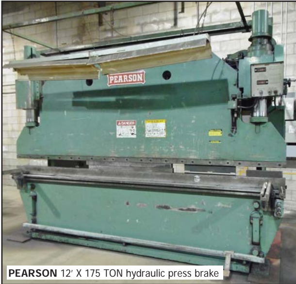
PEARSON 12' X 175 TON hydraulic press brake