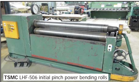
TSMC LHF-506 initial pinch power bending rolls