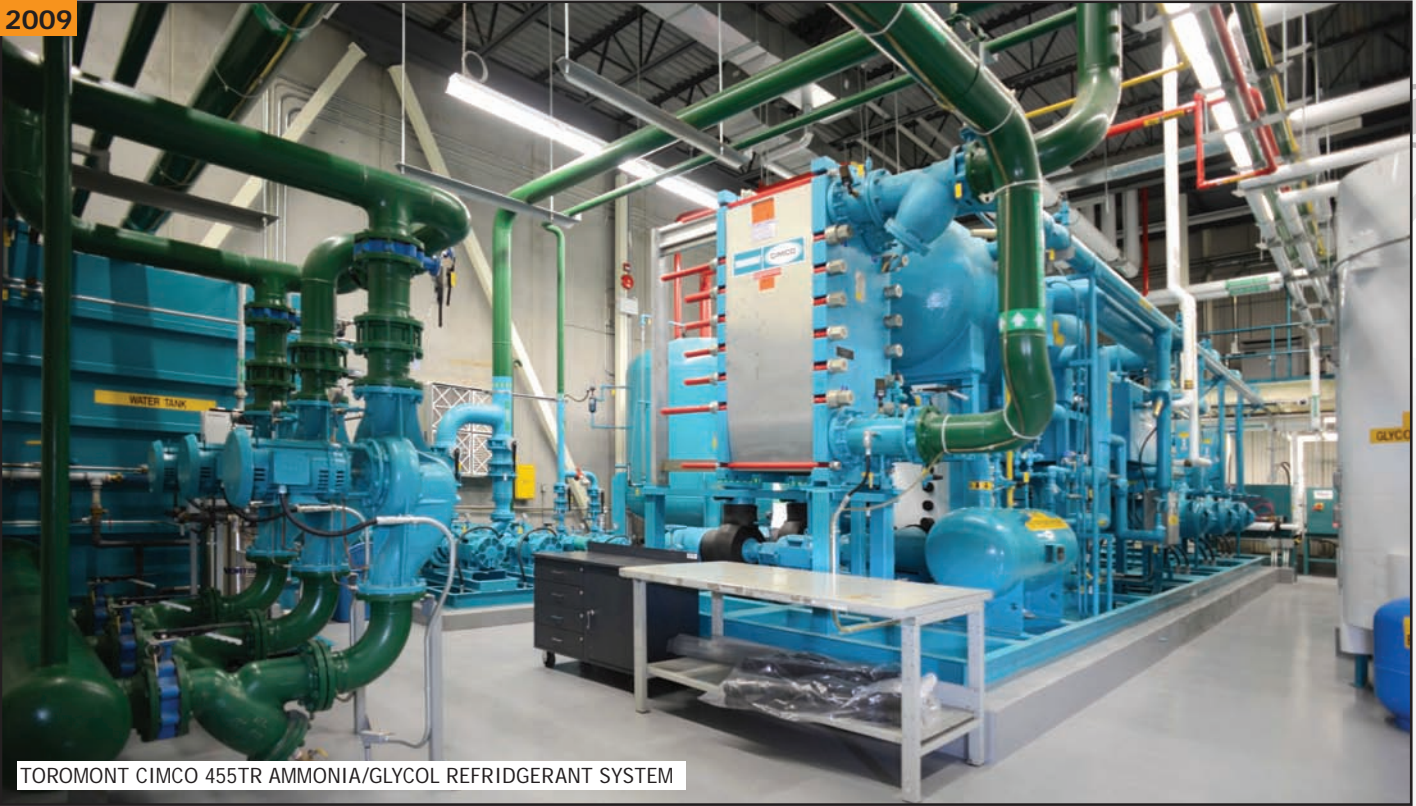
TOROMONT CIMCO 455TR AMMONIA/GLYCOL REFRIDGERANT SYSTEM

TOROMONT/CIMCO AMMONIA COOLED GLYCOL PLANT CONSISTING OF: (1) CUSTOM PACKAGED 406TR A/C REFRIGERATION SYSTEM AND (1) CUSTOM PACKAGED 17TRX2 COOLER REFRIGERATION SYSTEM. BOTH SYSTEMS ARE MOUNTED ON STRUCTURAL STEEL SKIDS, AND CAN BE EASILY DISASSEMBLED FOR EASE OF SHIPPING AND RE-INSTALLATION. SYSTEMS CONSIST OF COMPRESSORS, COOLING TOWER & CHILLERS, SURGE DRUMS, CONDENSERS, HEAT EXCHANGERS, SKIDDED PUMP SYSTEMS, ELIMINATORS, WATER DISTRIBUTION SYSTEMS, AIR HANDLING FANS, DAMPERS, MOISTURE ELIMINATORS, DILUTION TANKS & MORE!