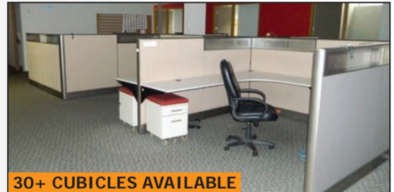
30+ CUBICLES AVAILABLE