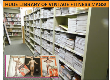
HUGE LIBRARY OF VINTAGE FITNESS MAGS!