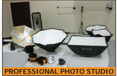
PROFESSIONAL PHOTO STUDIO