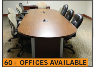
60+ OFFICES AVAILABLE