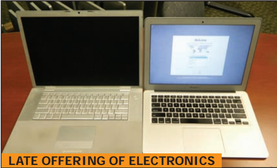
LATE OFFERING OF ELECTRONICS