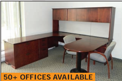
50+ OFFICES AVAILABLE